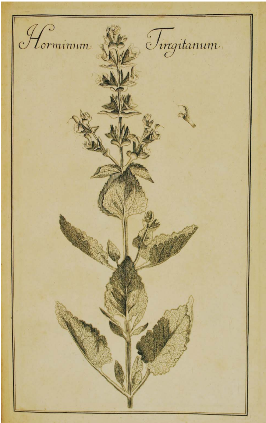
Fig. 2. The exclusive plate of “Horminum tingitanum” (Rivinus 1690: t. 62) in a copy held at the Universitätsbibliothek Erlangen-Nürnberg; to this plate Etlinger (1777) referred in the original description of Salvia tingitana .