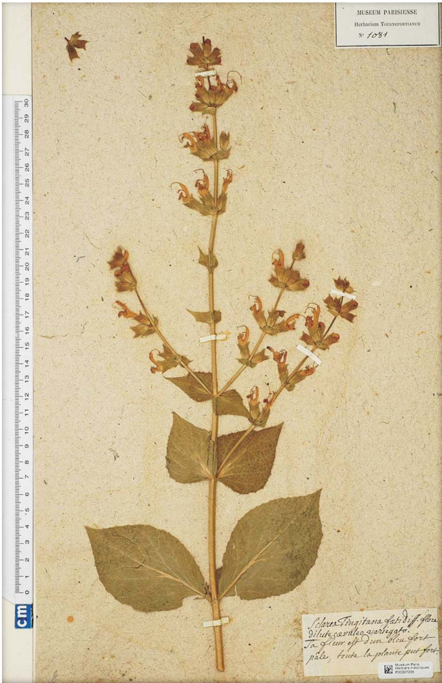
Fig. 3. Tournefort's specimen (at P), the designated lectotype of Salvia tingitana .