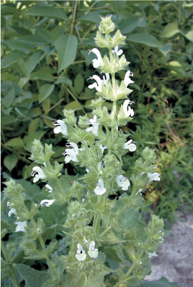
Fig. 5. Inflorescence of a cultivated plant of Salvia tingitana .