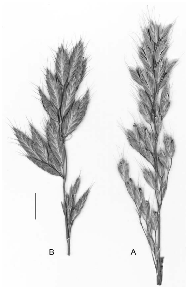
Fig. 1. A: Bromus parvispiculatus (from the holotype, Willing 87413). – B: B. hordeaceus subsp. mediterraneus (France, Var, 1860, F. Schultz, herbarium normale, nov. Ser. Cent. 13, No. 1272 as B. molliformis ). – Scale bar = 1 cm.

of glumes and lemmas on drying, a relative high lemma awn insertion of 0.5-1.7 mm below the obtuse or short-bilobed lemma apex as well as the more or less spreading, softly and densely long-hairy indumentum at least on the lower leaf sheaths (except for B. hordeaceus subsp. longipedicellatus , a probably hybrid derivative; Spalton 2001). The interrelationships of all these taxa are obscure. Some similarities in the loose panicle configuration of B. hordeaceus subsp. pseudothominei (6.5-8 mm long lemmas; the mostly non-weedy subsp. thominei , similar in lemma size, differs, e.g., by its compact inflorescences!) and B. parvispiculatus may one lead to the assumption that the latter is the Mediterranean vicariant of the more northerly distributed subsp. pseudothominei and should therefore better be treated as a subspecies of B. hordeaceus .