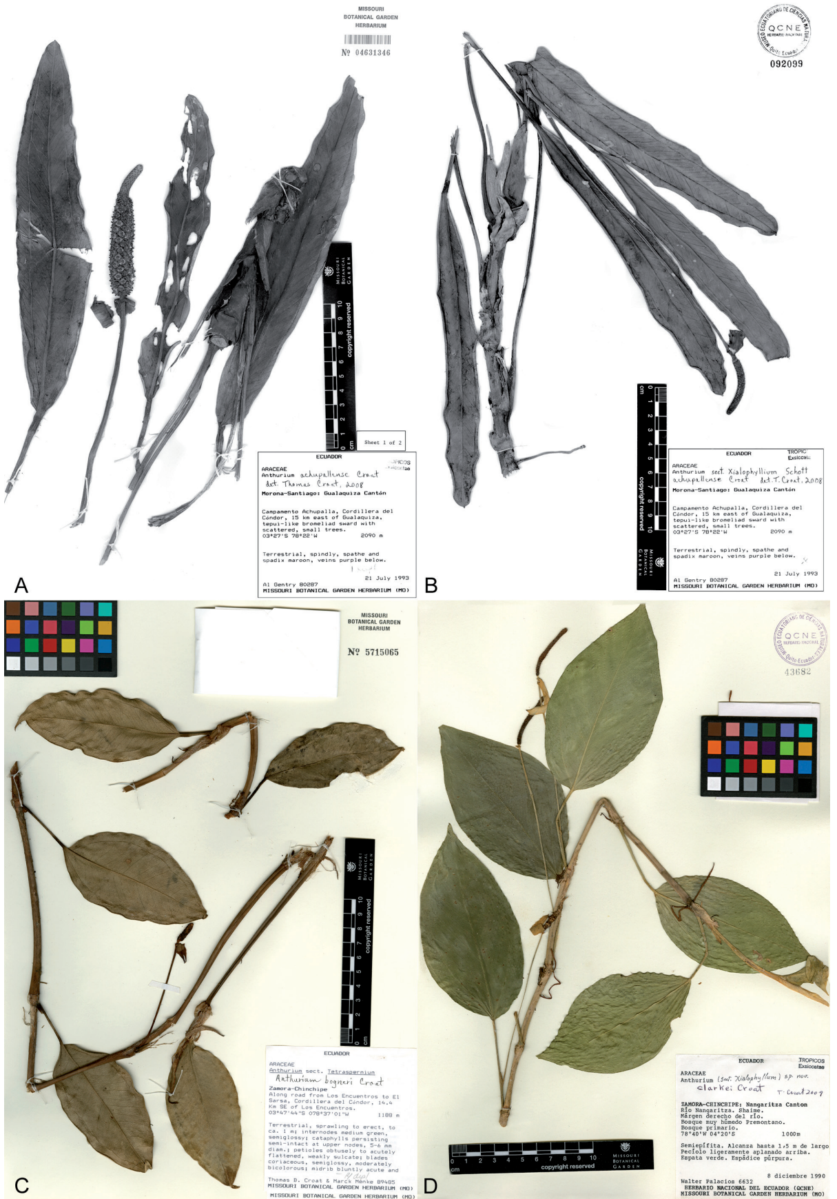
Fig. 1. A–B: Anthurium achupallense – holotype specimen at MO, Gentry 80287 (A), isotype specimen at QCNE (B); C: A. bogneri – holotype specimen at MO, Croat & Menke 89485; D: A. clarkei – isotype specimen at QCNE, Palacios 6632.