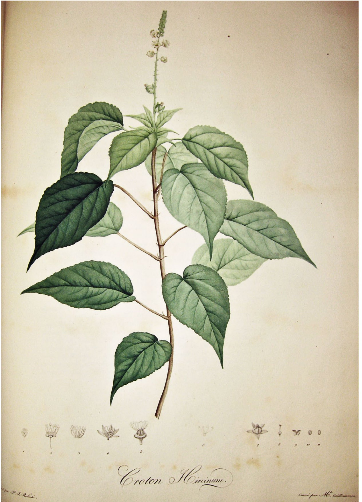
Fig. 1. Illustration of Croton hircinus in Ventenat (1803: t. 50), the designated lectotype of C. hircinus . – Reproduced with permission from the Library of the Gray Herbarium, Harvard University, Cambridge, Massachusetts, U.S.A. Downloaded From: https://bioone.org/journals/Willdenowia on 27 Apr 2024 Terms of Use: https://bioone.org/terms-of-use