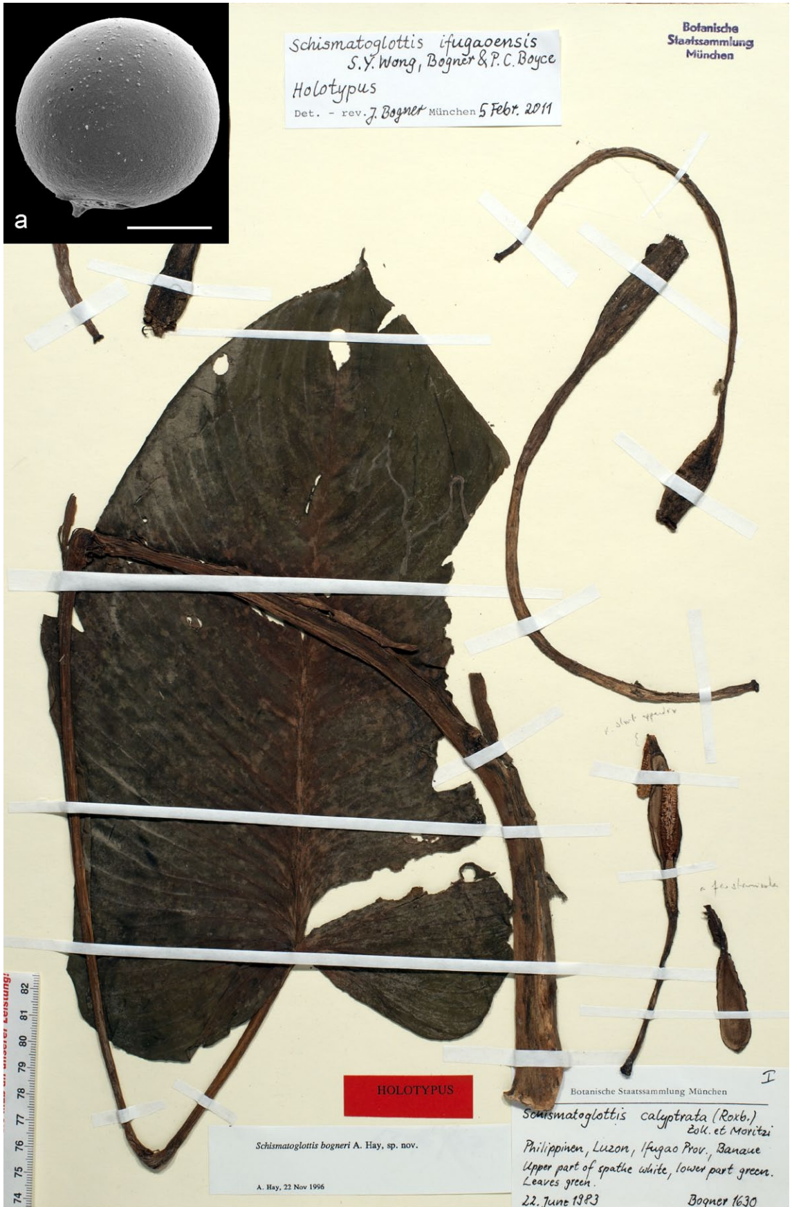
Fig. 2. Schismatoglottis ifugaoensis – holotype Bogner 1630 at M; a: pollen grain. – Photograph by F. Höck; SEM micrograph (a; scale bar = 10 µm) by M. Hesse & S. Ulrich.