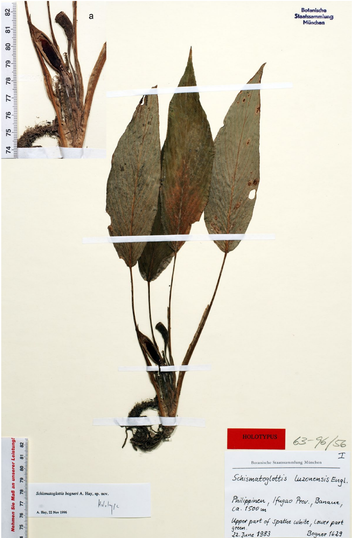
Fig. 3. Schismatoglottis bogneri – holotype Bogner 1629 at M; a: inflorescence enlarged.