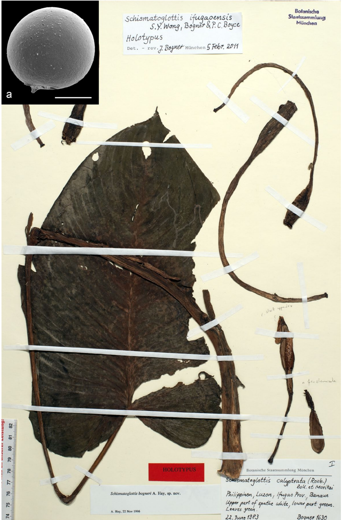
Fig. 2. Schismatoglottis ifugaoensis – holotype Bogner 1630 at M; a: pollen grain. – Photograph by F. Höck; SEM micrograph (a; scale bar = 10 µm) by M. Hesse & S. Ulrich.