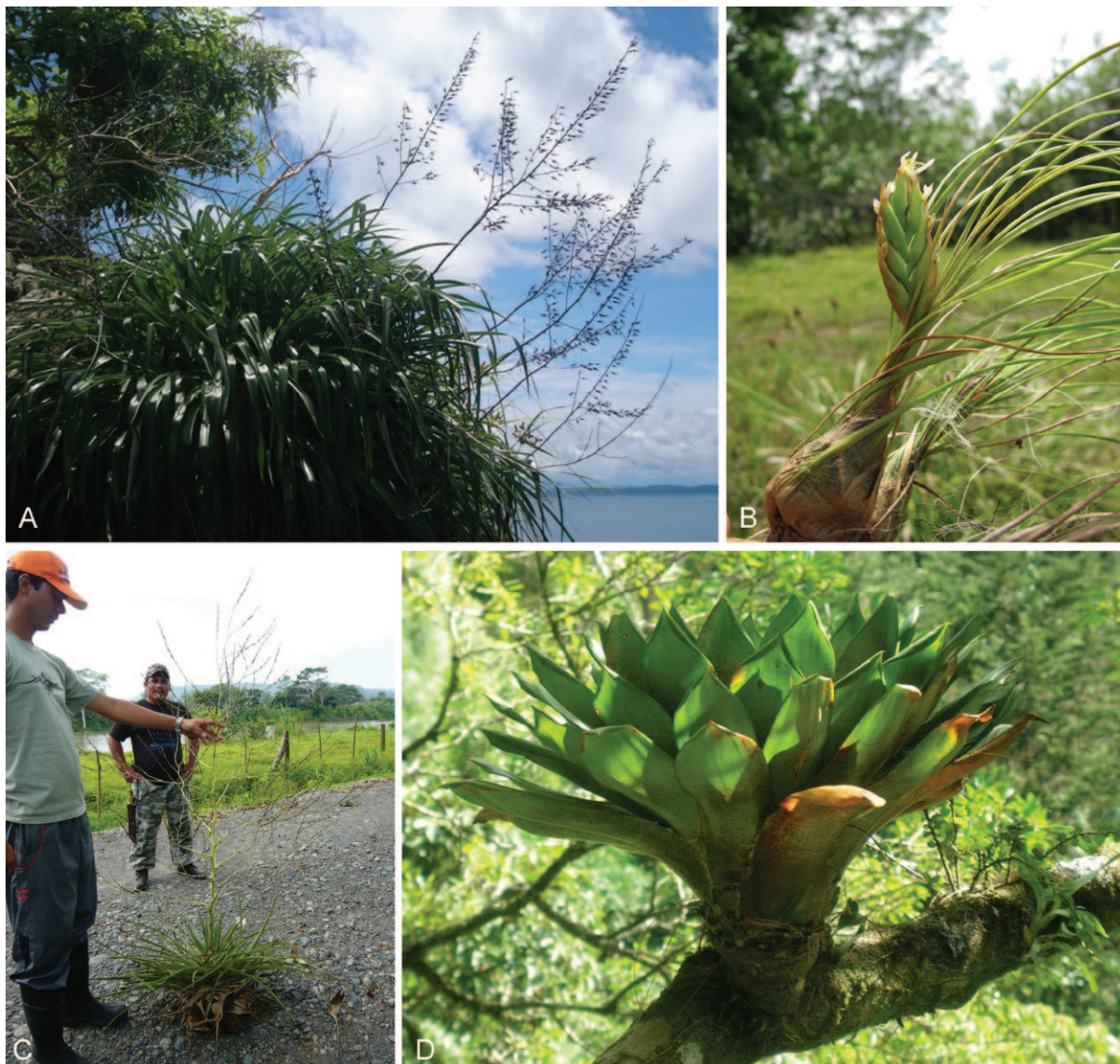
Fig. 2. A: Pitcairnia halophila, Gulf of Chiriqui Marine National Park, Paridas Islands; B: Tillandsia dexteri, Remedios Distr.; C: T. utriculata, Changuinola Distr., after the community of El Silencio; D: Werauhia paniculata, Boquete Distr., El Pianista Trail to Culebra.