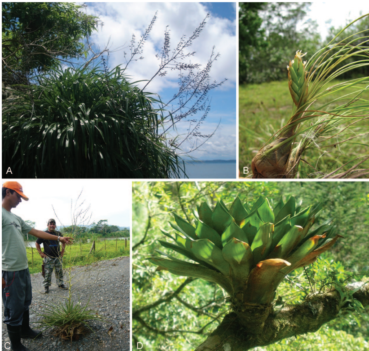
Fig. 2. A: Pitcairnia halophila, Gulf of Chiriqui Marine National Park, Paridas Islands; B: Tillandsia dexteri, Remedios Distr.; C: T. utriculata, Changuinola Distr., after the community of El Silencio; D: Werauhia paniculata, Boquete Distr., El Pianista Trail to Culebra.