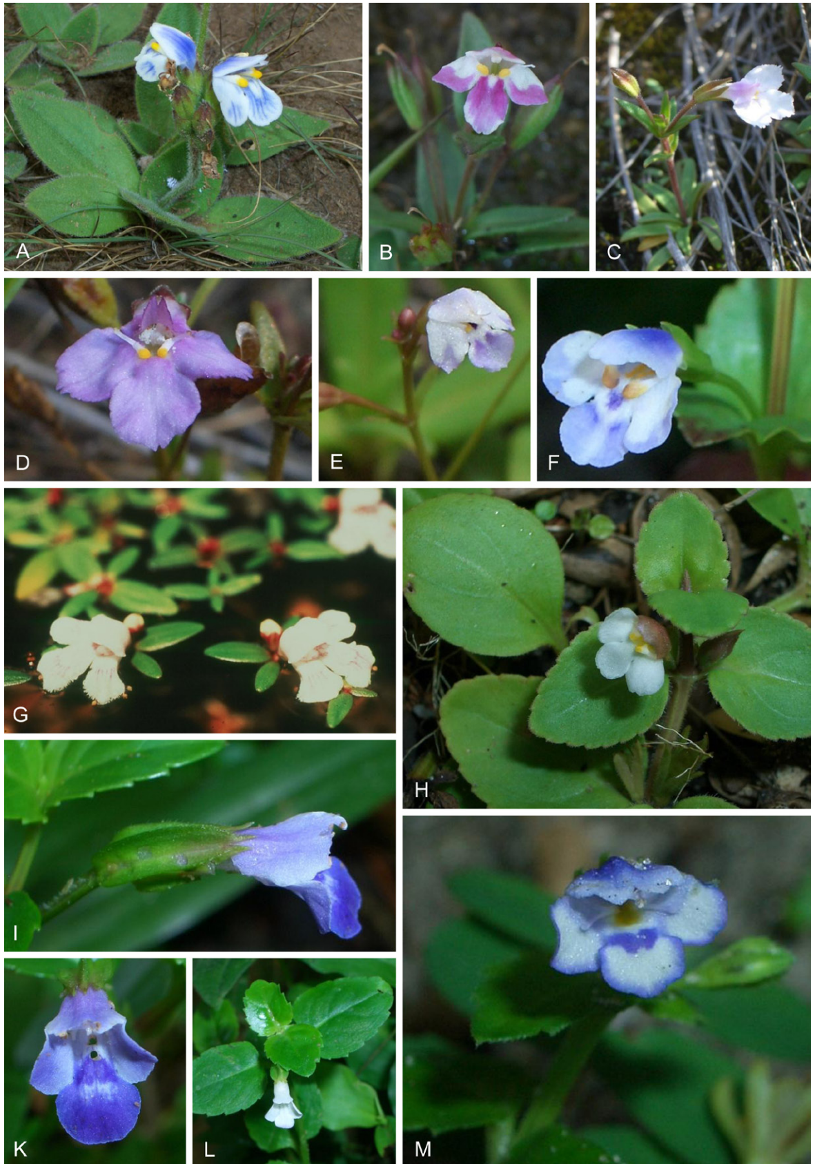
Fig. 1. Linderniaceae – A: Craterostigma hirsutum, Rwanda; B: Linderniella pygmaea, Madagascar; C, D: Linderniella horombensis, Madagascar; E: Linderniella gracilis, Rwanda; F: Linderniella brevidens, Kenya; G: Chamaegigas intrepidus, Namibia; H: Vandellia diffusa, Gabon; I, K: Torenia stolonifera, Madagascar; L: Torenia thouarsii, Gabon; M: Torenia crustacea, Gabon.