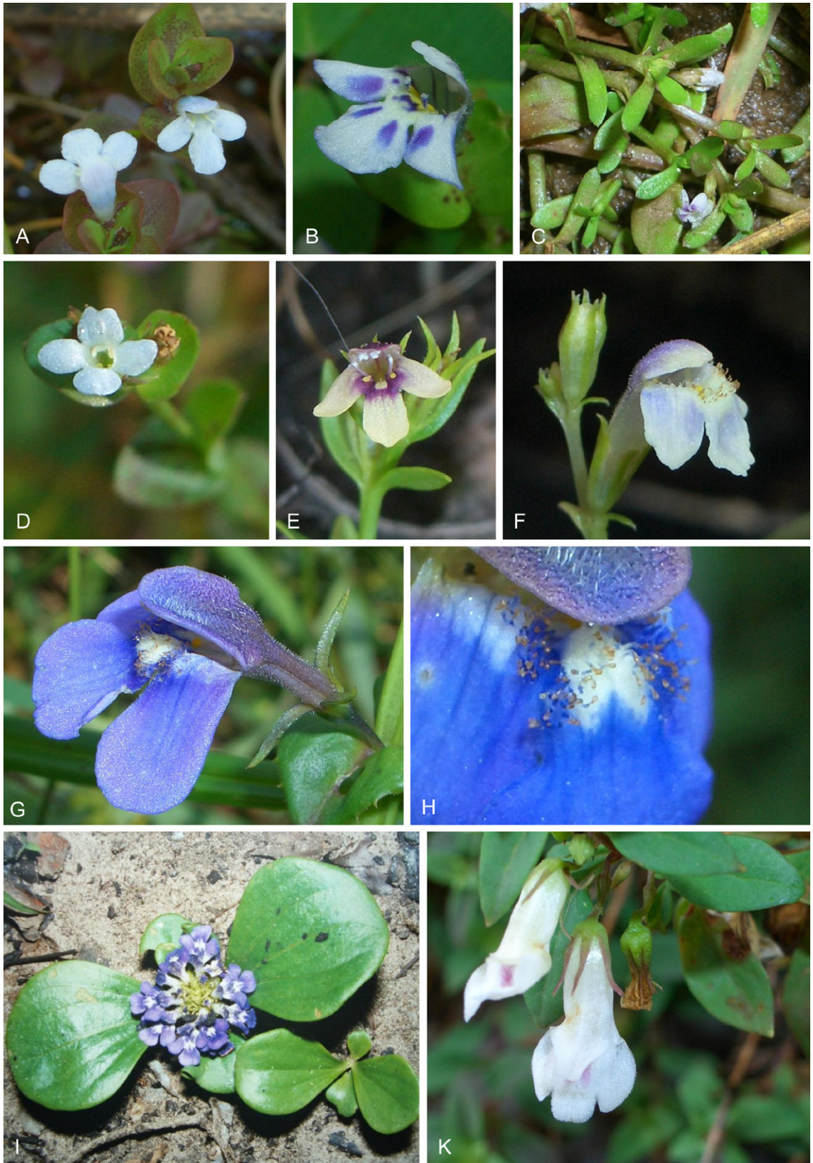
Fig. 2. Linderniaceae – A: Lindernia viguieri, Madagascar; B: Lindernia rotundifolia, Madagascar; C: Lindernia benthamii (= Bryodes micrantha), Madagascar; D: Lindernia madagascariensis (= Psammeter madagascariensis), Madagascar; E: Crepidorhopalon microcarpaeoides, Madagascar; F: Crepidorhopalon tenuis, Congo-Kinshasa; G, H: Crepidorhopalon whytei, Rwanda; I: Hartliella capitata, Congo-Kinshasa; K: Stemodiopsis ruandensis, Rwanda.