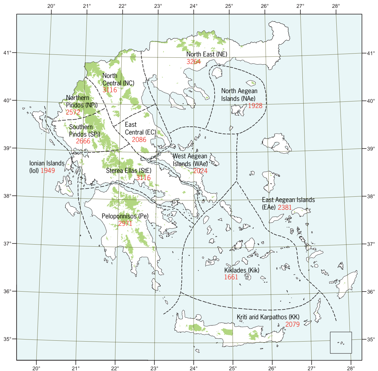
Fig. 1. Vascular plant species in each of the 13 floristic regions of Greece.

descending order. The floristic regions of NPi, KK, WAe and IoI each have the same number of families (146 families) (Table 2).