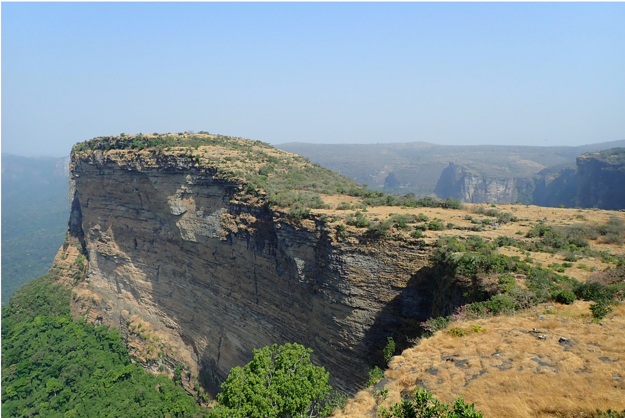
Fig. 6. Submontane wooded grassland vegetation in the Kounounkan Massif. Gladiolus mariae was collected on this 1020 m high hill and was also observed there, growing on vertical sandstone cliffs. In some years the vegetation on the hill is not subject to the annual dry season fires because it is separated from the main plateau by a narrow, 350 m long canyon. – Photograph taken on 7 Feb 2019 by Xander van der Burgt.

In Afromontane shrubland, fire has often favoured the spread of grasses at the expense of the shrubs (White 1983: 49). Anthropogenic fires are usually ignited in the dry season when lightning-ignited fires would not normally occur (Archibald & al. 2012) and have a large influence on species composition and structure of the vegetation (Bond & al. 2005; Staver & al. 2011).