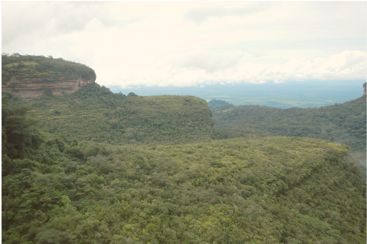
Fig. 4. Submontane forest and shrubland vegetation at 850 m altitude in the Kounounkan Massif. Both vegetation types are dominated by species that are not resistant to fire. The shrubland vegetation blends gradually into the surrounding submontane forest.