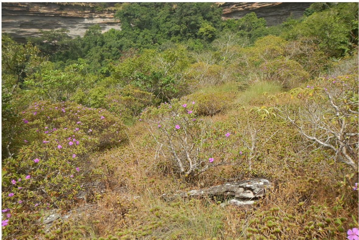
Fig. 5. Inside the submontane shrubland vegetation of Fig. 4. Gladiolus mariae occurs abundantly in this vegetation type. The vegetation is dominated by shrubs that are not resistant to fire: Cailliella praerupticola (in flower), Dissotis leonensis (both Melastomataceae ) and Microdracoides squamosa ( Cyperaceae ). Grasses ( Poaceae ) are infrequent; the only grass visible is Rhytachne perfecta , front and centre right.