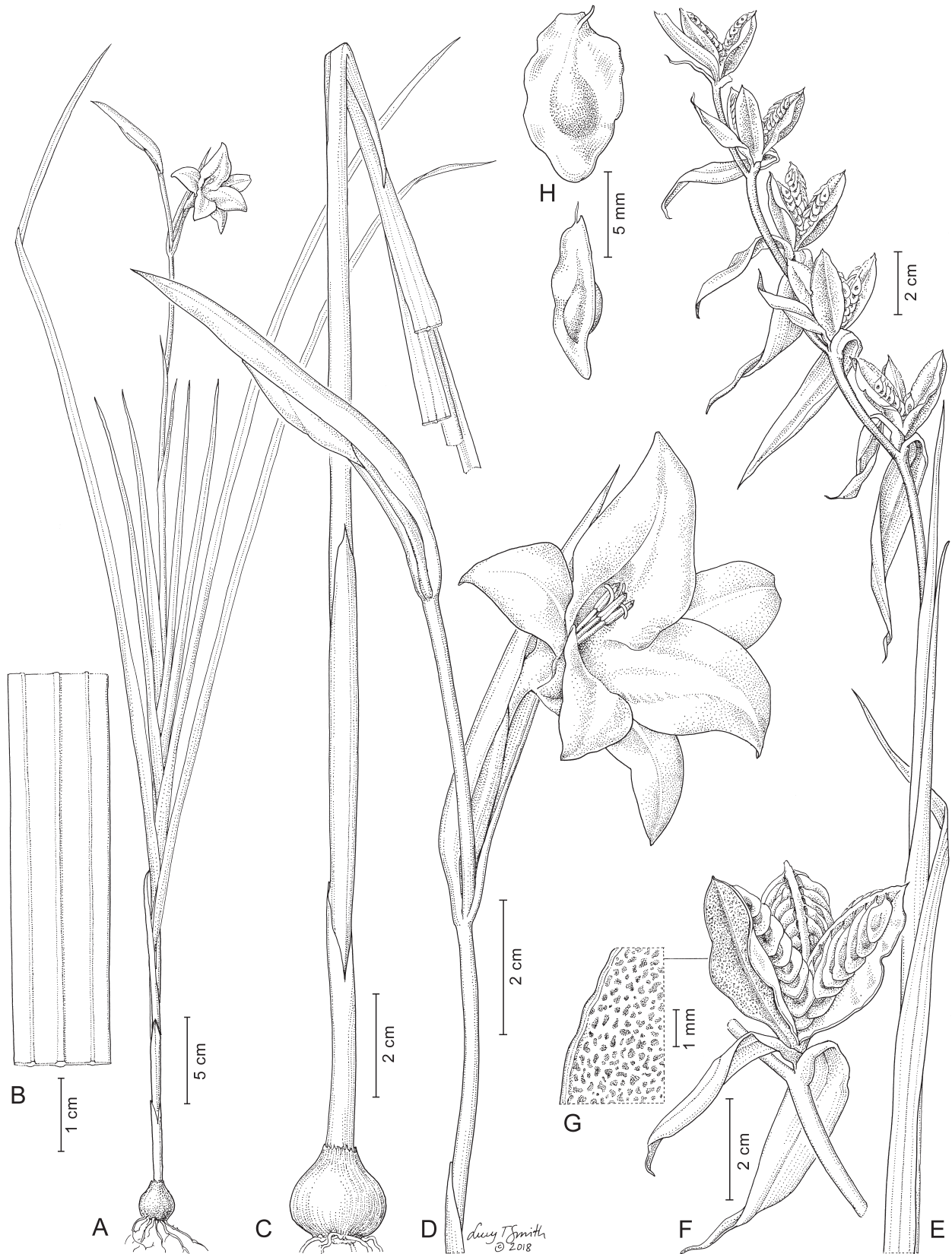
Fig. 2. Gladiolus mariae – A: flowering plant; B: detail of leaf; C: base of plant showing corm and 3 cataphylls; D: upper part of plant with an open flower and a flower bud; E: upper part of fruiting plant with 5 mature fruits; F: mature, open fruit with seeds; G: detail of dotted epidermis of fruit; H: seeds. – Origin: A–D from Burgt & Haba 2012 (type gathering); E–H from Burgt 2161. – Drawing by Lucy T. Smith.