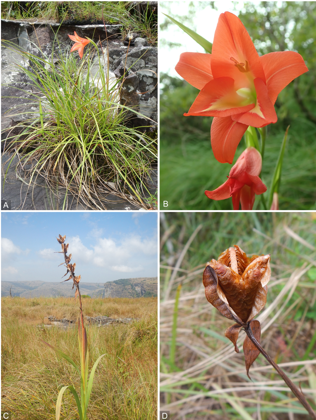
Fig. 1. Gladiolus mariae – A: habit of flowering plant; B: flowers; C: fruiting plant; D: fruit. – Origin: A from Burgt & Haba 2012 (type gathering); B from Burgt 2207 ; C, D from Burgt 2161 . – All photographs by Xander van der Burgt.