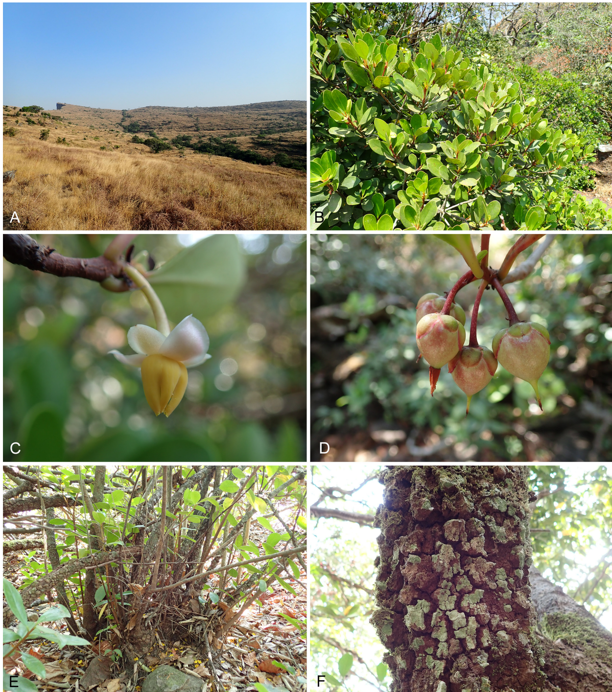
Fig. 2. Ternstroemia guineensis – A: habitat, submontane gallery forest in sparsely wooded grassland; B: habit; C: flower; D: fruits; E: base of a multi-stemmed shrub; F: bark of a tree, trunk c. 18 cm in diam. – Photos: Republic of Guinea, Kounounkan Massif, Feb 2019, Xander van der Burgt.

concave, thick, leathery, outer surface wrinkled when dry, unequal, outer pair suborbicular, c. 4.5 \times 5.2 mm, leathery, margin scarious, 0.5–1 mm wide, erose, apex rounded or retuse, sometimes with mucro 0.3–0.4 mm long, inserted adaxially below margin; inner sepals ovate, c. 6.5 \times 6 mm, mucro absent, margin as outer sepals. Petals 5 (or 6), yellow or yellowish white, together forming a short cylinder enclosing stamens, petals imbricate, connate in basal \frac{1}{4} (for 1.7–2 mm, Fig. 1F, 2C), each nar-