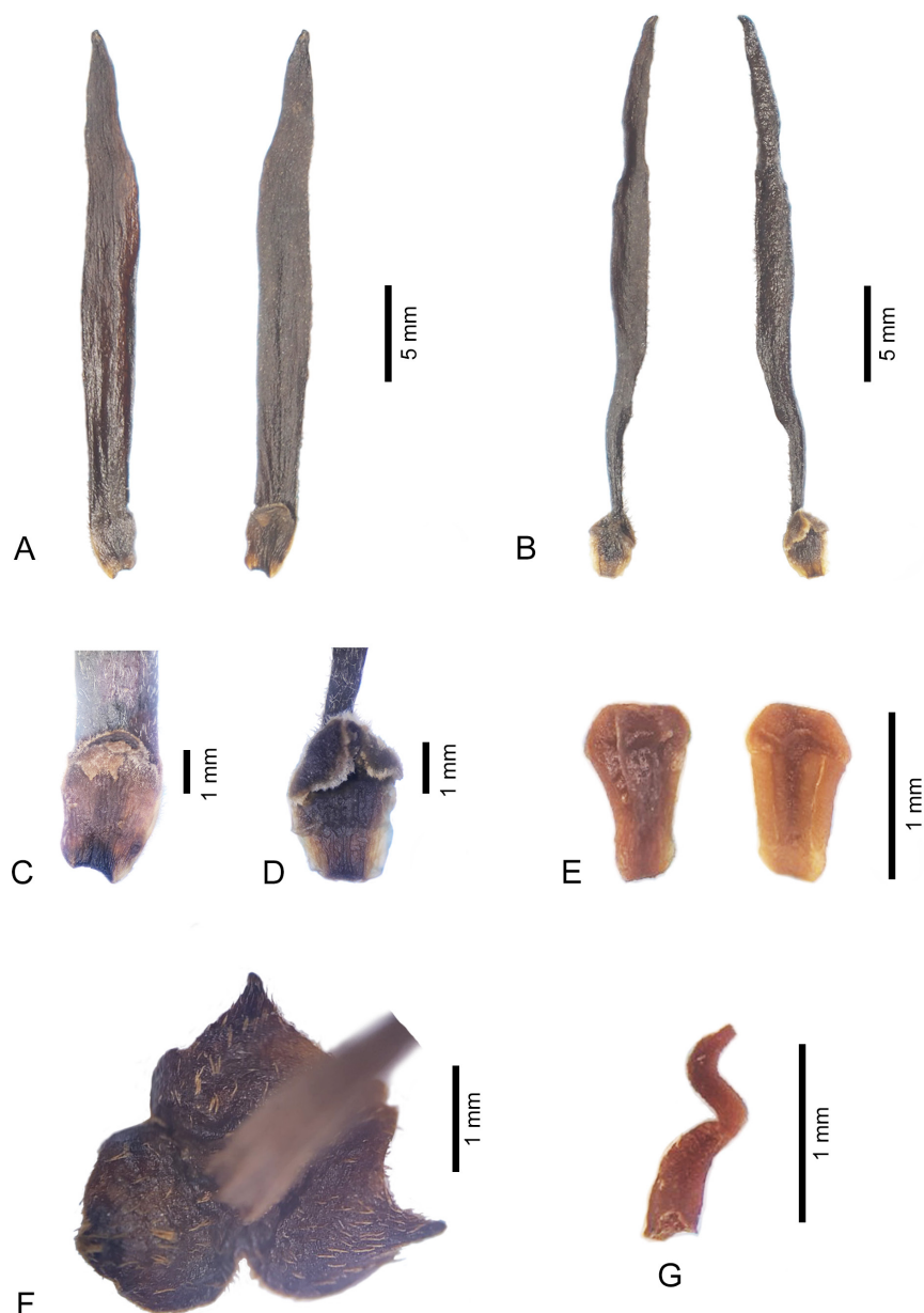
Fig. 5. Flowering organs of Artabotrys angustipetalus . – A: abaxial side of outer petal (left), adaxial side of outer petal (right); B: abaxial side of inner petal (left), adaxial side of inner petal (right); C: adaxial side of outer petal claw; D: adaxial side of inner petal claw; E: adaxial side of stamen (left), abaxial side of stamen (right); F: view from above showing sepals; G: carpel.

Conservation status — DD (Data Deficient) according to IUCN (2012) because this species is known from only two collections. Further explorations are required before an assessment can be made.