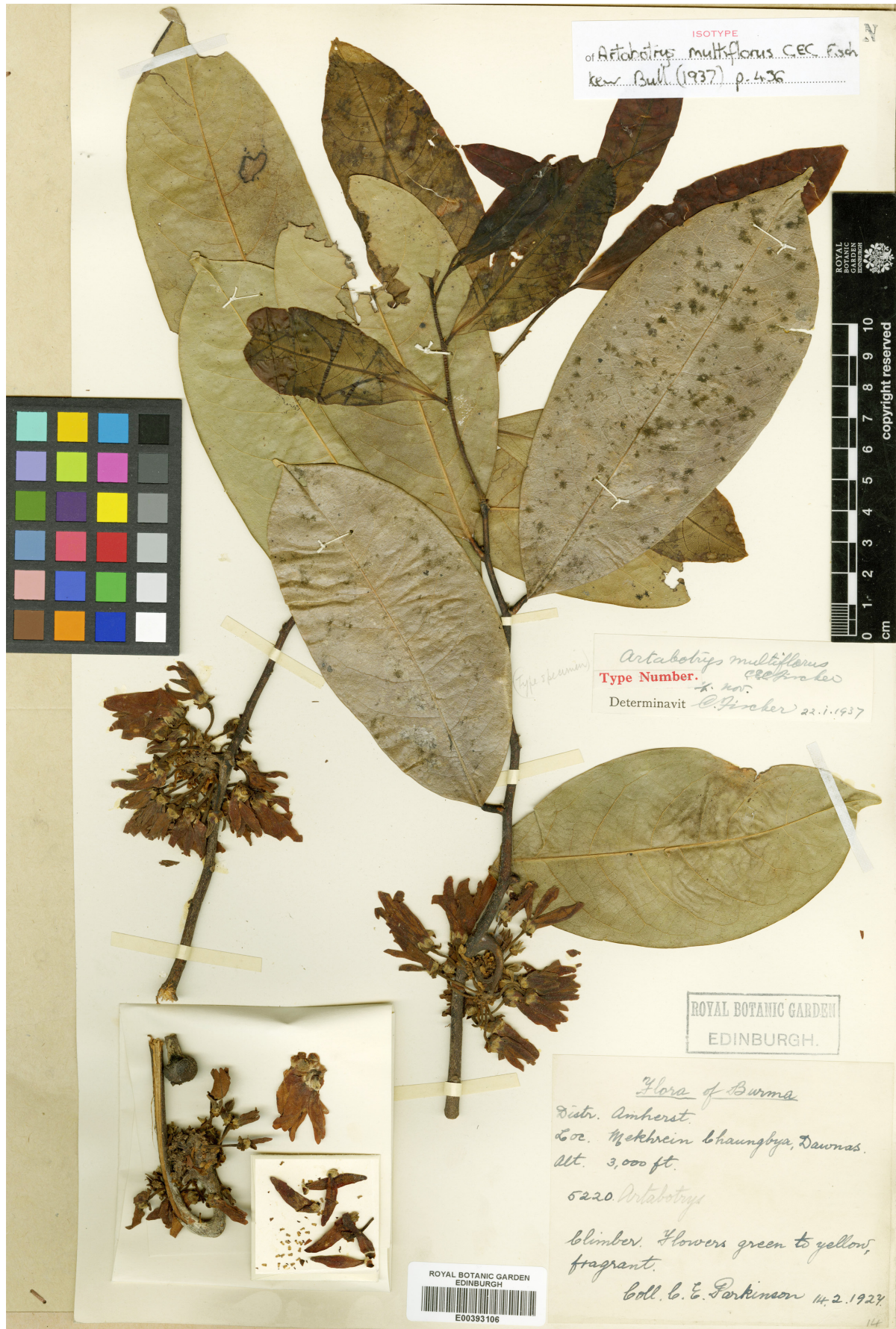
Fig. 4. Isotype of Artabotrys multiflorus C. E. C. Fisch. – Parkinson 5220 (E [E00393106]).