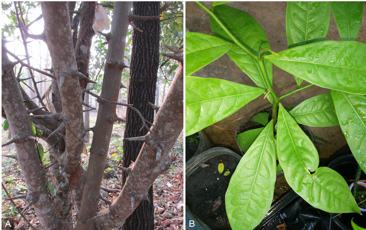
Fig. 6. Thorns of Artabotrys species. – A: pairs of thorns at lower part of stems of A. siamensis [= A. siamensis -1]; B: thorn as a second plagiotropic branch of a sapling of Artabotrys sp.

tionally, as demonstrated by Fisher & al. (2002), light plays an important role for thorn development in A. hexapetalus , i.e. the more shaded the areas, the more thorns are developed. It seems that there is more driving force for plants in shaded areas to grow orthotropic branches up above to reach light and find support from other plants. Therefore, the growth of the less necessary plagiotropic branches is possibly minimized by developing more thorns instead. The orthotropic branches of the thorn-bearing species of Artabotrys can grow very fast and at some point after they reach other plants, fewer thorns but more plagiotropic branches with hooks are developed (personal observations). Regarding thorns in a few species of Annona , mentioned above, further ontogenetic study is indispensable to ascertain if they are homologous with thorns in Artabotrys species because the branching architecture of Annona is distichous, without the distinction between orthotropic and plagiotropic branches, whereas the branching architecture of Artabotrys is spiral, with the distinction between orthotropic and plagiotropic branches (Johnson 2003).