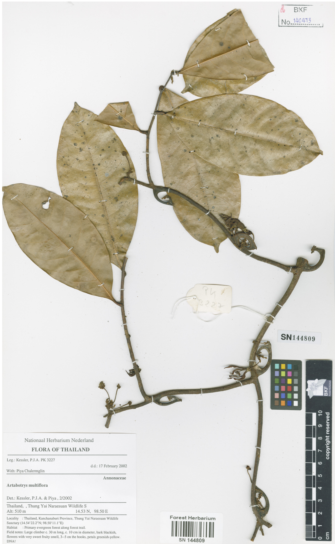
Fig. 3. Holotype of Artabotrys angustipetalus Photikwan & Chaowasku – Kessler PK 3227 (BKF [SN144809]).