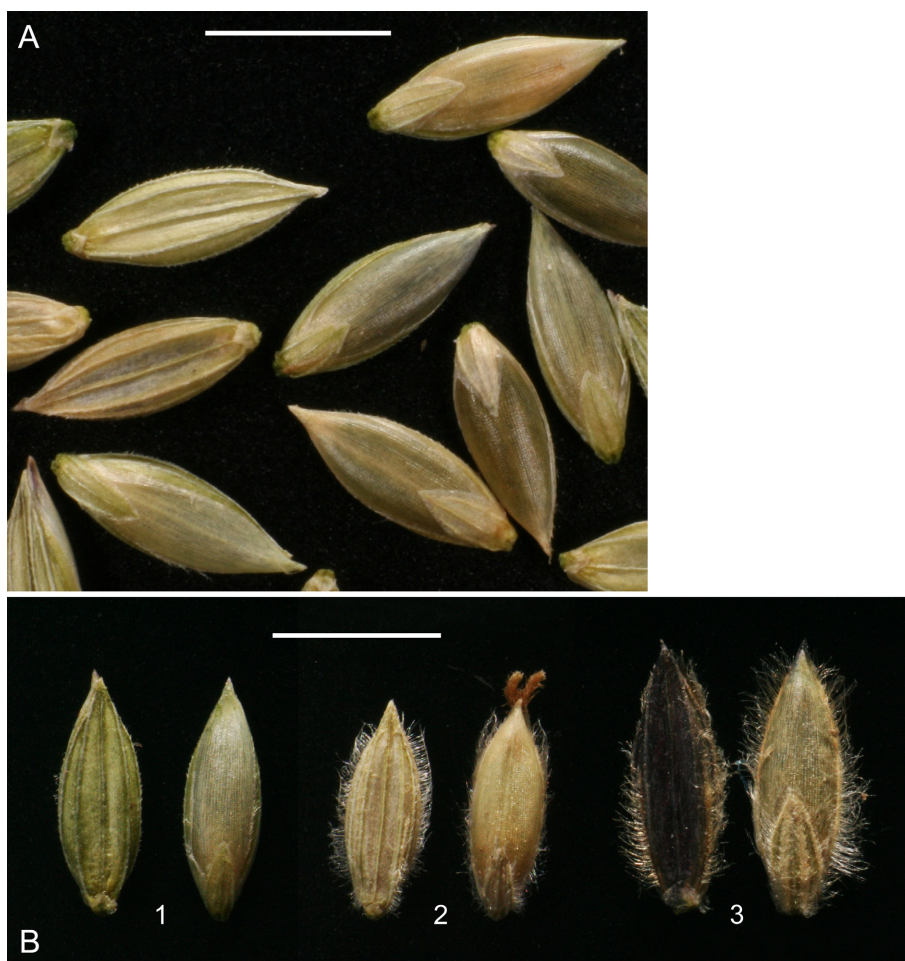
Fig. 3. A: spikelets of Digitaria aegyptiaca subsp. aegyptiaca ; B: comparison of spikelets of D. aegyptiaca subsp. aegyptiaca (1), D. sanguinalis var. parvispicula (2); and D. sanguinalis var. sanguinalis (3). – Scale bars: A, B = 2 mm. – Source of material: Spain, Santiago de Compostela (A, B1); Germany, Bamberg (B2, B3).