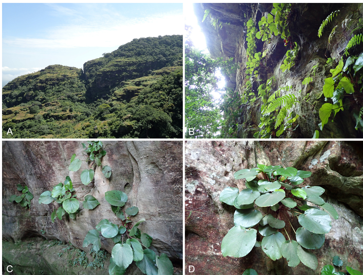
Fig. 3. Benna alternifolia – A: the largest population was found in a deep canyon, of which the upper part is visible at the centre of the photograph, on a 1040 m-high hill on the Benna Plateau; B: plants in their habitat, on vertical rock in deep shade, under overhanging rocks, out of reach of falling rain drops, but within reach of permanently seeping water; C: group of four plants; D: single plant. – Origin: A, C from Burgt & al. 2274 (type gathering); B from Burgt & al. 2323; D from Burgt & Haba 2333. – All photographs by Xander van der Burgt.

the other African (including Madagascan) Sonerileae genera (Fig. 1), all of which were sampled in the present study. They are weakly supported (BS 57%) as sister to the South American genus Phainantha . Of the six currently accepted American Sonerileae genera, only three genera were sampled in the present study.