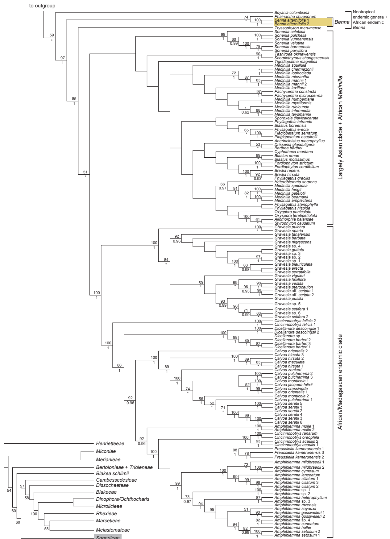
Fig. 1. Phylogeny showing the position of Benna alternifolia within the tribe Sonerileae.