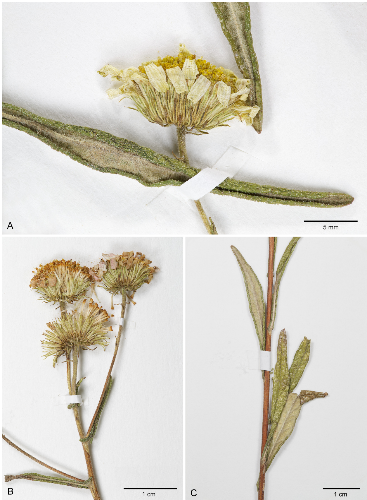
Fig. 4. Vicoa anisopappoides – A: capitulum and revolute leaves; B: synflorescence with three capitula; C: xeromorphic leaves with bullate, scabrid upper surface, revolute margins and white tomentose lower surface. – A–C: from the holotype, PH & al. 6033 (S S07-16156), photographs by Jennifer Kearey.