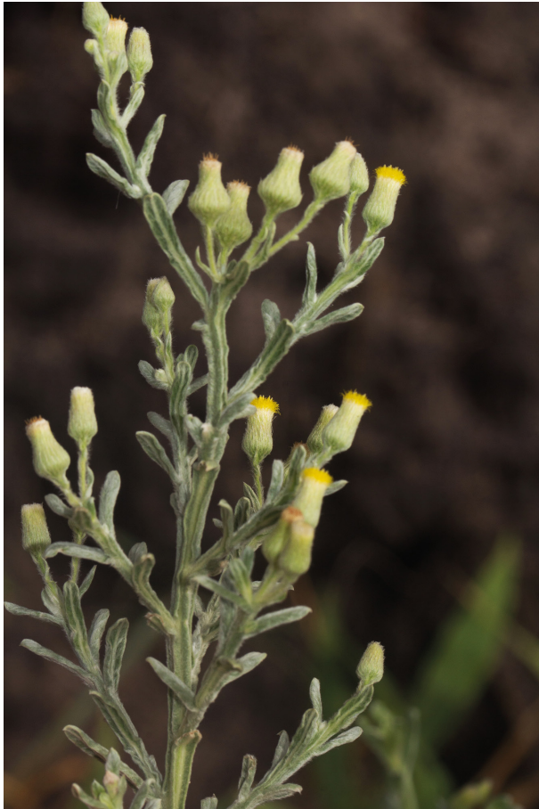
Fig. 6. Galgera decurrens – Namibia, Caprivi Strip, Bukalo, 31 Jan 2018.

This genus is a member of the Inuleae–Plucheinae related to, e.g., Nicolasia S. Moore and Doellia Sch. Bip. ex Walp. in the large “Plucheoid” clade mentioned above (Nylinder & Anderberg 2015; Fig. 2). Laggera species (Anderberg 1991) have winged stems or at least long decurrent leaf bases, florets with purple or pink corollas, and styles with obtuse sweeping-hairs extending below the bifurcation. Nylinder & Anderberg (2015) found that Laggera was polyphyletic as presently circumscribed because one of its species, viz. L. decurrens , belongs in a different clade within the subtribe. Apart from its distant relationships to other species of Laggera , L. decurrens also differs from them in morphology by having capitula with yellow corollas, tailed anthers with polarized endothelial tissue wall thickenings, and styles with acute sweeping-hairs ending above the bifurcation. It is here found as sister to Antiphiona close to the Geigeria–Ondetia and Calostephane–Pegolettia clades (Fig. 2). In Nylinder & Anderberg (2015) the Geigeria–Ondetia pair is sister to Antiphiona–Laggera decurrens . Like Antiphiona , these were formerly members of the Inuleae–Inulinae . They have florets with yellow corollas (purple with yellow tips in Antiphiona ), styles with acute sweeping-hairs ending above the bifurcation (below in Geigeria Griess.) and polarized endothelial tissue. In these respects, they correspond well with the character