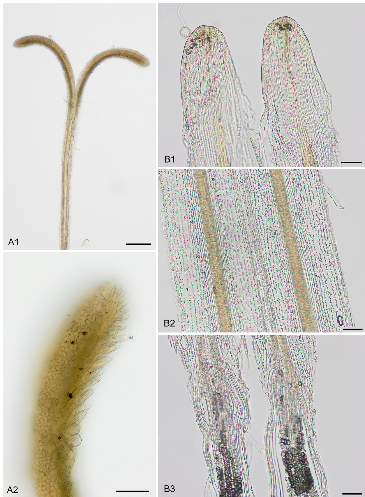
Fig. 5. Vicoa anisopappoides , floral microcharacters – A: style; A1: style branches with sweeping-hairs confined to distal portion of branches; A2: style branch showing acute sweeping-hairs; B: anthers; B1: rounded anther apex; B2: endothelial tissue with radial wall-thickenings; B3: well-developed anther tails. – Scale bars: A1 = 200 µm; A2, B1–3 = 50 µm. – A, B: from the holotype, PH & al. 6033 (S S07-16156), photographs by Lars Hedenäs.