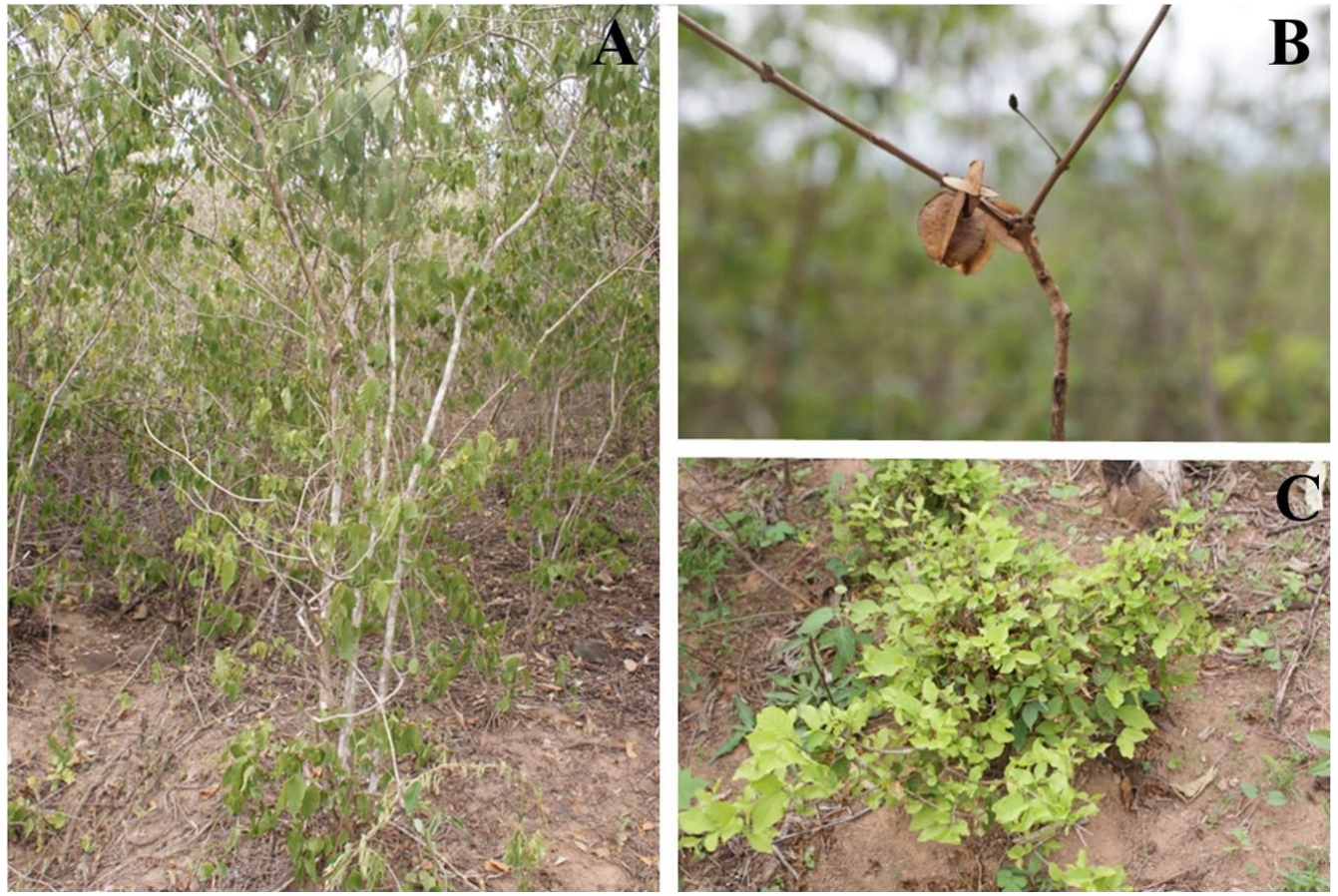
Figure 1. A. T. glaucocarpa, Adult Tree. B. Detail of mature winged fruits. C. T. glaucocarpa in bud stage (Salgado de São Félix, PB).

interstitial infiltrate of mononuclear cells (Figs. 2G and 2H). In the submucosa of rumen, reticulum, omasum abomasum and duodenum there were significant areas of congestion, edema and discrete lymphocytic infiltrate. In the large intestine, changes in submucosa were discrete and also consisted of edema.