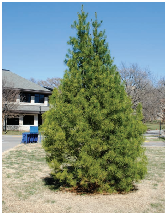
Kansas State University, Manhattan, Kansas

'Rowe Arboretum' - selected for its more uniform and compact growth.