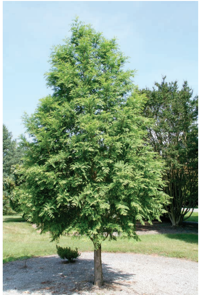
U.S. National Arboretum, Washington, D.C.

Of the few cultivars available, 'Ogon' is the only one that has generated interest in the nursery industry. It is a variegated selection that probably would not succeed in Kansas. A new selection from the Missouri Botanical Garden called 'Raven' has been selected for its superior formal growth habit.