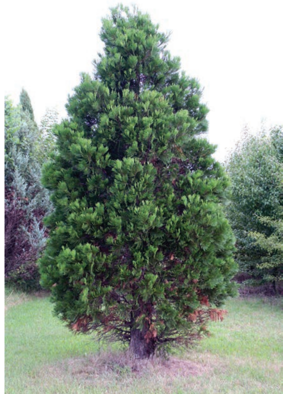
John C. Pair Horticultural Center, Haysville, Kansas

No commercially important cultivars available at this time. Some variegated and gold forms can be found in botanical gardens.