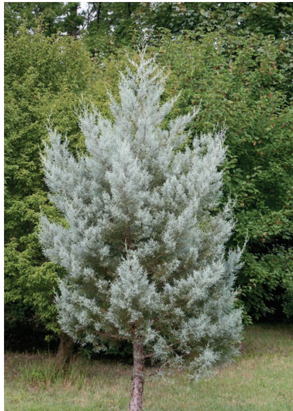
John C. Pair Horticultural Center, Haysville, Kansas

Cookes Peak – a seed strain collected from Cookes Peak, New Mexico. Nice blue foliage with improved cold hardiness. This is not a true clonal cultivar because plants originate from seed. Probably the best choice for Kansas.