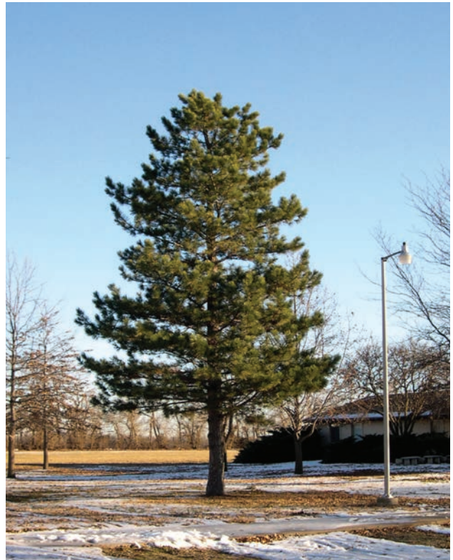
Belle Plaine, Kansas

‘Arnold Sentinel’ – an upright columnar form from the Arnold Arboretum