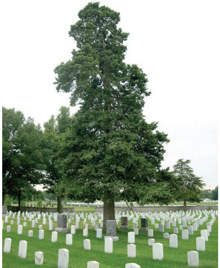
Fort Scott, Kansas

Too many cultivars to mention here. For further reading, see 'Comments' above.