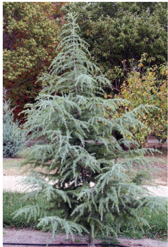
John C. Pair Horticultural Center, Haysville, Kansas

Several cultivars exist. Many valued for improved form or improved 'blue' color of the needles. Some selections are recommended for improved cold hardiness. 'Karl Fuchs' is noted for improved hardiness, which has proven true in Kansas trials thus far. A long-term field test will determine whether this cultivar is truly hardy.