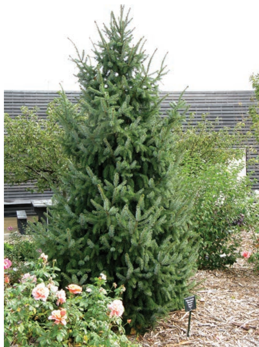
Johnson County Extension Office, Olathe, Kansas

Several dwarf ornamentals to choose from.