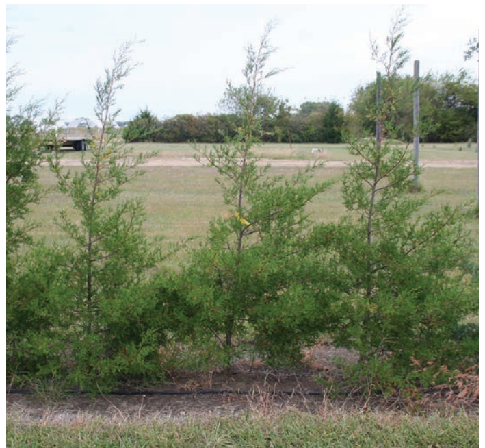
John C. Pair Horticultural Center, Haysville, Kansas

There has been increased interest in Atlantic white cedar cultivars in recent years. A selection and evaluation study is currently underway for improved growth habit of large specimens with variations of blue foliage.