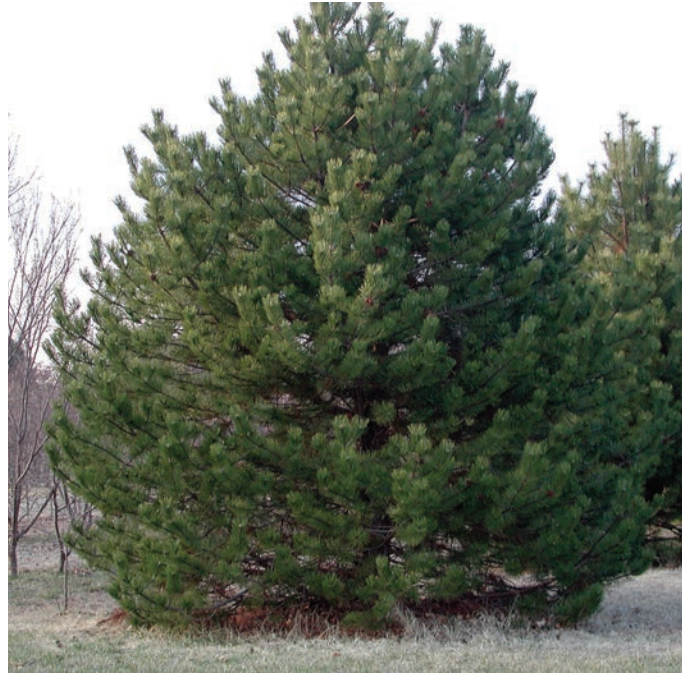
John C. Pair Horticultural Center, Haysville, Kansas

Many dwarfs, uprights, and weepers, however, none of significance for Kansas.