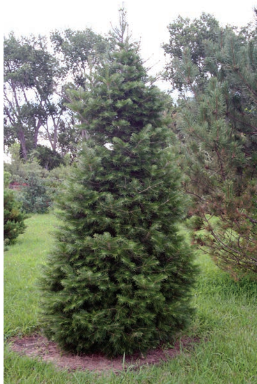
John C. Pair Horticultural Center, Haysville, Kansas

Dwarf and weeping white fir selections are popular among conifer collectors. Selections have been made for improved blue foliage color. In Kansas, most of the white fir originated from seedlings, not cultivars.