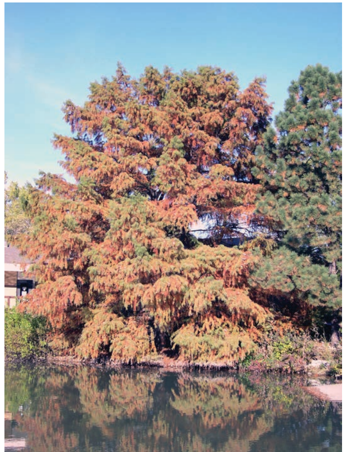
Dillon Nature Center, Hutchinson, Kansas

Pondcypress ( Taxodium distichum var. imbricarium ) – previously listed as a separate species ( T. ascendens ) this variety is similar to Baldcypress except that the deciduous branchlets have an upright, or erect, habit. Overall Pondcypress is more upright and narrow than Baldcypress.