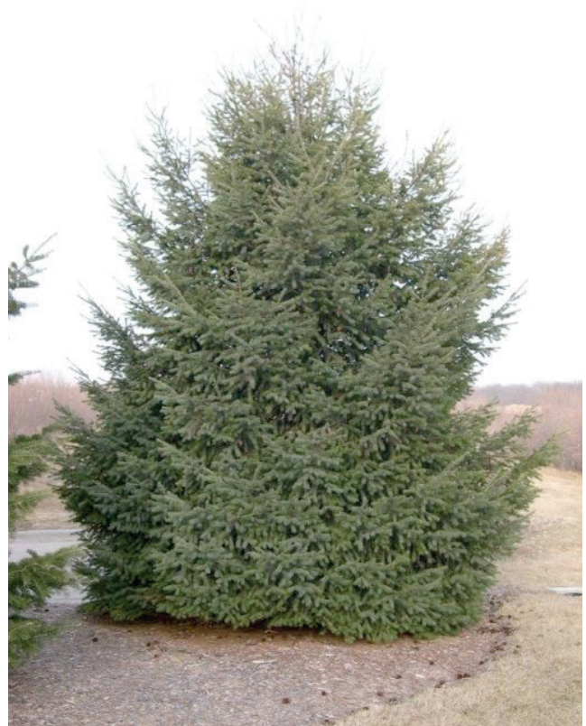
Nebraska City, Nebraska