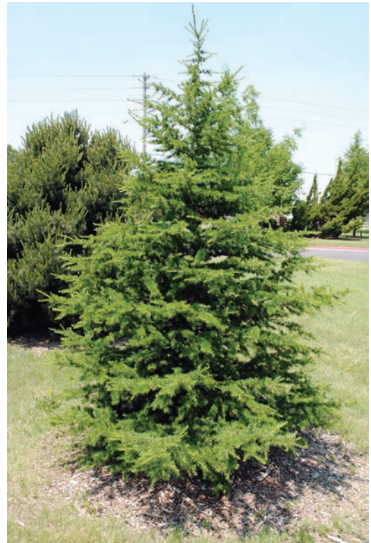
Sedgwick County Extension Education Center, Kansas

Numerous cultivar selections are available, many for improved blue color of the needles. Some variegated forms are not as vigorous as the species. Many selections for weeping, and at least one columnar ( fastigiata ) form.