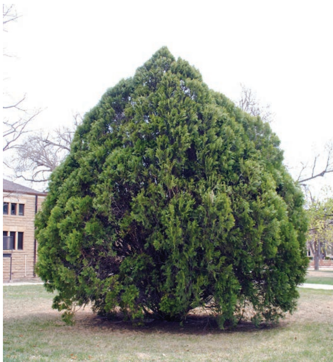
Fort Hays State University, Kansas

'Berckman's Gold' – a dense, compact form that will eventually reach a height of 10 feet. Golden to light-yellow green foliage. Some other dwarf or variegated cultivars exist, but they are not applicable for this publication.