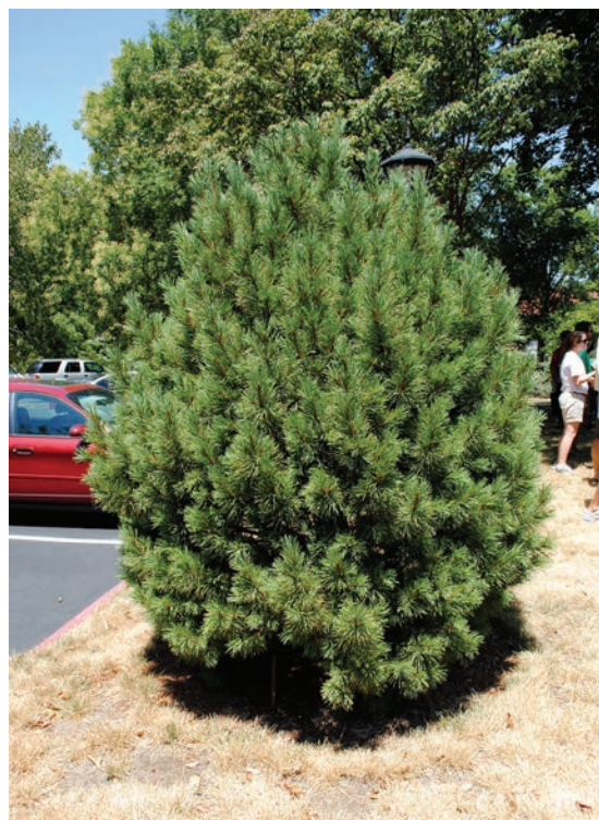
Kansas City, Kansas