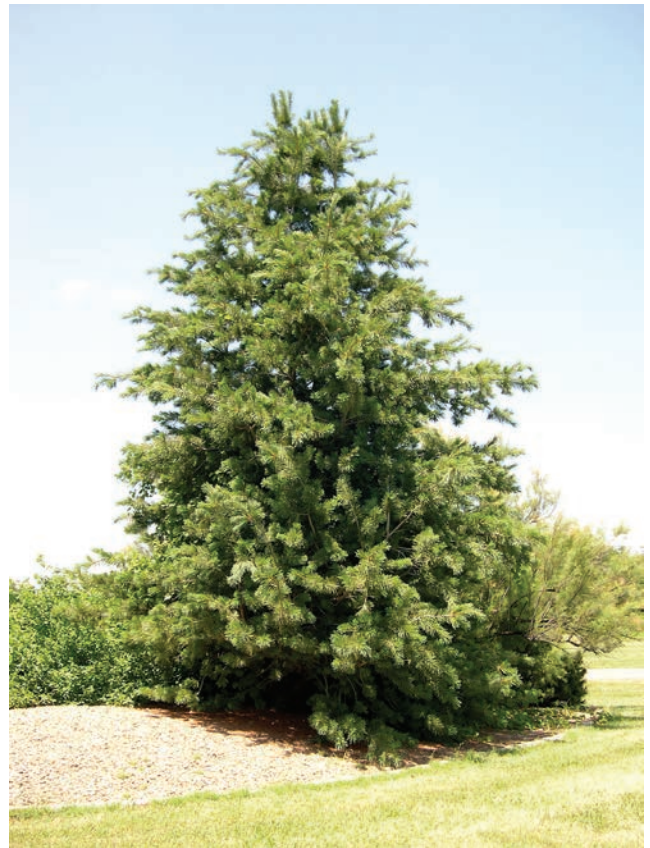
Overland Park Arboretum, Overland, Kansas