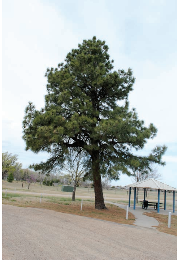
St. John, Kansas