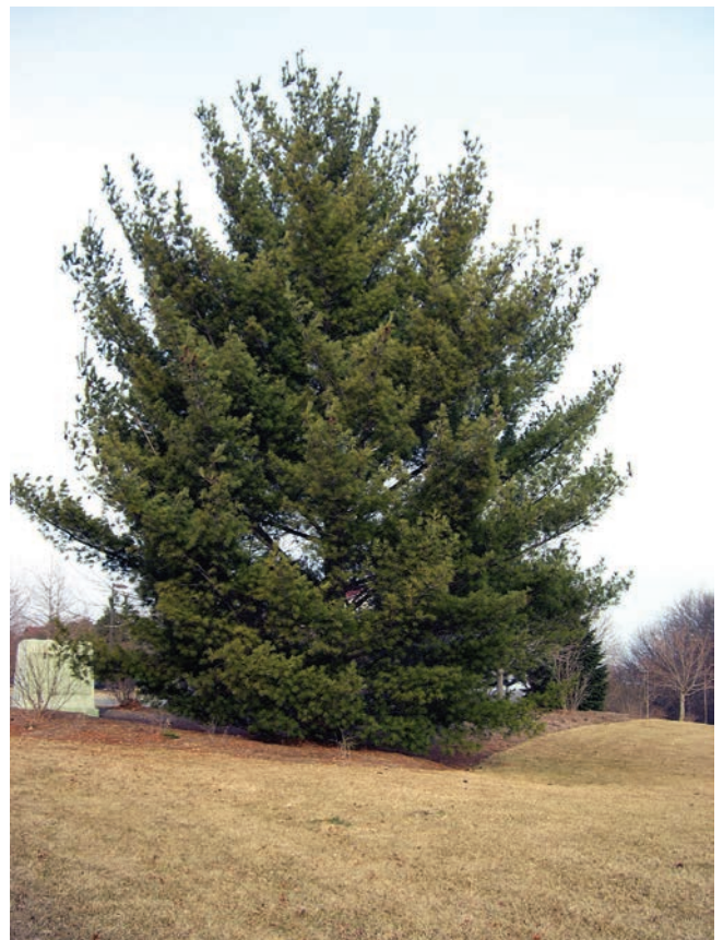
Nebraska City, Nebraska

Many dwarf, weeping, and contorted cultivars are available, but few are applicable here.