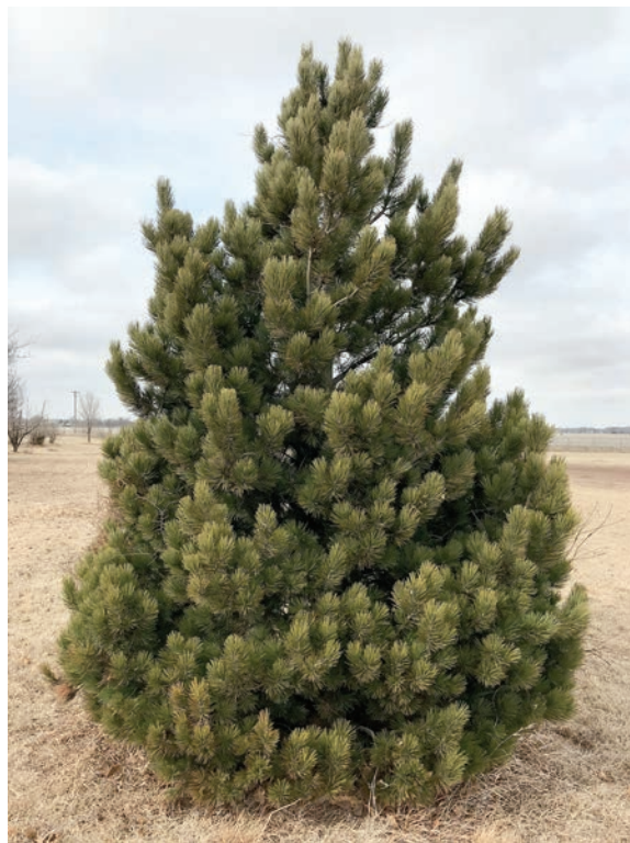
John C. Pair Horticultural Center, Haysville, Kansas