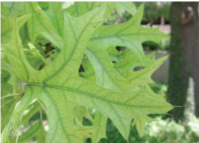
Photo 5. Iron chlorosis causes yellowing between the veins. Common in high pH soils.