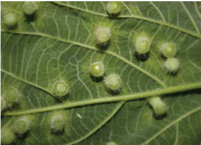
Photo 87. Hackberry nipple gall maker.