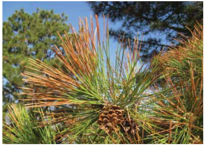
Photo 2. Partial needle scorch symptoms due to environmental stress.