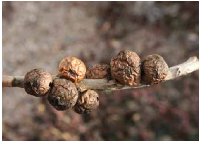
Photo 86. Oak bullet gall.