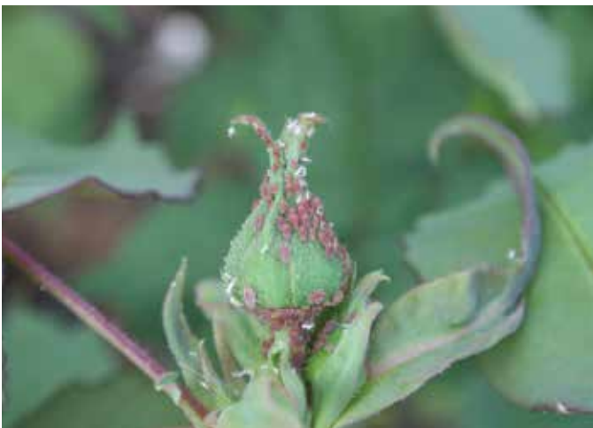
Photo 113. Rose aphids .