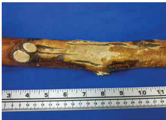
Photo 34. Thyronectria canker on honeylocust, with cracked, sunken bark.