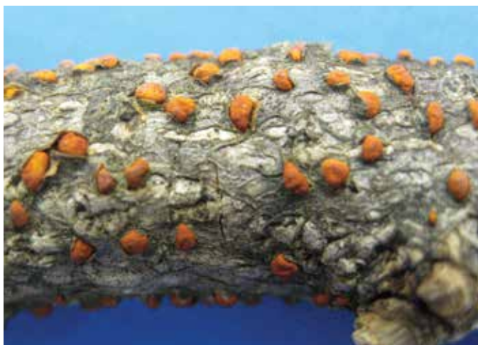
Photo 35. Endothia canker on oak exhibiting reddish-orange fungal fruiting structures.