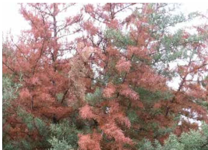
Photo 120. Seiridium canker causes die back on Arizona cypress.