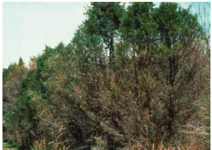
Photo 102. Cercospora needle blight can cause needle drop in lower part of tree. Primarily in Rocky Mountain Juniper.