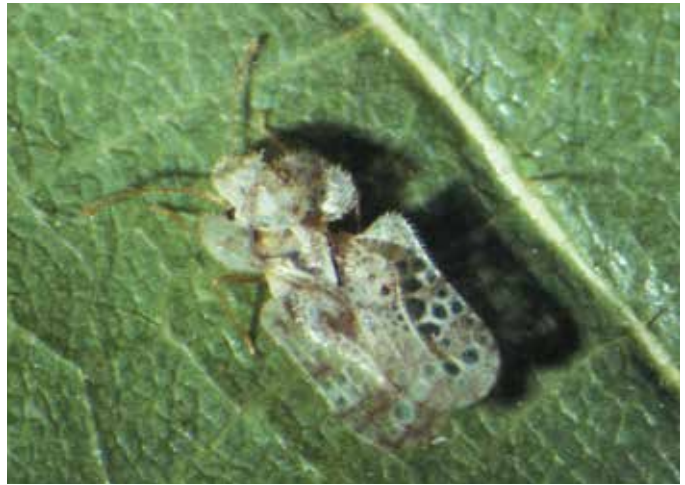
Photo 64. Lace bug adult.