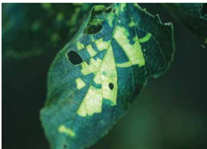
Photo 119. Hackberry island chlorosis causes yellow-green blocky lesions.