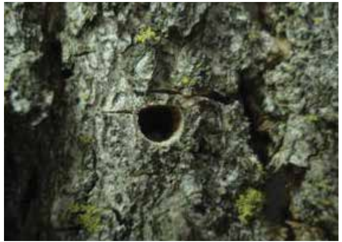
Photo 80. Emerald ash borer adult emergence hole.