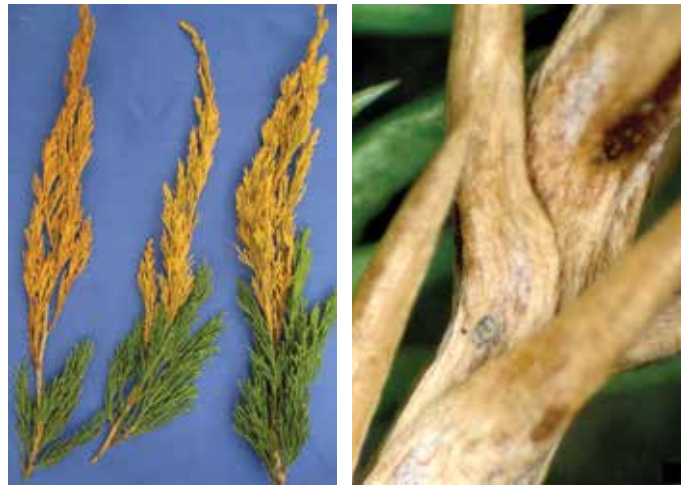
Photos 100a and 100b. Phomopsis tip blight on juniper causing browning and dieback (a). Close-up of Phomopsis to show fungal fruiting structures (b).