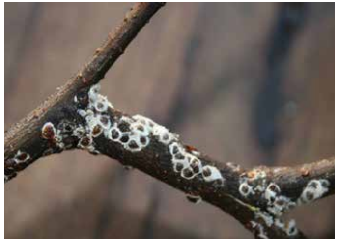
Photo 70. European elm scale.