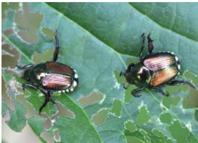
Photo 48. Japanese beetle adults.