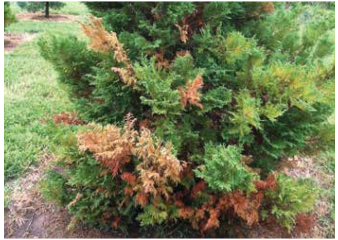
Photo 98. Botryosphaeria canker causes branch dieback in Rocky Mountain Juniper.