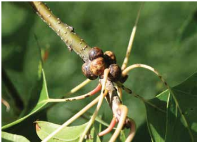
Photo 69. Oak kermes scale.