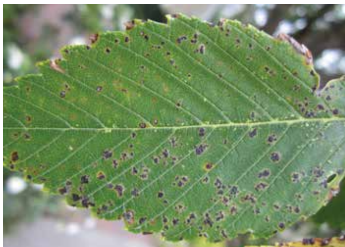
Photo 93. Black spot on elm (also called elm anthracnose) causes irregular, blotchy lesions on the upper leaf surface.