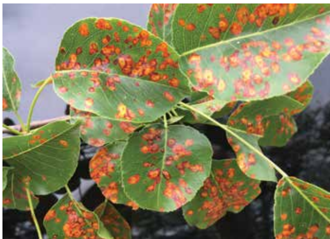
Photo 20. Rust on pear foliage . Leaves develop yellow-orange spots.