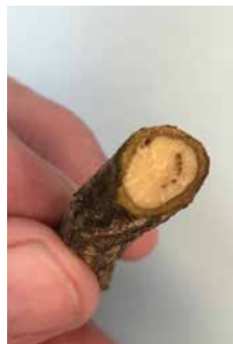
Photos 106a and 106b. Oak wilt causes dark streaking in the vascular tissue visible in longitudinal views (a) and cross sections (b).