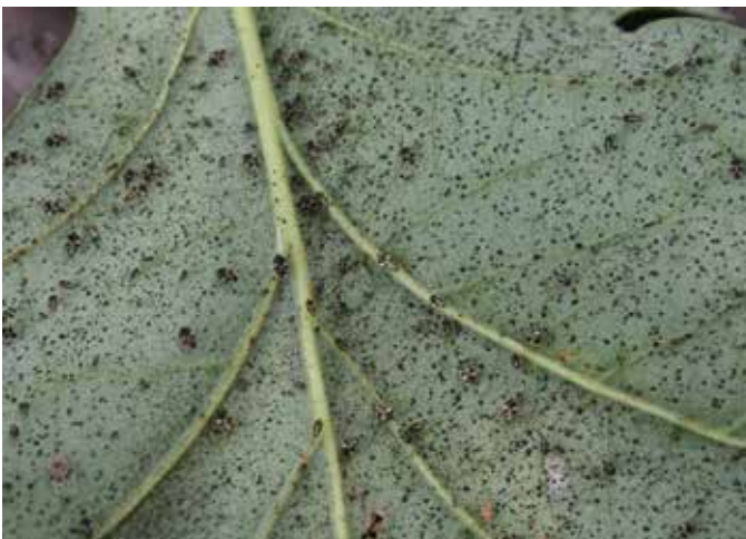
Photo 65. Lace bug nymphs.