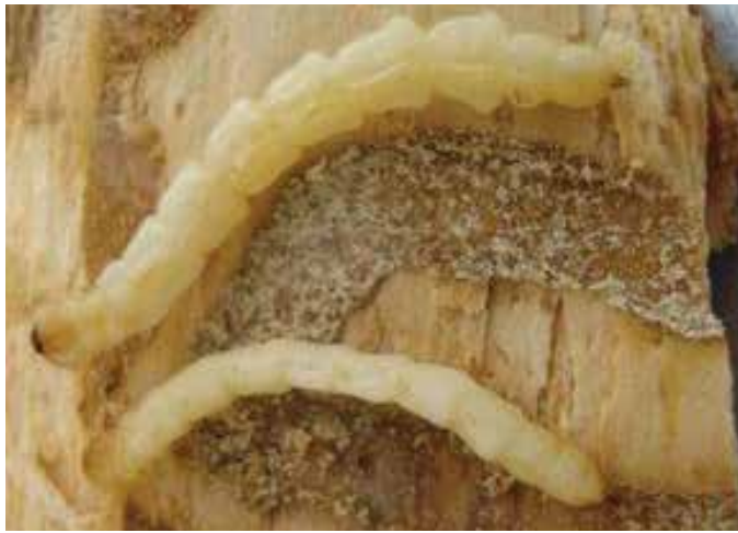
Photo 81. Emerald ash borer larvae.