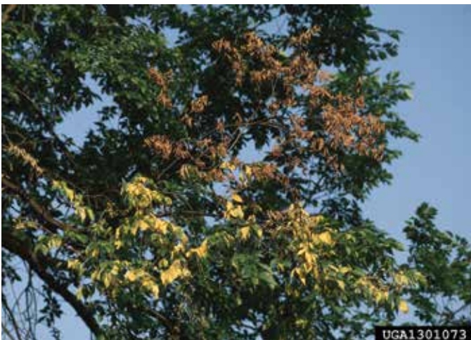
Photo 29. Dutch elm disease causes branch wilt and dieback, called "flagging."