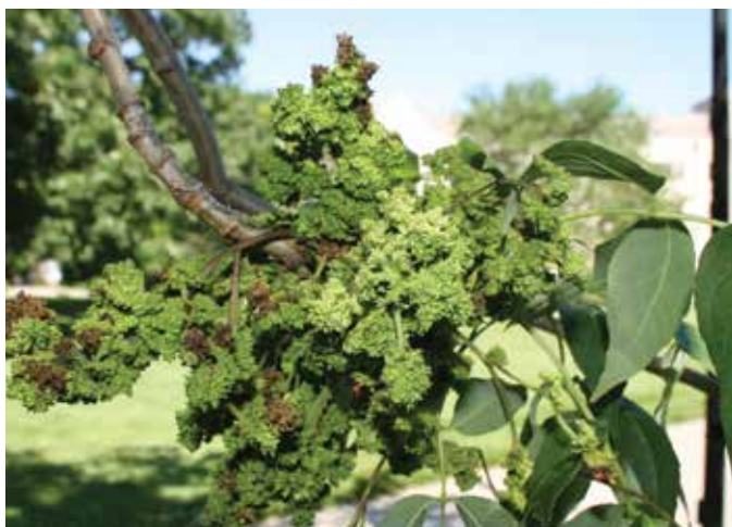
Photo 117. Ash flower gall.