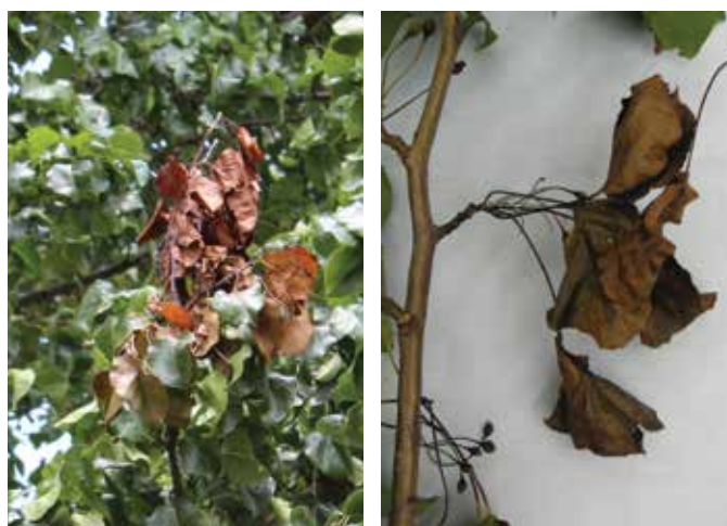
Photos 92a and 92b. Fire blight infected shoots (a) and branch spurs eventually turn brown or black (b). Can be confused with summer scorch.