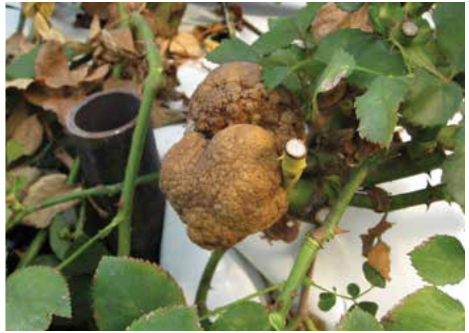
Photo 38. Crown gall affects many plant species. Woody galls develop on the roots and crown and darken over time.