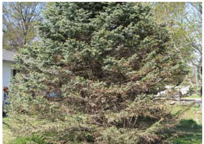
Photo 114. Rhizosphaera needle cast causes shedding of lower, interior needles. See also 15b.