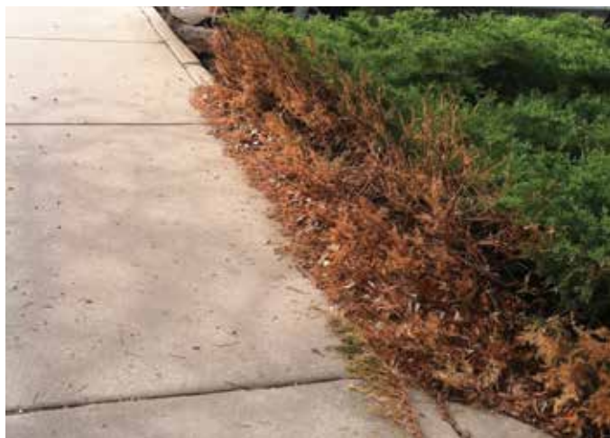
Photo 7. Damage from de-icing salts.