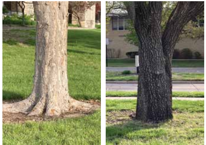
Photos 4a and 4b. Normal healthy root flare (a). Lack of root flare can indicate problems such as planting too deep or soil fill (b).