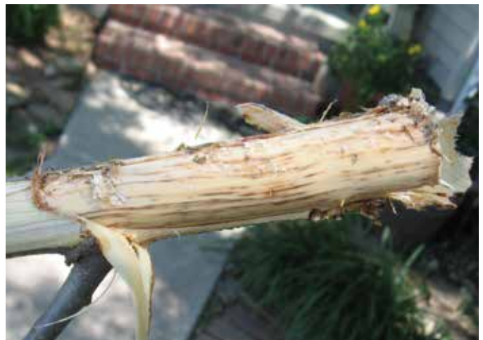
Photo 30. Brown streaking in vascular tissue caused by Dutch elm disease. This symptom can be seen by carefully removing the bark from recently wilted branches.