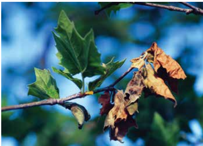
Photo 17. Twig blighting caused by sycamore anthracnose.