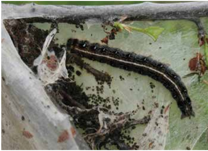
Photo 55. Full-grown eastern tent caterpillar.