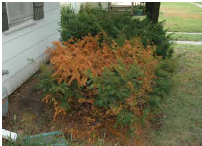
Photo 116. Wet soil causes decline and dieback in yew.