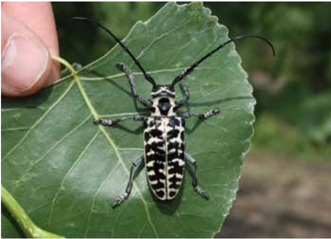
Photo 75. Cottonwood borer adult.