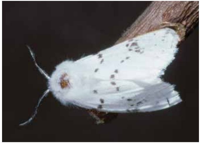
Photo 58. Fall webworm adult.