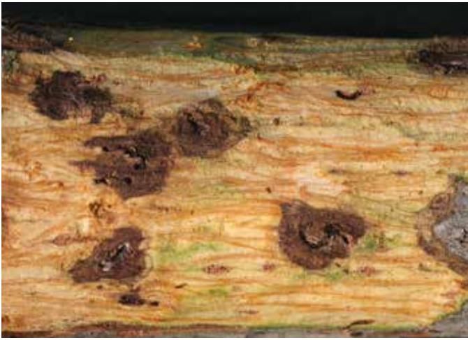
Photo 37. Cankers caused discolored tissue under the bark. This example is thousand cankers of walnut. (As of printing, thousand cankers of walnut is not present in Kansas.)