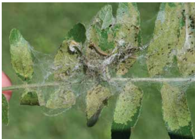
Photo 95. Mimosa webworm.