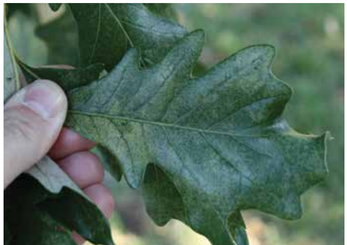
Photo 66. Lace bug feeding damage on oak leaf.