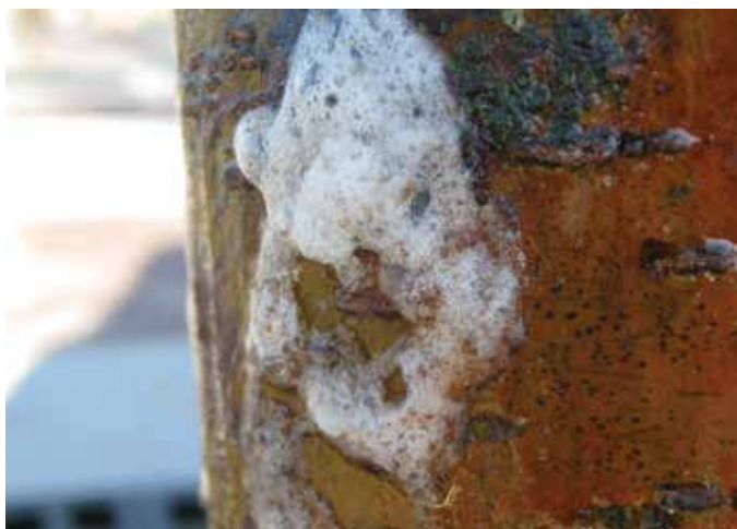
Photo 43. Alcoholic slime flux occurs on elm, willow, and other trees.