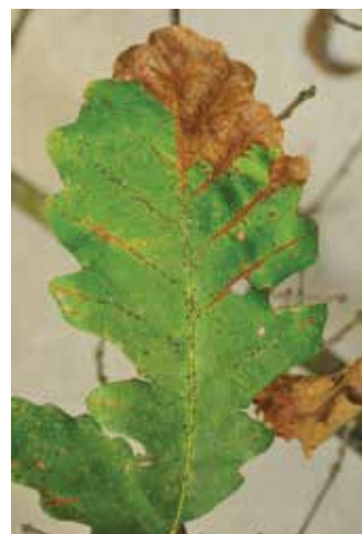
Photos 104a and 104b. Leaf spot of oak caused by Tubakia (a) and Bur oak blight (b).