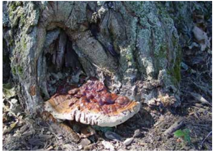
Photo 40. Mushrooms and conks indicate decay. Shown here: Ganoderma root and butt rot of bur oak. Also see Photo 88.