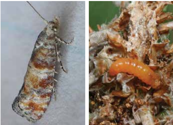
Photos 111a and 111b. Nantucket pine tip moth adult (a) and larva (b).