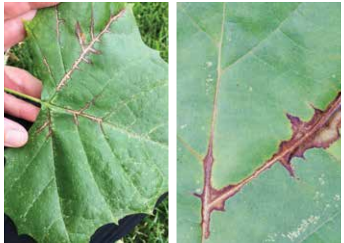
Photo 16a and 16b. Anthracnose diseases can cause irregular foliar spotting, especially along the veins, as shown here for sycamore anthracnose (16b closeup). Anthracnose disease also can lead to premature leaf shedding. Also see photos 107 and 108.