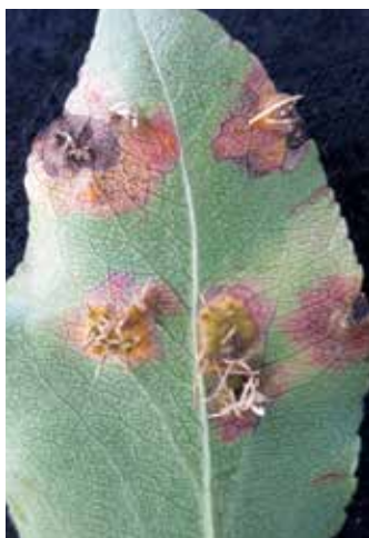
Photos 23a and 23b. Gymnosporangium rusts cause yellow-orange leaf spots on the upper leaf surface (a) and tube-like fungal structures on lower leaf surfaces (b).