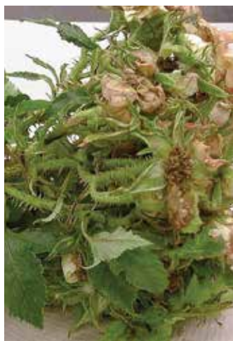
Photos 45a and 45b. Rose rosette causes witches' broom and purple discoloration (a) and excessive thorns (b).