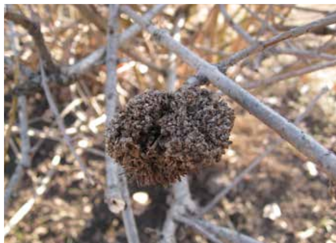
Photo 94. Brown, woody Phomopsis gall on forsythia.