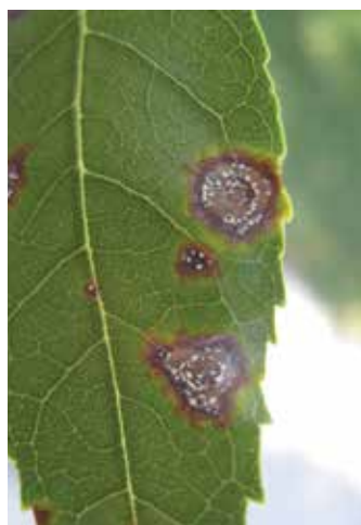
Photos 11a and 11b. Ash leaf spot is a fungal disease that causes brown spots (a) which often develop a yellow halo (b).