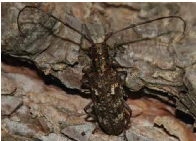
Photo 77. Pine sawyer beetle adult.