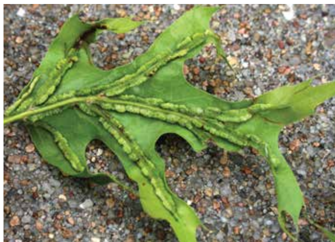
Photo 118. Oak vein pocket gall.