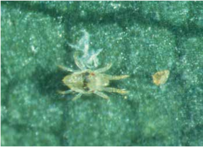
Photo 73. Twospotted spider mite adult.