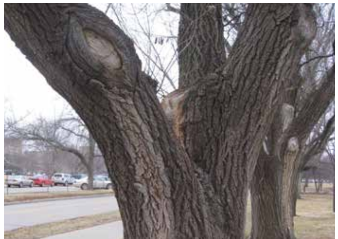
Photo 42. Bacterial wetwood causes discolored streaking on wood.