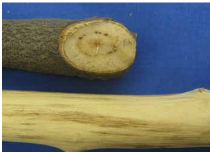
Photo 32. Brown streaking in vascular tissue caused by Verticillium wilt. This symptom can be seen in cross sections (top) or by carefully removing the bark from recently wilted branches (bottom).