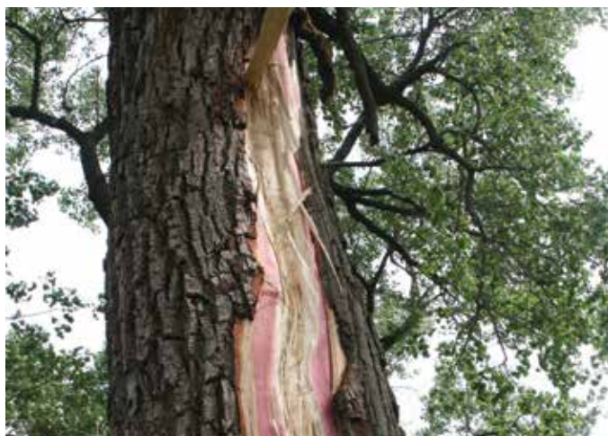
Photo 9. Lightning damage. Lightning can split or shatter bark, causing major structural damage, which may kill the tree over time.