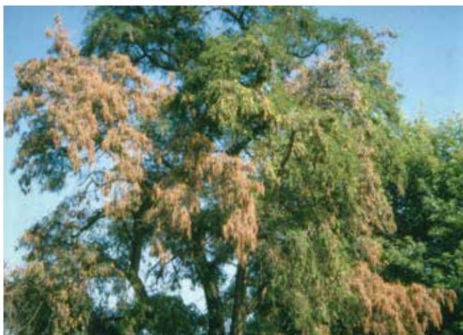
Photo 31. Verticillium wilt causes branch wilt and dieback, called “flagging”.