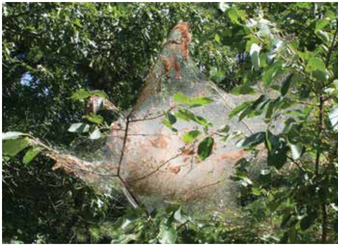
Photo 57. Fall webworm nest.