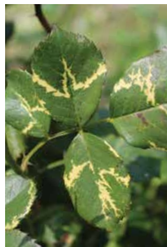
Photos 44a and 44b. Rose mosaic virus causes mottling, mosaic, ringspots, and other symptoms.