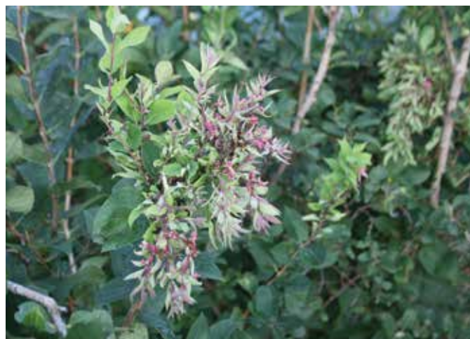
Photo 96. Honeysuckle witches-broom aphid damage.