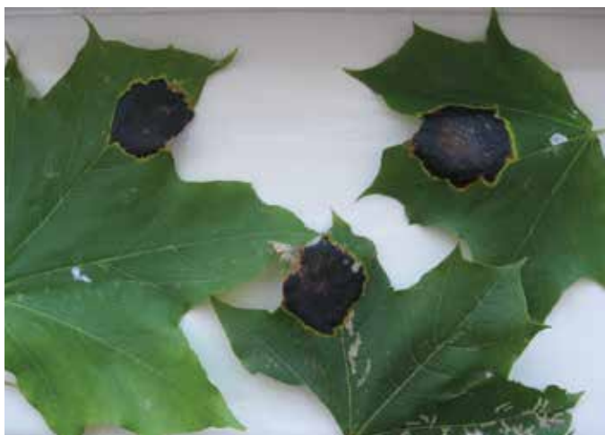
Photo 103. Tar spot of maple.