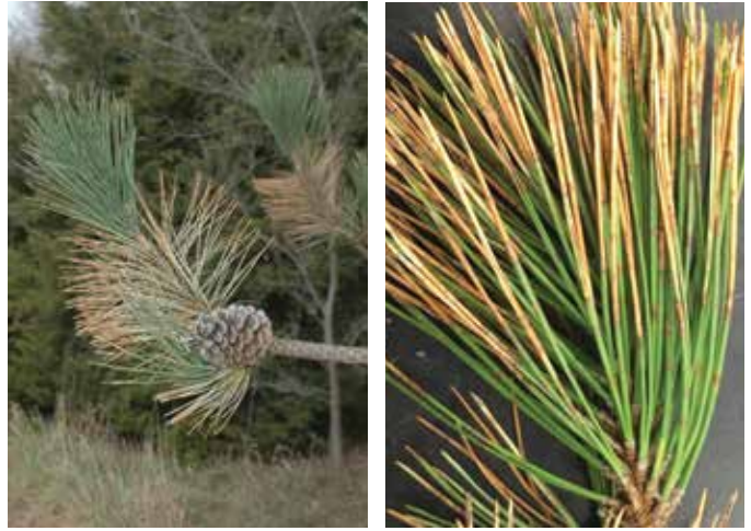
Photos 110a and 110b. Dothistroma needle blight causes shedding of internal needles (a). Needle spotting and browning caused by Dothistroma (b). See also photo 15a for needle close-up.