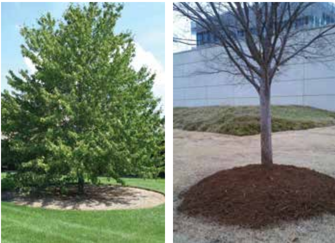
Photos 3a and 3b. Mulching can benefit trees (a) but mulch should not be piled deeply or directly against trunk (b).