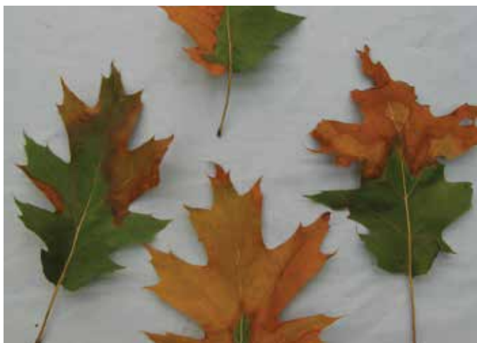
Photo 105. Partial leaf scorch caused by oak wilt. Can be confused with environmental scorch.