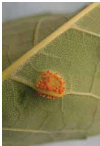
Photos 19a and 19b. Ash rust , upper (a) and lower (b) leaf surface.