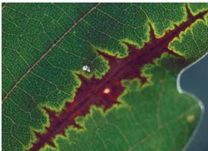
Photo 108. Oak anthracnose causes browning along the veins.