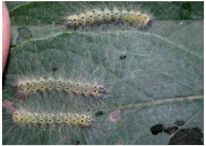
Photo 56. Fall webworm larvae.