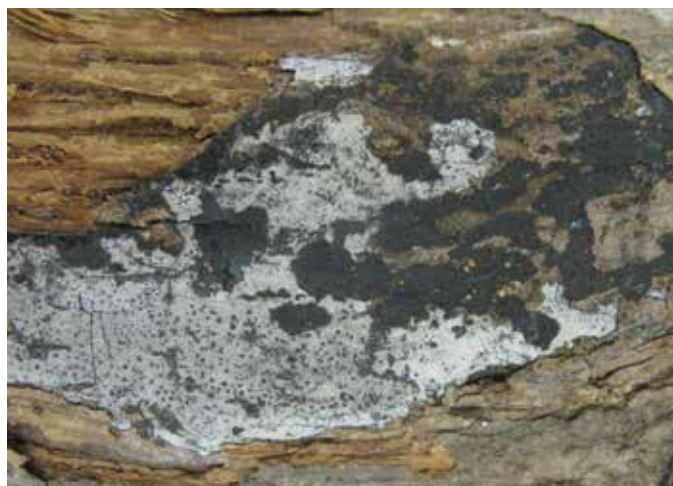
Photo 36. Biscogniauxia canker ( Hypoxylon canker). The fungus forms a silvery-gray layer, later turning black. This photo illustrates both stages.