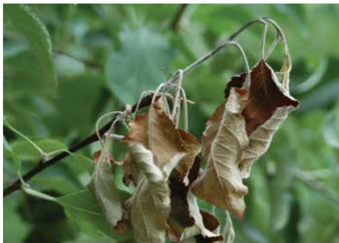
Photo 91. Fire blight may cause shoot tips to curl, causing a “shepherd’s crook” symptom in wet spring weather. Can be confused with summer scorch.