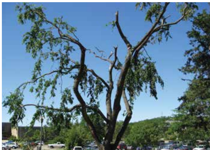
Photo 8. Storm damage. Trees should be pruned properly after storm damage to reduce the risk of wood decay.