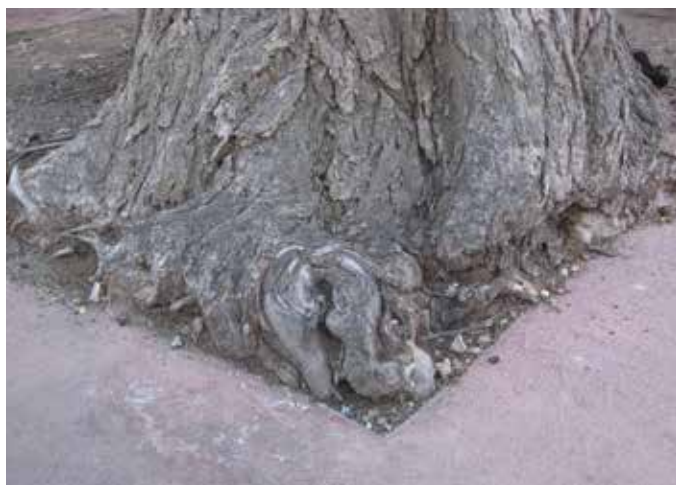
Photo 10. Excavation can damage roots and lead to tree decline and death.