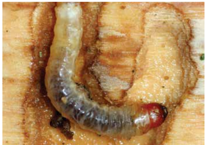
Photo 84. Ash/lilac borer larva.