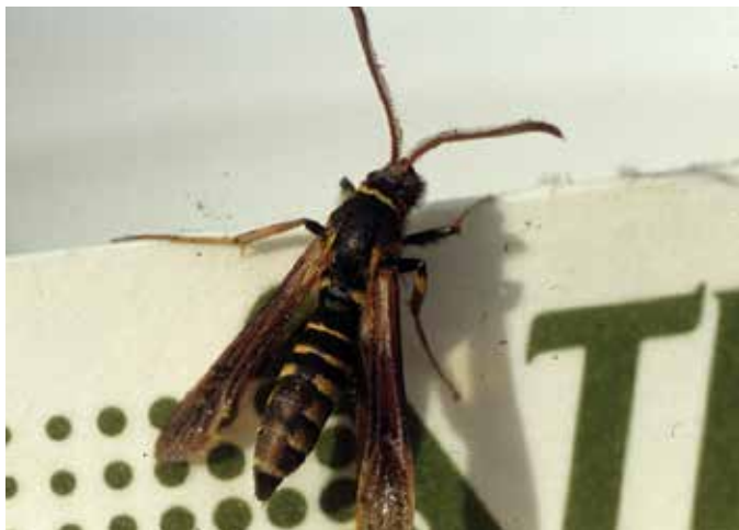
Photo 83. Ash/lilac borer adult.