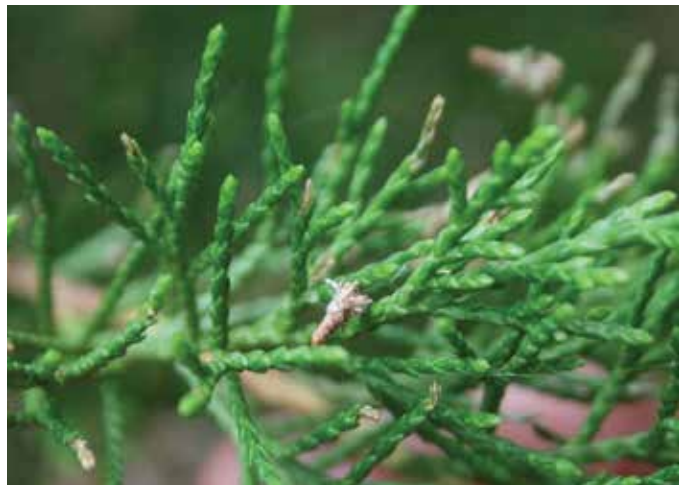
Photo 52. Young bagworm caterpillar case.