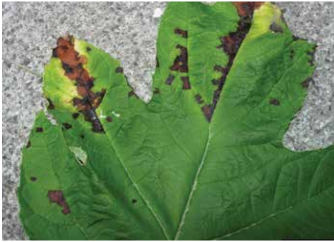
Photo 97. Bacterial leaf spot of hydrangea. Spots are brown with a blocky, angular shape.