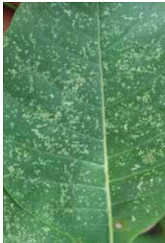
Photos 63a and 63b. Adult leafhopper (a). Leafhopper feeding damage (b).