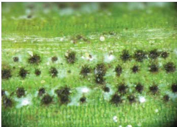
Photo 115. Fruiting structures of Stigmina needle cast on spruce (compare to 15b).