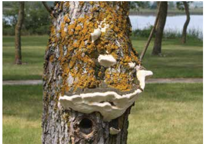
Photo 88. Mushrooms and conks are indicators of decay. Shown here: ash heart rot caused by Perenniporia fraxinophila .