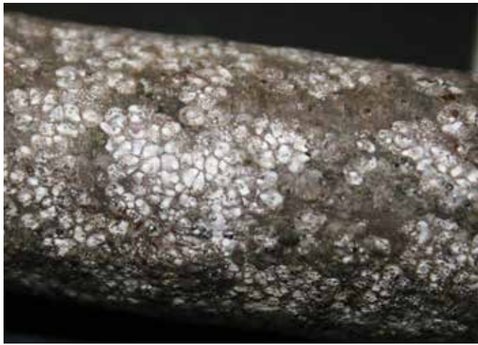
Photo 67. Obscure scale.