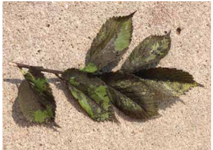
Photo 28. Sooty mold develops as black, powdery growth on leaf surfaces. Shown here on elm.