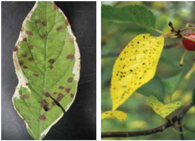
Photos 13a and 13b. Septoria leaf spot on dogwood (a). Cherry leaf spot (b).