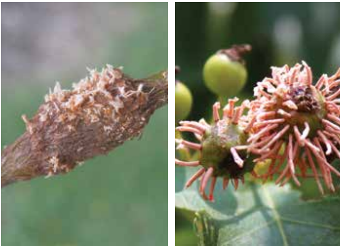
Photos 27a and 27b. Quince rust causes swelling and forms pink spore-bearing tubes on crabapple twig (a). Quince rust forms small pink tubes on hawthorn fruit (b).