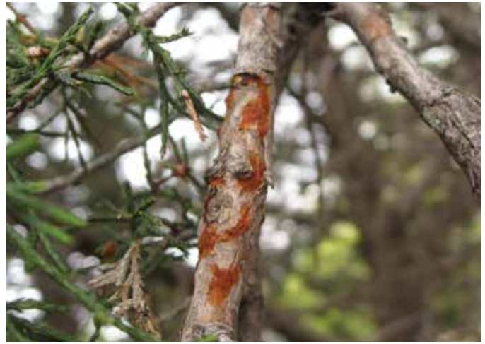
Photo 26. Quince rust on juniper twigs forms an orange crust when dry.