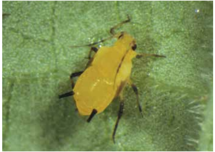
Photo 62. Aphids are soft-bodied and pear shaped with two tubes called cornicles protruding from the back of the abdomen.