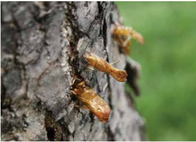
Photo 85. Ash/lilac borer pupae.