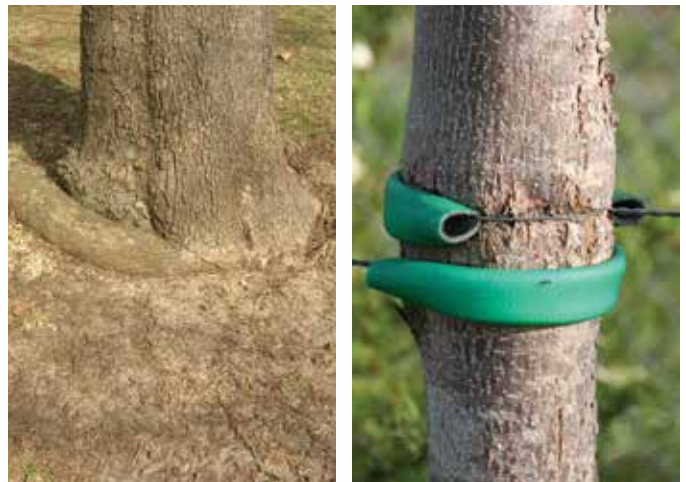
Photos 6a and 6b. Girdling root (a) and girdling damage from wires (b).