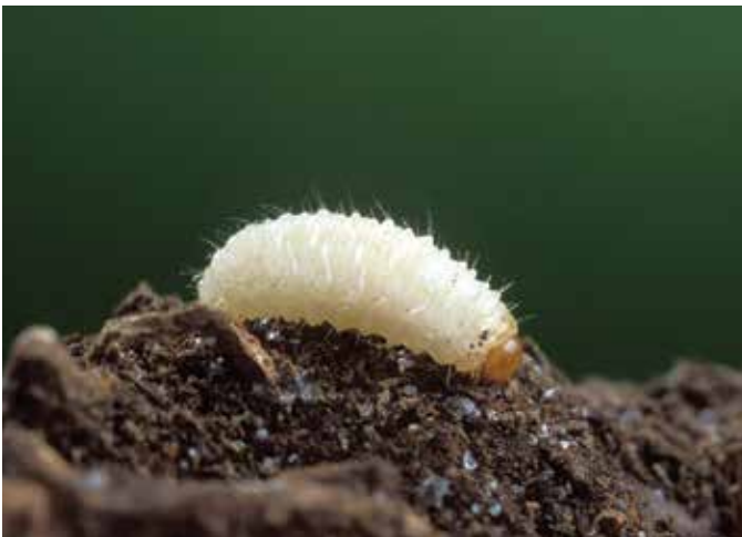
Photo 51. Black vine weevil larva.