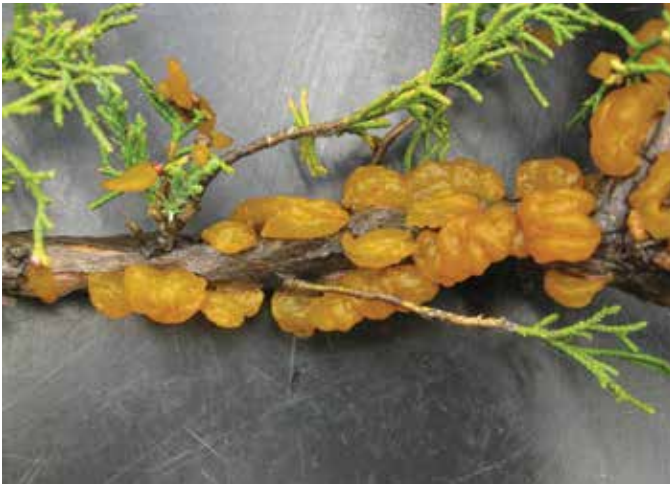
Photo 25. Quince rust on juniper twigs forms swollen orange cushions when wet.