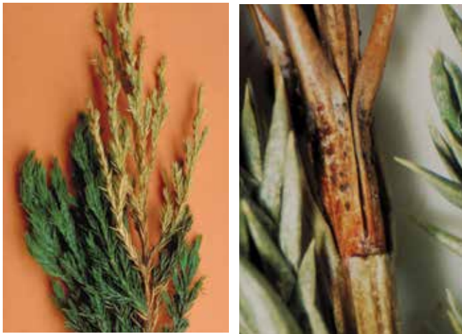
Photos 99a and 99b. Kabatina tip blight on juniper (a) and closeup showing fungal fruiting structures (b).