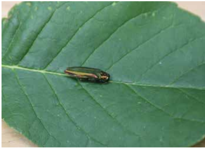
Photo 79. Emerald ash borer adult.