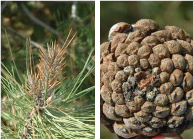
Photos 109a and 109b. Pine tip blight stunts needles and shoots (a). Pine tip blight fungal fruiting structures on cones (b).