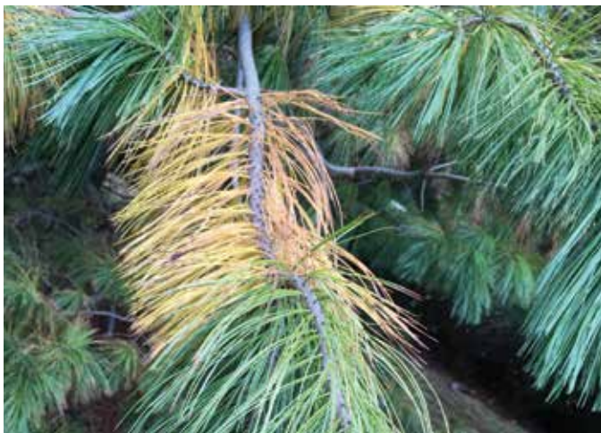
Photo 101. Natural needle drop in pine.