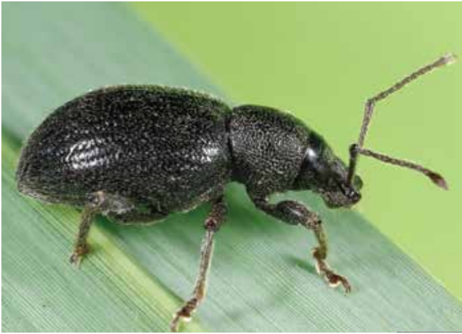
Photo 49. Black vine weevil adult.