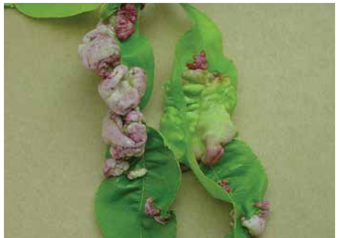
Photo 90. Peach leaf curl causes distortions and discoloration.