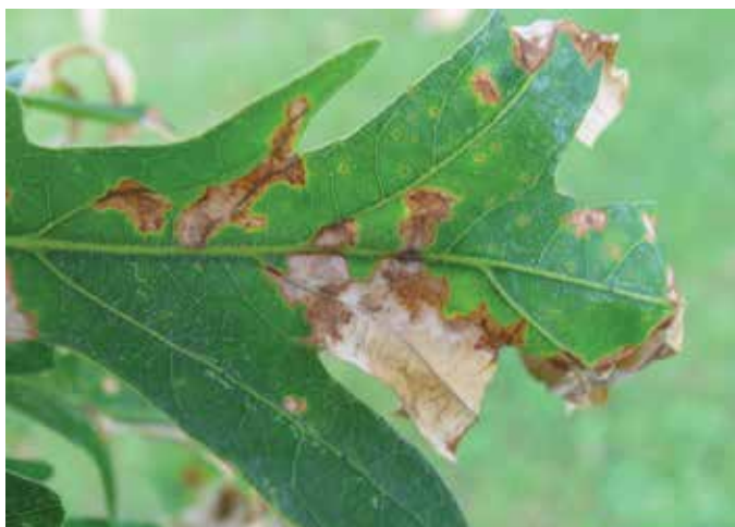
Photo 107. Oak anthracnose.