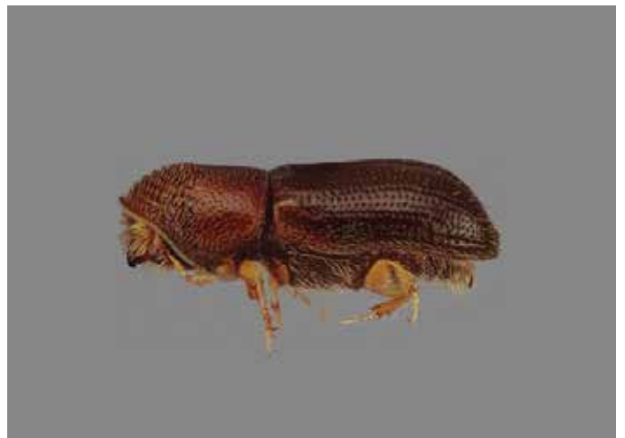
Photo 78. Walnut twig beetle adult (actual size \frac{1}{16} inch).