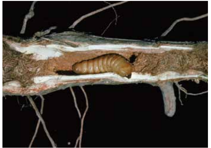
Photo 76. Cottonwood borer larva.