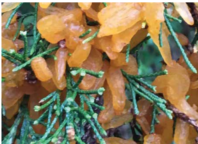
Photo 24. Hawthorn rust on juniper.