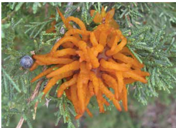
Photo 22. Cedar apple rust galls on juniper.