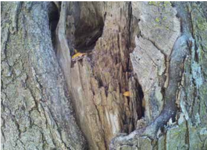
Photo 39. Crumbling wood indicates decay.