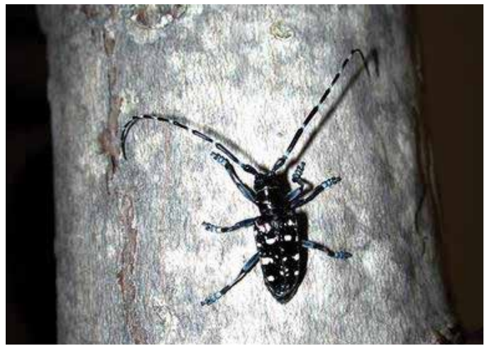
Photo 82. Asian longhorned beetle adult.