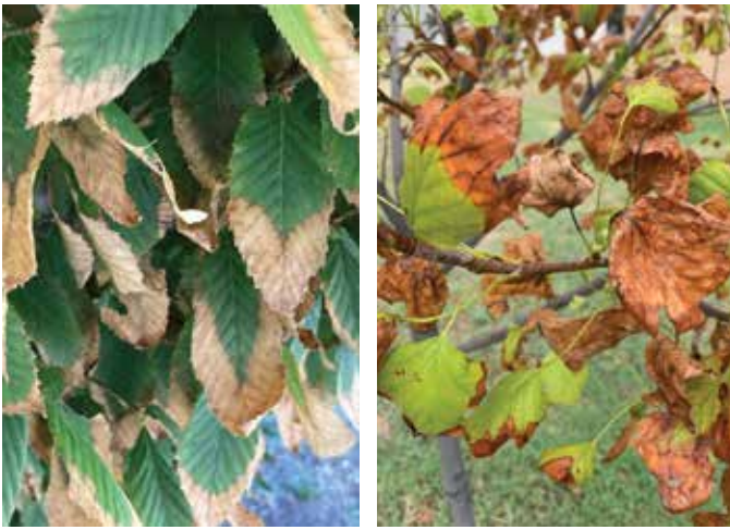
Photos 1a and 1b. Marginal/tip (a) and full (b) leaf scorch due to drought stress and/ or heat scorch.