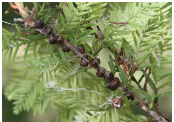
Photo 72. Lecanium scales on bald cypress.