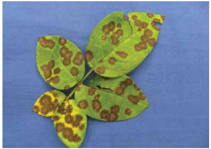
Photo 14. Black spot on rose.