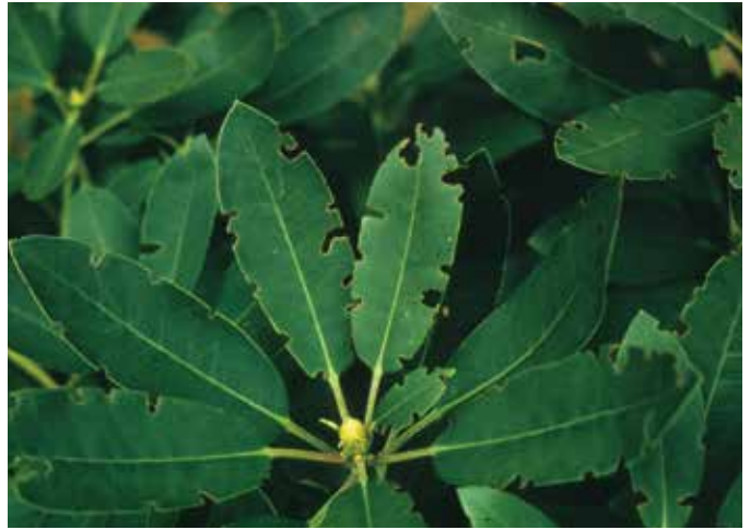
Photo 50. Black vine weevil damage.