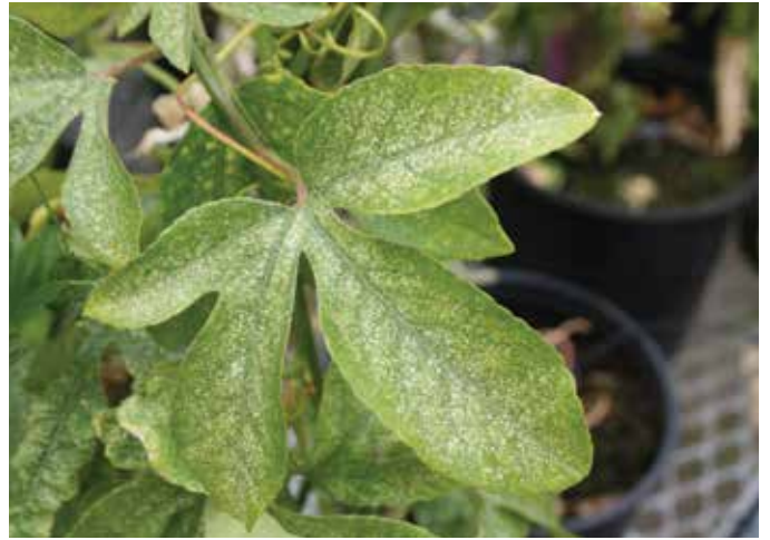
Photo 74. Twospotted spider mite feeding damage.