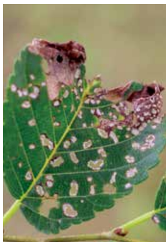
Photos 47a and 47b. Adult European elm flea weevil (a) and damage (b).