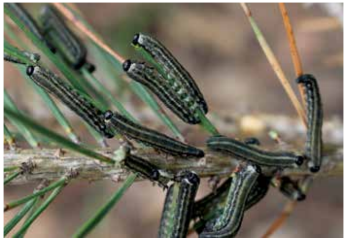
Photo 60. European pine sawfly larvae.