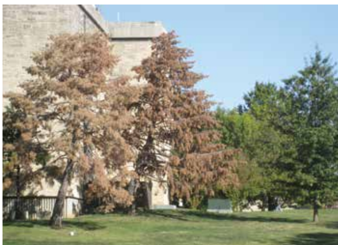
Photo 33. Pine wilt rapidly kills trees. Tree death usually occurs in fall.