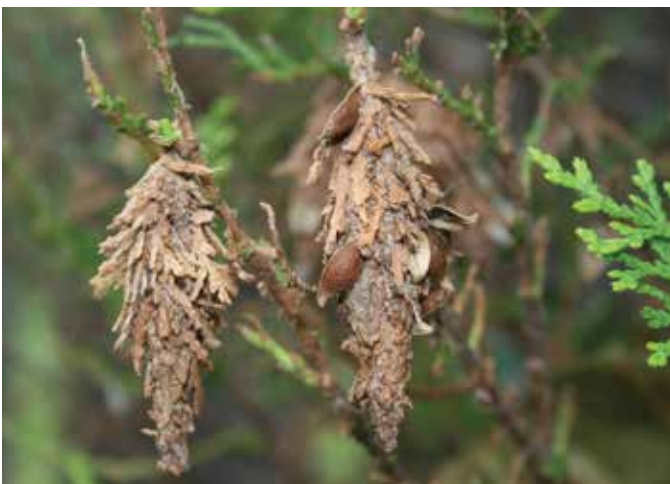
Photo 53. Older or mature bagworm caterpillar.