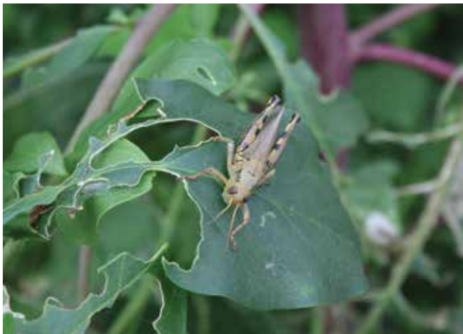
Photo 59. Grasshopper and feeding damage.