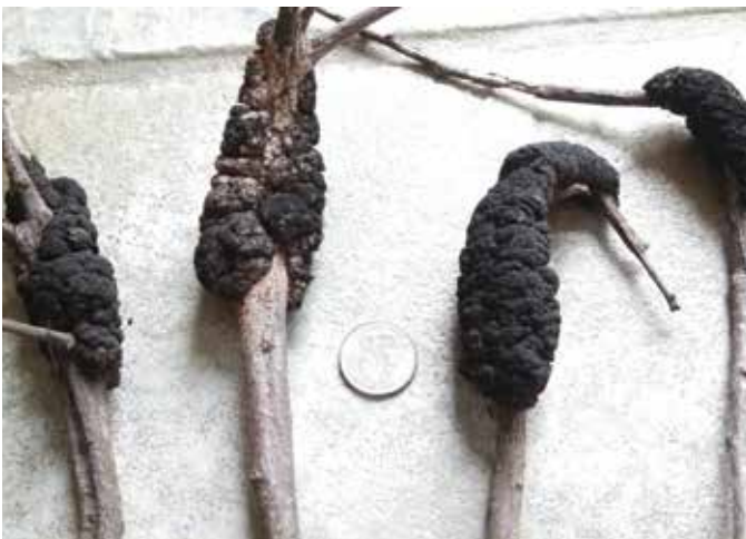
Photo 89. Black knot of cherry, plum, and other stone fruit causes black swellings on branches.