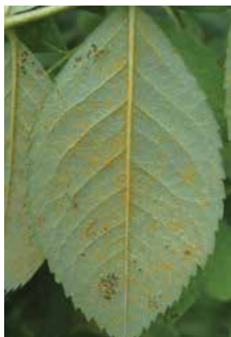
Photos 21a and 21b. Rose rust on upper (a) and lower (b) leaf surface.