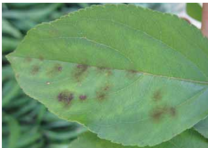
Photo 12. Apple scab is a fungal disease that causes olive-green to brown leaf spots on the upper and undersides of the leaf. Fruit can also be spotted.