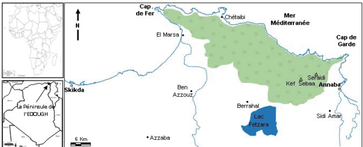
Fig. 1. Map of the location of the study area. The Edough massif is in green (OSM, 2022)

The analysis of lichen samples from the Edough Peninsula on the rhytidome of Quercus suber , revealed the presence of 45 lichen taxa (Table 1). Nineteen taxa were newly discovered in the study area. However, they have neither been mentioned by Ali Ahmed et al. (2018) in their work on the lichen diversity of the Edough Peninsula nor by Fekroune-Chaker (2016) in their report on species to be protected in the