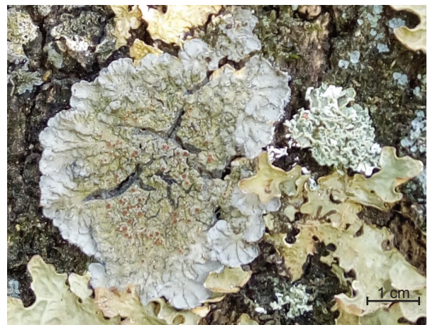
Fig. 2. Dry thallus of Pectenia plumbea in rosette. Photo by A. Chaker, April 2021. Scale: 0.7 cm

No significant chemical colour reactions were observed. The photosymbiont is a cyanobacterium: Nostoc , so the thallus takes on a dark grey-blue col-