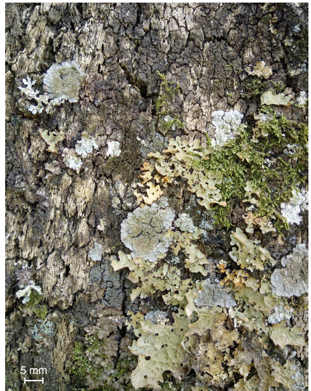
Fig. 4. Pectenium plumbeum and Fuscopannaria leucosticta with some accompanying species (like Lobaria pulmonaria ) on Quercus suber . Photo by A. Chaker, April 2021. Scale: 0.7 cm

Fuscopannaria leucosticta is the second species of the family Pannariaceae studied in this research. It was found on the rough bark of cork oak (Fig. 5, A and B). This lichen is known to be very aerohydrophilic, as has been reported by Roux et al. (2017). Its thallus consists of many small overlap-