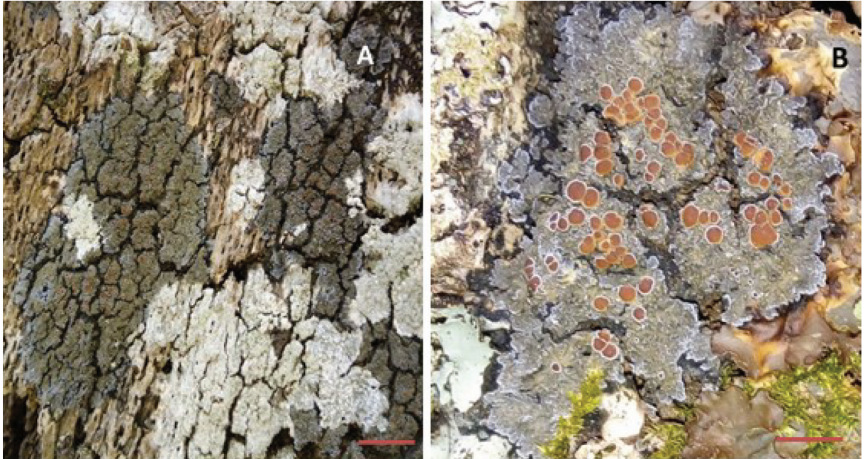
Fig. 5. Several thalli of Fuscopannaria leucosticta with Lepra albescens (A) and thallus (B) details. Photos by A. Chaker, April 2021. Scales: A = 1 cm, B = 2 mm