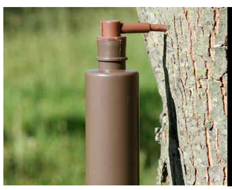
BRANDT enTREE injection device for nutrient applications.

Ask your sales representative about other BRANDT enTREE formulations available.