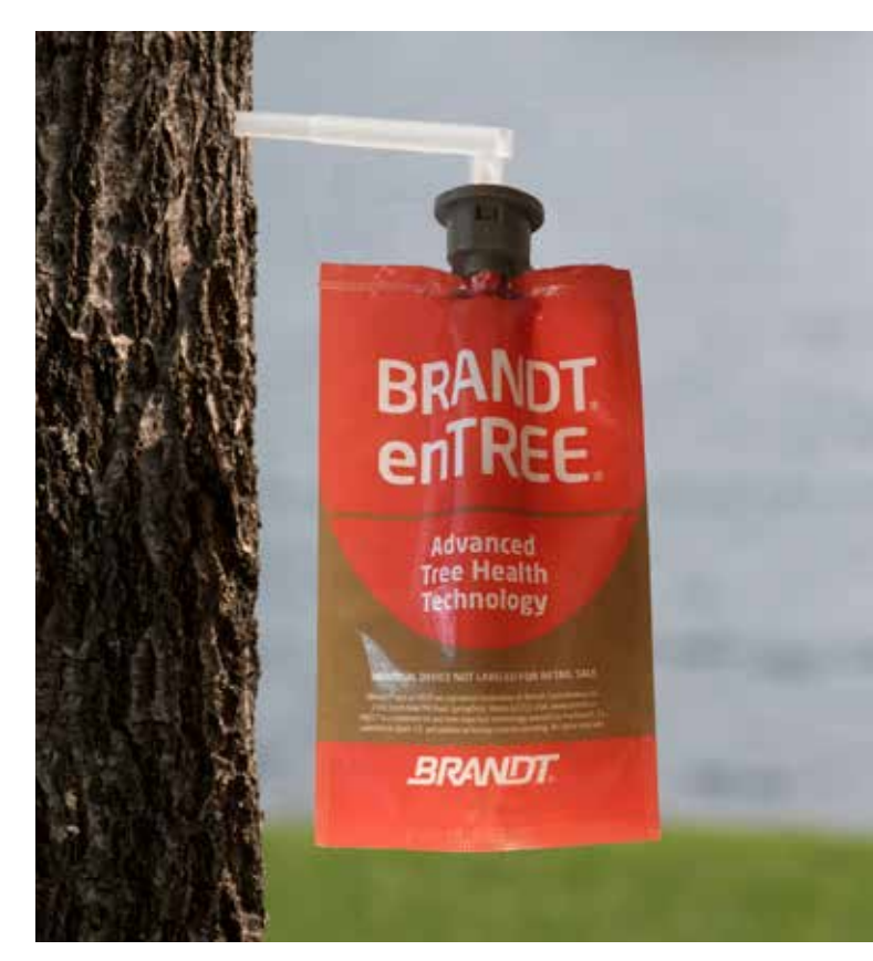
BRANDT enTREE injection device for pesticide applications.

Pre-filled micro tree injection device containing potassium phosphite. Recommended as a supplemental fertilizer treatment to help prevent and correct nutrient deficiencies in fruit, tree and vine crops. Recommended for use as part of a balanced fertility program.