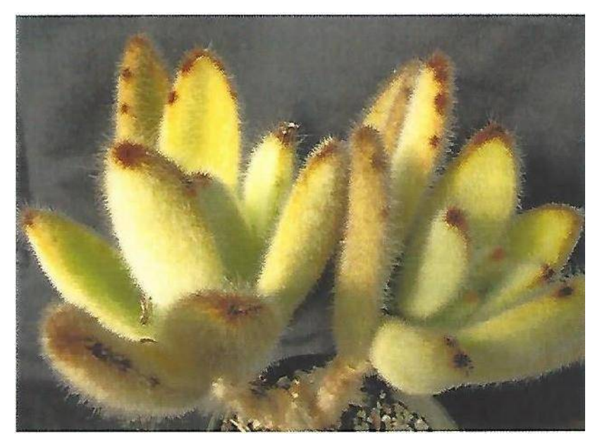
Kalanchoe tomentosa cv. Chocolate Soldier

Kalanchoe are widely grown as ornamental house plants or in rock or succulent gardens. They are very easy in cultivation and propagate readily from stem and leaf cuttings. They generally have a low water requirement and require full sun to very bright light if they are to retain a compact growth form and exhibit their best colouring. They require at least six hours of sunshine per day if they are to flower at their best.