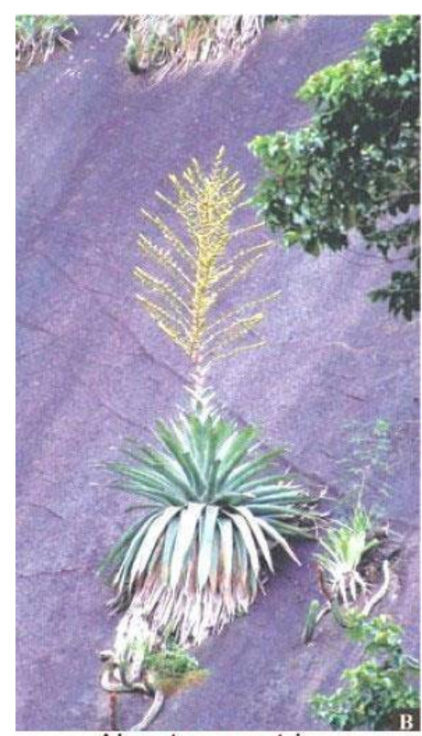
Alcantarea patriae