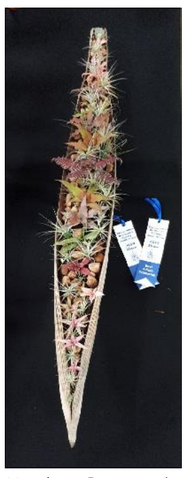
Mavis Downey's Tillandsia and cryptanthus in a palm bract.