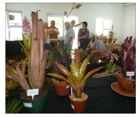
Some species on show an Aechmea and Neoregelia species.