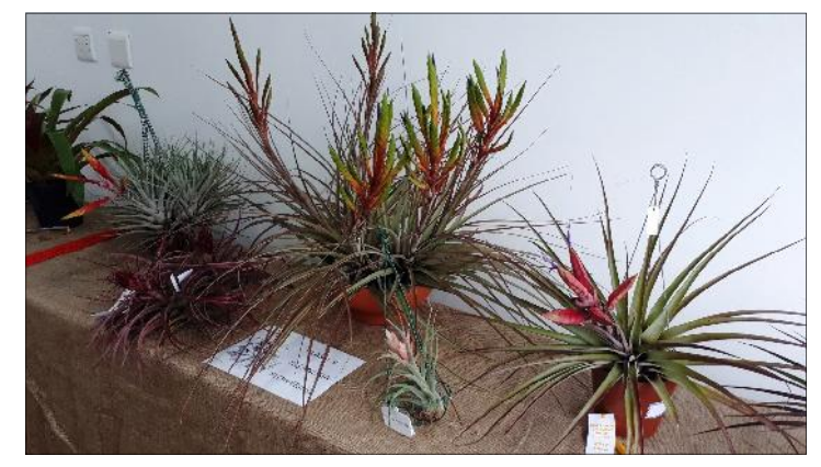
Some of the Tillandsia entries.