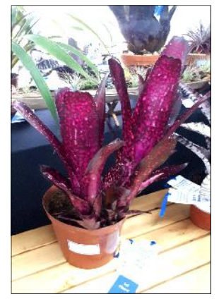
Best on show, Billbergia 'Beadleman' grown by Lyn Wegner.