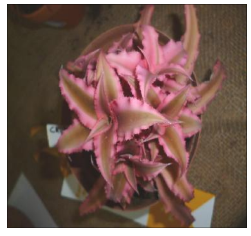
Cryptanthus 'Pink Starlight' grown by Rob and Tracy Moss.