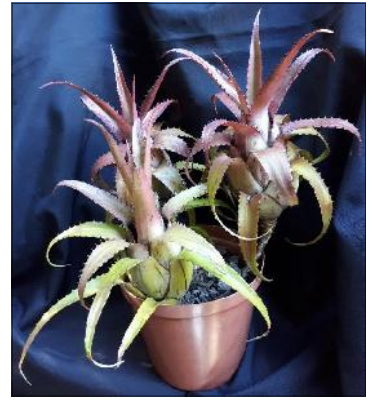
Neoregelia 'Brown Recluse'.

a clean up in the garden and remove all those dead leaves and spent flower spikes to prevent bacteria and fungus developing over the winter months. Lyn will be telling us about spraying with a systemic poison to kill scale at the next meeting, as some of us have found flyspeck scale on Vriesea and some Guzmania. I have been using a contact spray which is quite laborious as every plant has to be sprayed where the scale occurs which is underneath the leaves. It needs to be nipped in the bud before it spreads, so do watch out for it on your softer leaved bromeliads.