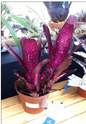
Best on show, Billbergia 'Beadleman' grown by Lyn Wegner.