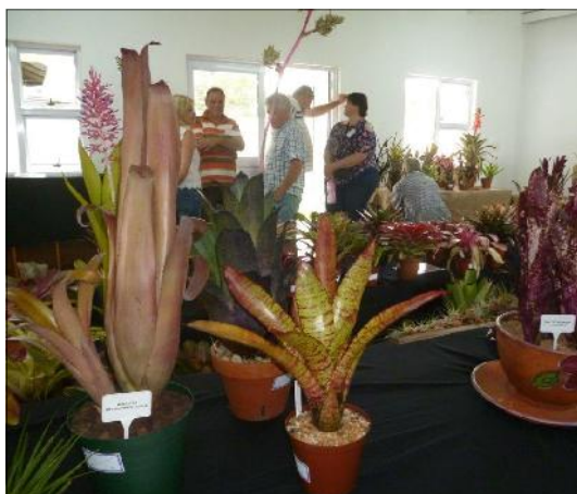
Some species on show an Aechmea and Neoregelia species.