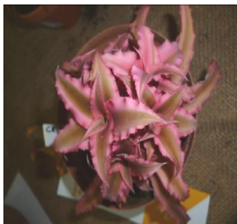
Cryptanthus 'Pink Starlight' grown by Rob and Tracy Moss.