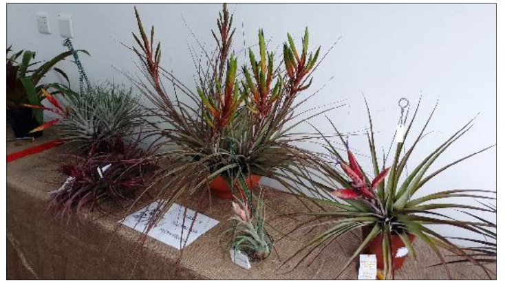
Some of the Tillandsia entries.