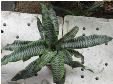
Cryptanthus ‘Milky Way’