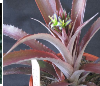
‘Red Burst’ & flowers