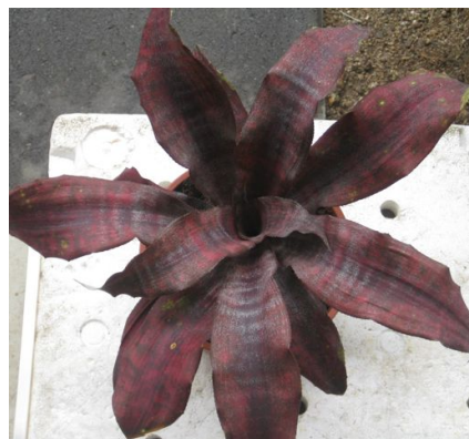
Cryptanthus 'Anne Collings'