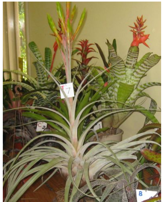
Tillandsia 'Bob's Amigo'