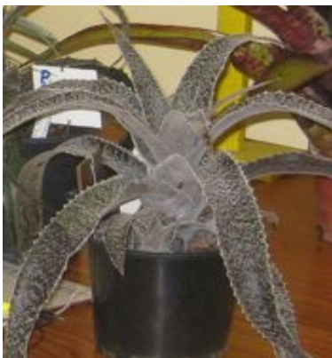
Orthophytum 'Warren Loose'