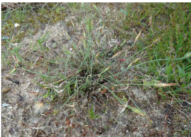
Hypochaeris glabra in typical Breck habitat at Thetford Forest, west Suffolk.

Flower heads (5-15 mm in diameter) contain a cluster of tiny flowers, each with a single yellow petal twice as long as broad (Wilson & King 2003). Each flower produces an outer (beakless) achene and an inner (usually beaked) achene that is 6-9(13.5) mm long (Stace 2010). Flowers only open in full sun and close by early afternoon (Pearman 1994).