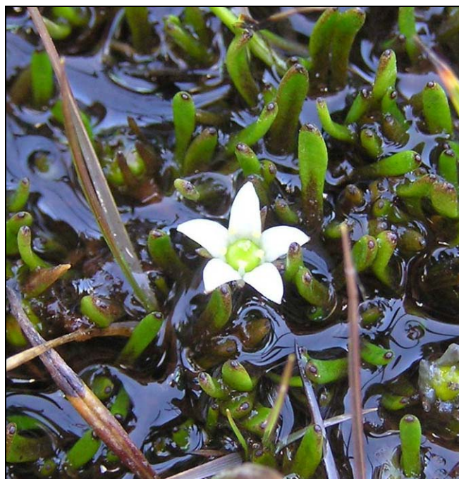
Liparophyllum gunnii , Mt Hauhungatahi

extensive patches of holy grass ( Hierochloa redolens ), a few Ranunculus verticillatus , much Wahlenbergia pygmaea , Forstera bidwillii , Anisotome aromatica and Ourisia vulcanica , and the creeping Uncinia rubra here. Heather was fortunately scarce. Pterostylis humilis and Aporostylis bifolia were found hiding in the bushes of bog pine or alpine toatoa. At the summit (1519 m) a search around rocks revealed abundant Hymenophyllum multifidum and odd plants of Carex acicularis strangely perched on the rocks.