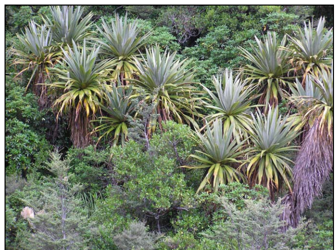
Cordyline indivisa , Bruce Rd, Ruapehu

Off the board-walk, and into forest with more cedar and mountain toatoa, as well as mountain beech continuing in abundance. It was very soft underfoot thanks to the fallen beech leaves. The distinctive grey-green Hymenophyllum malingii was seen on several large cedar trunks, and was much photographed.