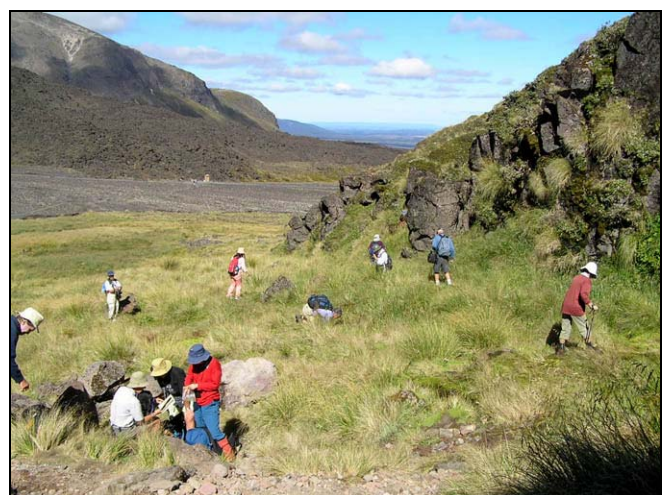
Soda Springs