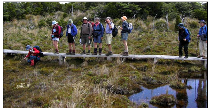
Waitonga Falls Track

This walk starts down the Turoa Road at an elevation of 1143 m, and traverses both forest and alpine wet tussock. The dominant forest tree is mountain beech, with a considerable admixture of mountain toatoa, pink pine, cedar, and silver pine ( Manoao colensoi ). This latter conifer was plentiful and we had a good opportunity to observe its ripe fruit. Prominent understorey shrubs were Coprosma foetidissima , Coprosma colensoi , Olearia arborescens and Raukaua simplex . A common forest herb beside the track was Viola filicaulis .