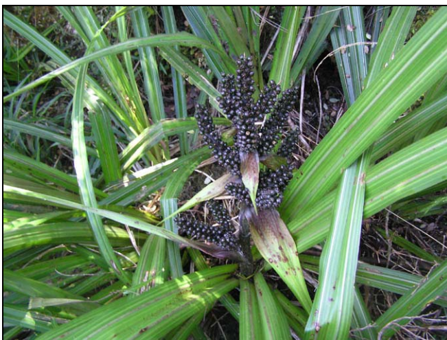
Astelia fragrans , Hauhungatahi, 1350m.

As the slope steepened (alt. 800-900 m) the forest changed into Hall's totara/cedar forest with broadleaf, and including the odd big alpine toatoa to 20 cm diameter. Pink pine ( Halocarpus biformis ) became abundant towards the bush line. On the ground the forest gentian Gentianella chathamica subsp. nemorosa was abundant and in flower. A few plants of Myosotis forsteri were also in flower. Throughout the forest perching plants were almost solely Collospermum microspermum and orchids were almost absent, represented only by Earina autumnalis . Just before the bushline there were thickets of Neomyrtus pedunculata .