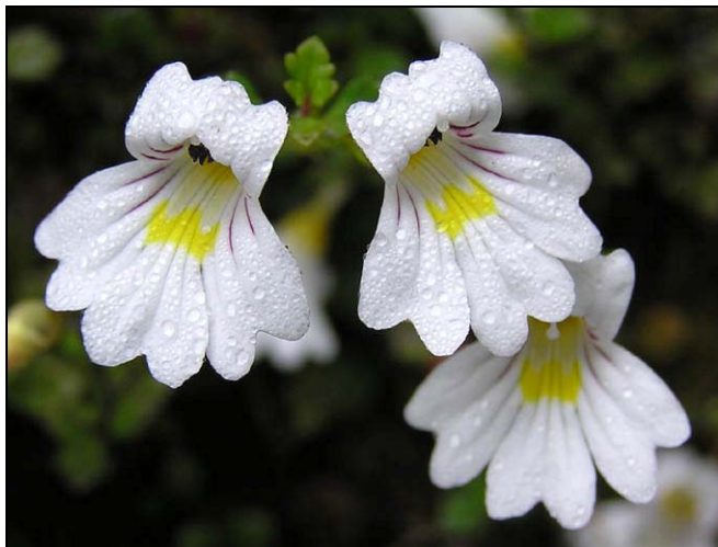
Euphrasia cuneata

schmidelioides , tutu ( Coriaria arborea ) and Coriaria pteridioides . A Gleichenia dicarpa – Empodisma minor wetland had some nice associates such as Drosera binata , Viola cunninghamii and Prasophyllum colensoi , and shady banks had Ourisia macrophylla subsp. macrophylla . It was not long before we found our first clump of eyebright ( Euphrasia cuneata ) – surely one of the loveliest plants on show at this time of year.