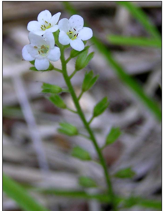
Myosotis forsteri , Whakapapanui Track

After a brief wander along the railway line and a push up through scrub which had regenerated in the last 20 years or so, we entered dense podocarp forest (750 m). On the lower slopes there were scattered very big rimu (and in places, dense stands) with associated matai, miro and kamahi which gradually changed to black maire at mid slope. Some trees of maire looked completely red with ripe fruit. This was damp cool, forest where tree ferns (especially Cyathea smithii ) were dominant in the understorey, and featured the shrubs Pseudopanax colorata , P. axillaris , Alseuosmia pusilla , A. turneri , Coprosma foetidissima and C. tenuifolia . The "trunkless" Cyathea colensoi (the trunk actually runs along the ground, and is usually buried) was growing side by side with juvenile C. smithii , allowing comparisons to be made. There was also Dicksonia lanata and D. fibrosa . Here Microsorium novae-zelandiae perched on trees was a feature. It usually starts up the tree whereas M. pustulatum or M. scandens usually begin in the ground. Another feature was Hymenophyllum pulcherrimum , usually on broadleaf. Oddly too, Blechnum colensoi was present away from its usual stream banks. The most noteworthy ground plants were Astelia fragrans , A. nervosa , Luzuriaga parviflora (base of tree trunks), Libertia micrantha , Myosotis forsteri , Urtica incisa , Viola filicaulis , Cardamine debilis , and Stellaria parviflora . Microlaena avenacea and Uncinia uncinata were abundant in dead kamahi areas.