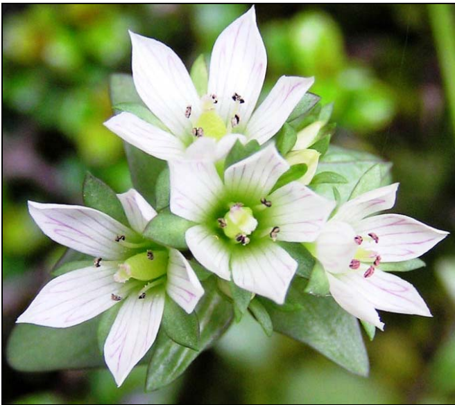
Gentianella chathamica ssp. nemorosa , Silica Rapids

all those knowledgeable people who helped with plant identification.