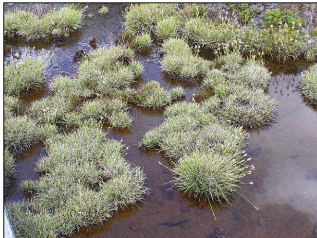
Carpha alpina , Silica Track

Then the party wound down to cross the footbridge over the Tawhainui Stream where there could be seen what I used to call "Hells Bells" or Helichrysum bellidioides when I lived at Cobb River but was told by Maureen that it was now known as "Anna Bells" or Anaphalioides bellidioides , then somebody told us these plants were actually another species, A. alpina as they had larger flowers than plants that grew at lower altitudes. These changes in plant names make it difficult to get one's head around at times especially as one gets older. It was here also where the orchid Prasophyllum colensoi was seen in flower and photographed. After the climb out from the stream crossing and passing tourists on the way we came across a bog beside the board-walk where there was Drosera spatulata and D. arcturi growing side by side. Also in this bog was Craspedia minor both in flower and in seed, which was found in numerous other places, much Celmisia gracilentia , Carpha alpina , Potamogeton suboblongus , Isolepis crassiuscula . It is all a matter of getting one's eye in.