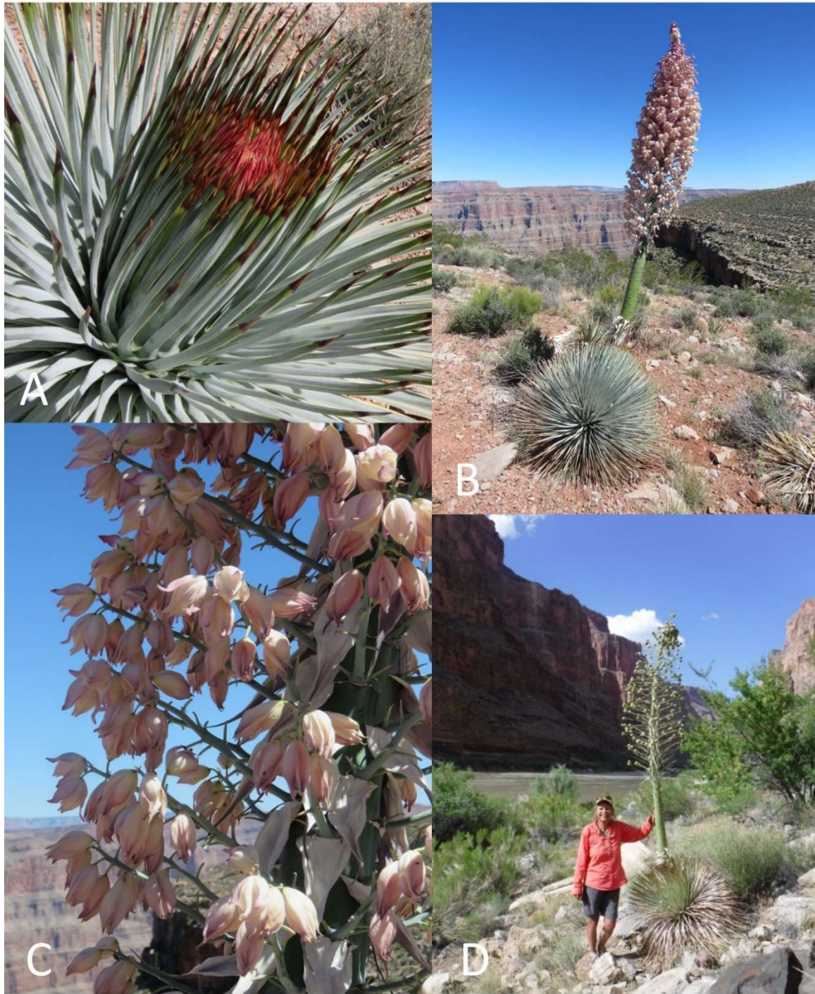
Agavaceae part 2: Hesperoyucca . Figure 2. H. newberryi . A. Rosette as it appears before the flower stalk bolts, the photo taken on March 16, 2019. B. Same plant in flower 33 days later, April 18, 2019 ( Hodgson 32002 et al. , DES). C. Inflorescence ( Hodgson 32002 et al. , DES). D. Habit with fruiting stalk ( Hodgson 32060 et al. , DES).