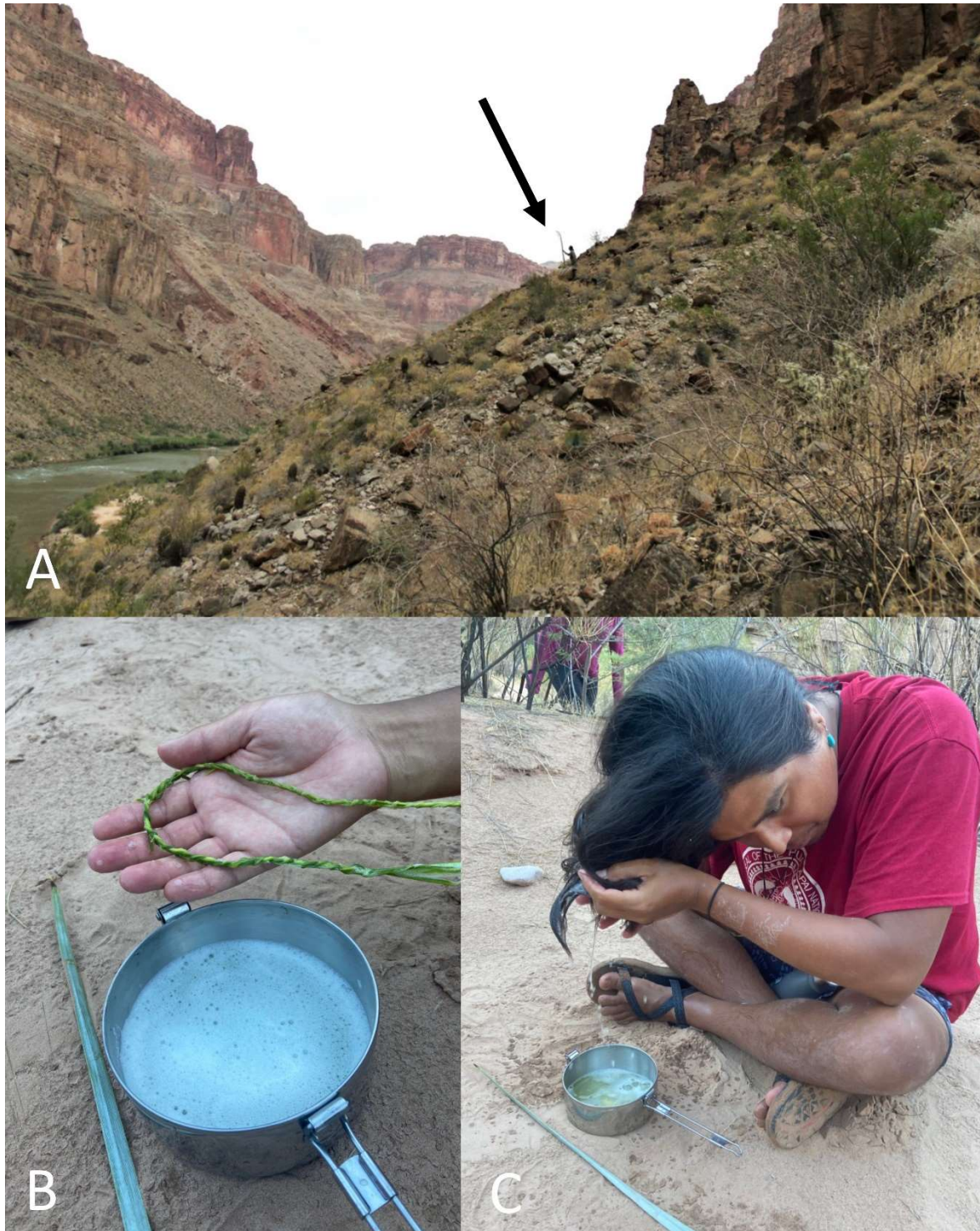
Agavaceae part 2: Hesperoyucca . Figure 4. H. newberryi . A. Typical habitat of steep, rocky slopes with most individuals appearing to occur on north- or northeast facing slopes. The flowering individuals are often few and far between; note the arrow pointing to a person next to a plant in the background. B. Although its uses are not well documented, leaf fibers soaked in water form a soapy liquid and can be braided. C. Vincent Diaz washing his hair with soapy water from leaves soaked in water.