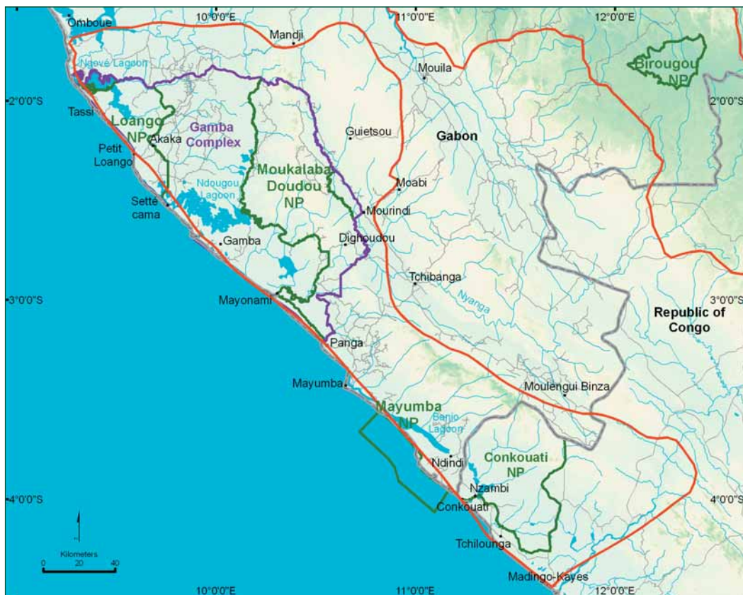
Figure 13.1. Map of Gamba-Mayumba-Conkouati Landscape.