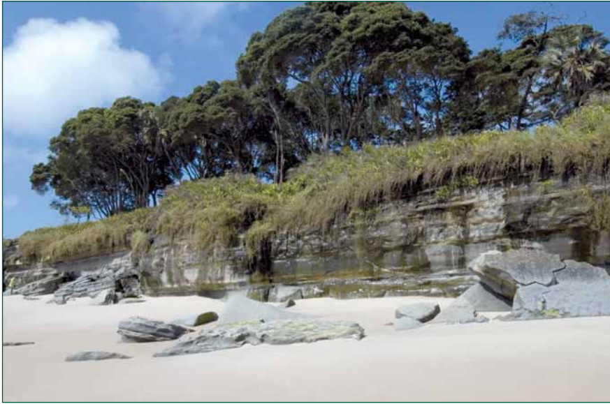
Figure 13.2. Along the coast of Loango National Park are several small cliffs, rich in cretaceous fossils.