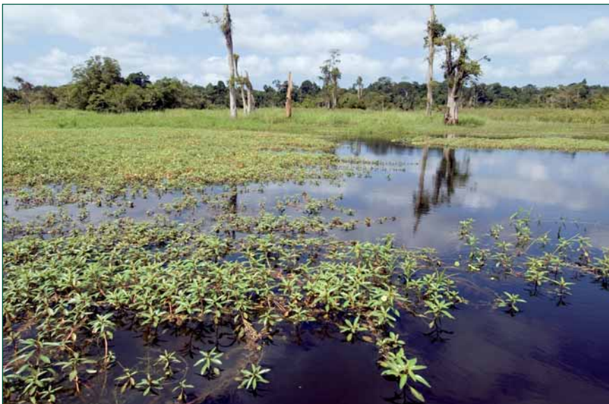
Figure 13.3. The flood plains of the Ngové River in Loango National Park.

to low rising hills behind the beach, intersected by small lagoons and mangroves. The marine sections have a depth of 50 meters at their deepest, and the sea bottoms are sandy with scattered low-lying rocky outcrops (dolerites and gabbros) visible on the coastline.