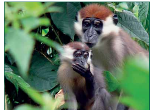
Figure 13.7. The collared mangabey Cercocebus torquatus .