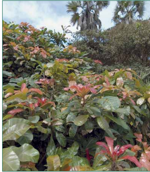
Figure 13.5. Coastal thickets with Fegimanra africana .

black colobus monkey Colobus satanas and the collared mangabey Cercocebus torquatus (Figure 13.7), the Ogooué talapoin monkey Miopithecus ogoouensis , the mandrill Mandrillus sphinx , seven species of duikers, including the white-legged Ogilby's duiker Cephalophus ogilbyi crusalbum , and the defassa waterbuck Cobus ellipsiprymnus , the most important waterbuck in Gabon and probably the only one in the Republic of Congo. In April 2000, four species of bush babies ( Galago sp. 6 , Eutoticus elegantulus , Galagoides thomasi and Galagoides demidoffi ) as well as Bosman's potto Perodicticus potto (Bearder, 2000) were identified around Gamba. The side-striped jackal Canis adustus is found in all savannahs, while the manatee Trichechus senegalensis 7 inhabits the lagoons and some rivers of both Gabon and the Republic of Congo.