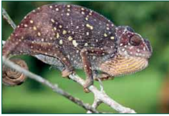
Figure 13.8. The chameleon Chamaeleo dilepis .