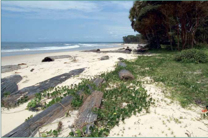
Figure 13.10. The lost logs on the beaches of the Gamba Complex of Protected Areas are a permanent threat to the marine turtles.