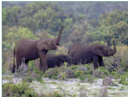
Figure 13.6. Elephants in coastal vegetation.