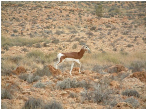
Gazella dama . Bou-Hedma National Parc. Tunisia. © Heiner Engel. Hannover Zoo. 2005.