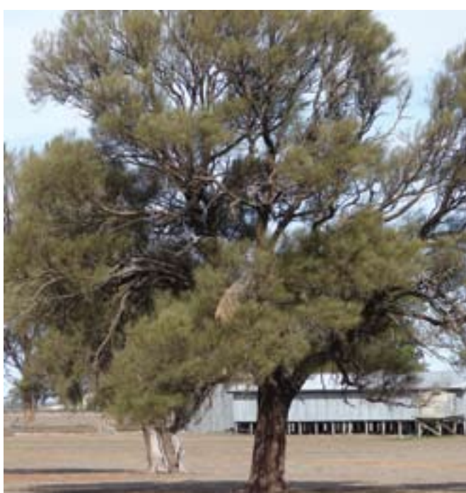
Mature Buloke paddock tree