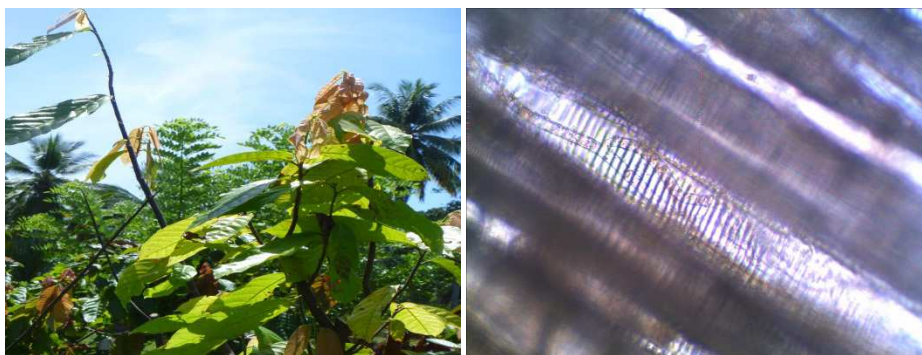
Fig. 2. Left: Cocoa tree in Sulawesi, Indonesia infected with VSD. Right: LS of a stem of infected cocoa showing hyphae of the causal organism, C. theobromae , in a xylem vessel, magnified x400.

A devastating disease of cocoa is witches' broom, caused by a co-evolved pathogen of cocoa, a basidiomycete species, Moniliophthora perniciosa . The disease causes distortion of growth in the shoots, creating a broom-like appearance. Although the pathogen co-evolved with cocoa, it has caused most damage in plantations in Bahia, Brazil away from its centre of origin in the Amazon rainforest. Improved management, including the appropriate use of fertilisers, combined with the introduction of resistant cocoa genotypes has been effective in mitigating the impact of this disease (Keane and Putter, 1992). Dieback in cocoa caused by L. theobromae has been observed in the Cameroons (Mbenoun et al., 2008) and in India (Kannan et al. 2010). Vascular streaking has been observed in both cases. Kannan et al. (2010) isolated the pathogen and reinoculated seedlings, which showed disease symptoms after 20 days. Infection by L. theobromae is facilitated by