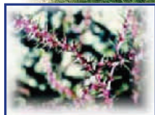
Salsola iberica/S. australis, S. tragus