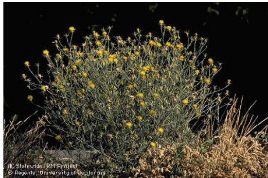
YELLOW STARTHISTLE One of the most invasive noxious weeds in California

University of California Cooperative Extension (559) 685-3303 USDA Natural Resources Conservation Service (559) 734-8732 Tulare County Agricultural Commissioner's Office (559) 685-3323