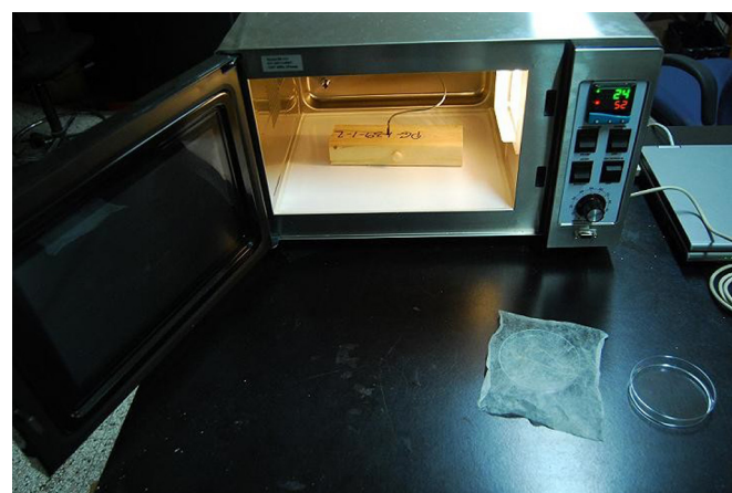
Fig. 1. BP-111 compact microwave processor with temperature probe inserted in jack pine block. The hole containing the larva is plugged on the front-facing side.

For fungal irradiation, we drilled four holes equidistant in the forward facing side of each block (same as in Fig. 1). The holes were 1.6 cm wide and 3.8 cm deep. We made them wider than for