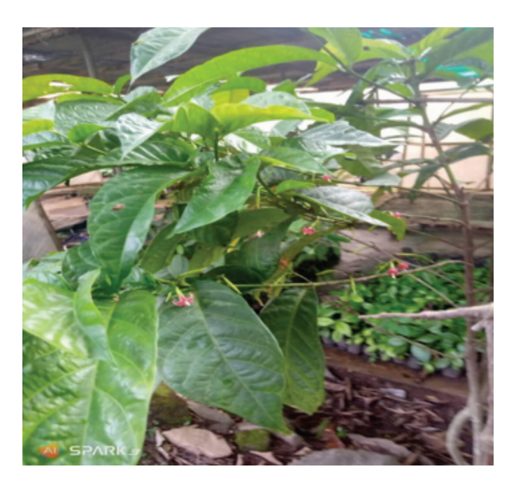
Figure 1. Massularia acuminata plant

M. acuminata (G. Don) Bullock ex Hoyle is a shrub (Figure 1) that belongs to the family Rubiaceae and is widely distributed in West Africa. It is commonly known as the chewing stick tree. Its root, leaf, bark, and twig have several medicinal values, and it is used traditionally in some West African regions for treating diarrhea, dysentery, muscular pains, and venereal diseases and as an aphrodisiac.<sup>19</sup> Pharmacological studies have shown the plant to possess a strong antibacterial property against oral pathogens.<sup>20-22</sup>