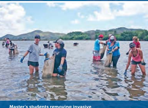
Master's students removing invasive limu at Waikalua Loko Fishpond.