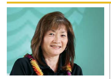
EXCEPTIONAL STAFF SERVICE AWARD

Each Spring, the COE Faculty Senate Fellowship Committee issues a call for faculty and staff nominations. These are submitted electronically through a system that calculates and averages scores for each category. Six individuals and one team were recognized in May 2015.