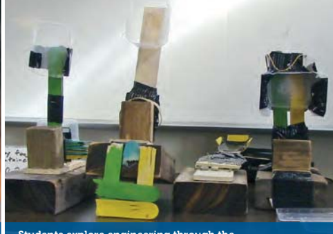
Students explore engineering through the design and construction of catapults.