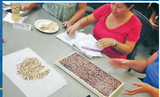
Educators use estimation and graphing to consider the adaptability of honey bees to a particular environment.