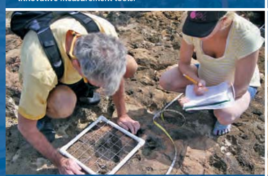
Teachers learn to identify intertidal species and collect data on their abundance.