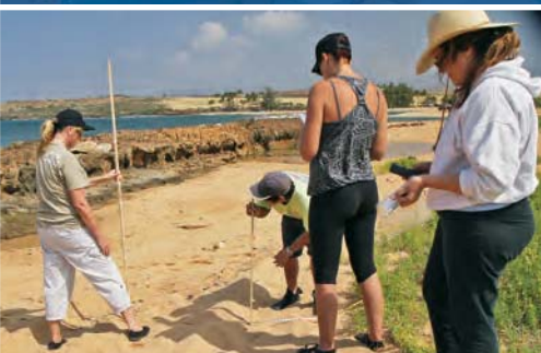
Teachers learn to map the beach and intertidal area to create a physical profile.