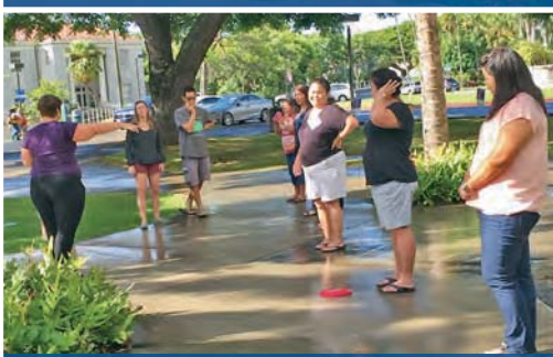
Educators create a geometric model for imaginary numbers with a human number line.