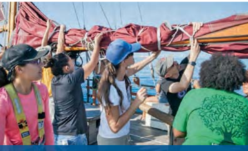
Students participate in sailing and cultural engagement aboard the PVS's Hikianalia.

Whether approached individually by each letter of the well-known acronym, STEM - Science, Technology, Engineering, and Mathematics, or integrated broadly into everything from the arts to wayfinding, STEM programs and their interpretation are limitless. Numerous programs in the College of Education address these broad disciplines through cultural practices, diverse populations, and the natural environment to illustrate how STEM and its practitioners exist all around us. The following are some examples of how STEM in the COE is taught through a multi-lens approach.