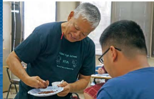
Students work with a science expert to test soil.