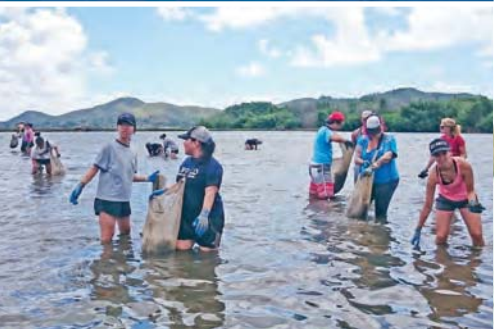
Master's students removing invasive limu at Waikalua Loko Fishpond.