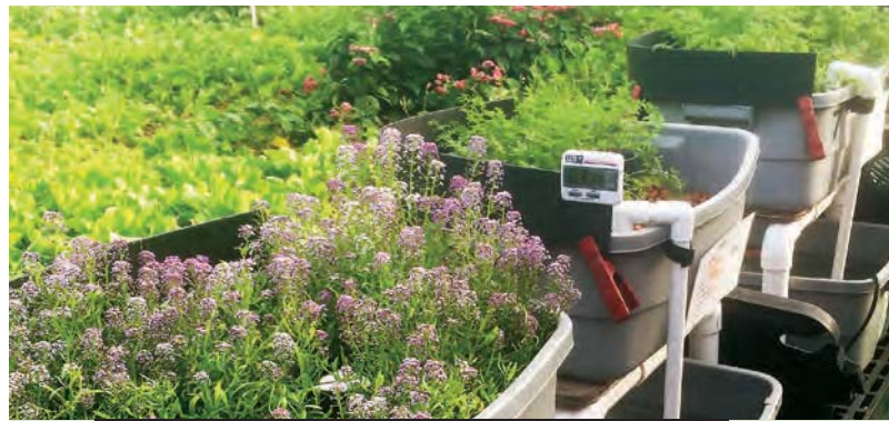
Maui Aquaponics Farm