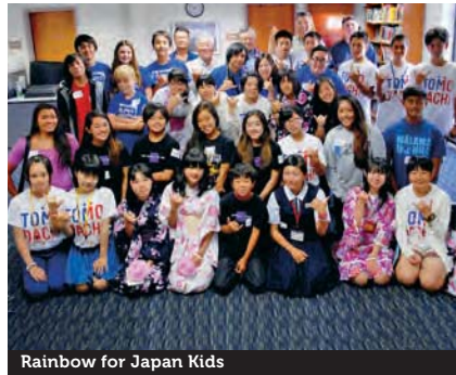
Rainbow for Japan Kids