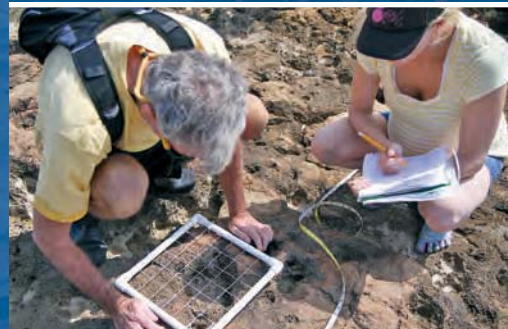
Teachers learn to identify intertidal species and collect data on their abundance.