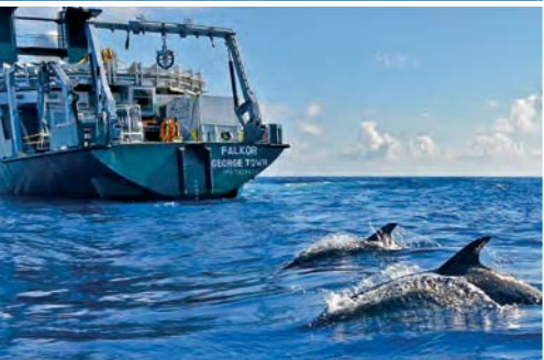
Research Vessel Falkor uses multi-beam SONAR to map the Northwestern Hawaiian Islands.