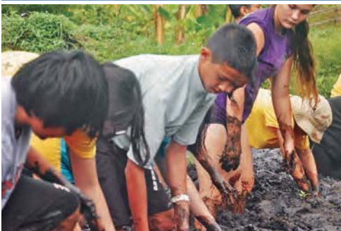
Students work in the lo'i kalo at Papahana Kuaola to learn about sustainability.