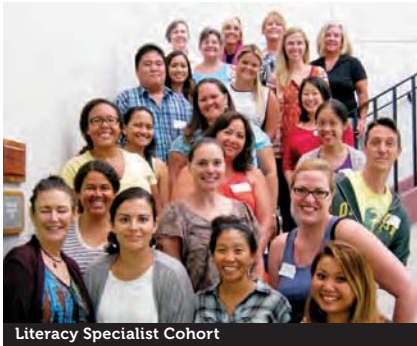
Literacy Specialist Cohort