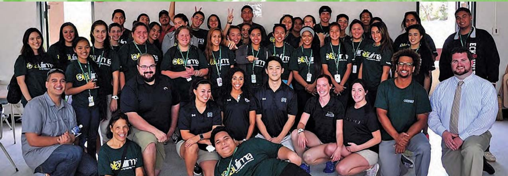
Ke Ola Mau Youth Summit