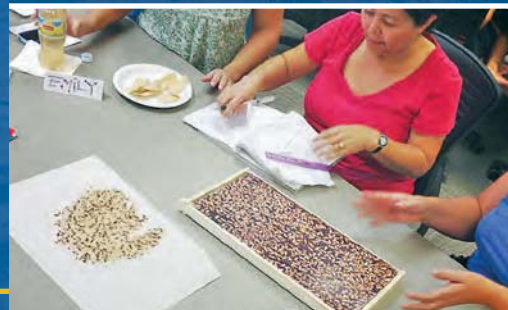
Educators use estimation and graphing to consider the adaptability of honey bees to a particular environment.