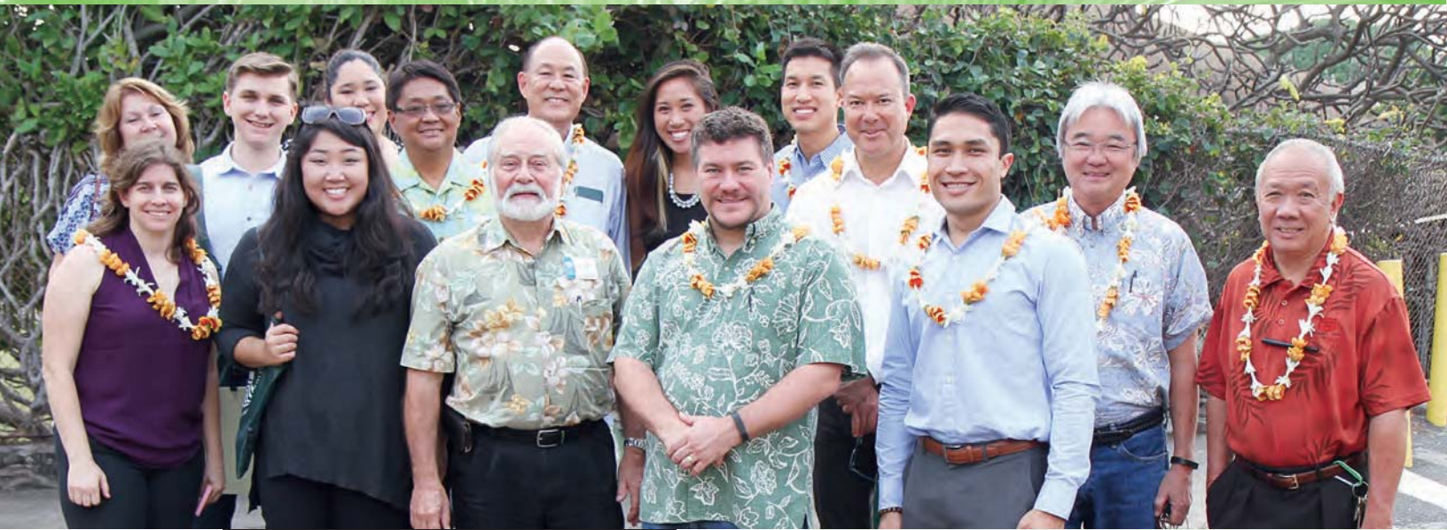
COE Faculty with Hawai'i State Representatives