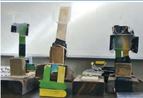
Students explore engineering through the design and construction of catapults.