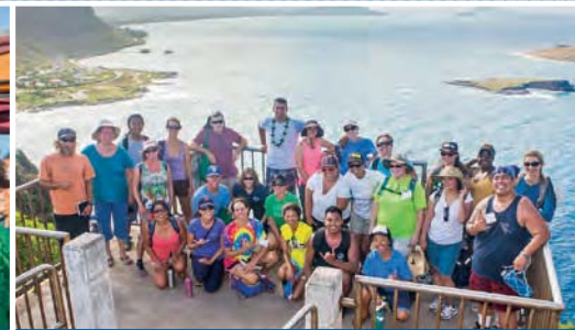
Students observe currents, winds, and waves at Makapu'u Point Lighthouse.