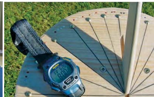
Students use a sundial to tell time.