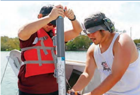
Master's students working with C-MORE to test water quality in Kaneohe Bay.