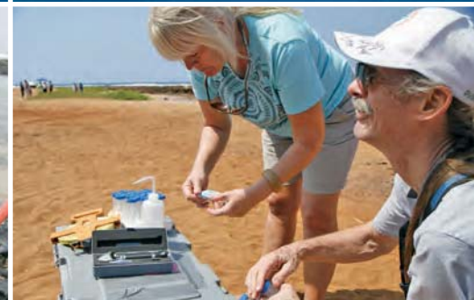
Teachers learn to take water quality measurements.