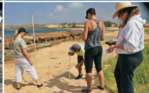
Teachers learn to map the beach and intertidal area to create a physical profile.