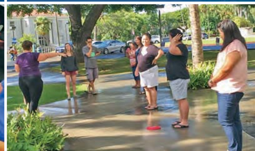
Educators create a geometric model for imaginary numbers with a human number line.