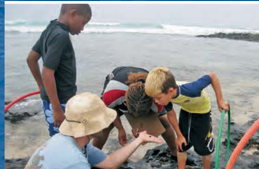
Students use hula hoops as innovative measurement tools.