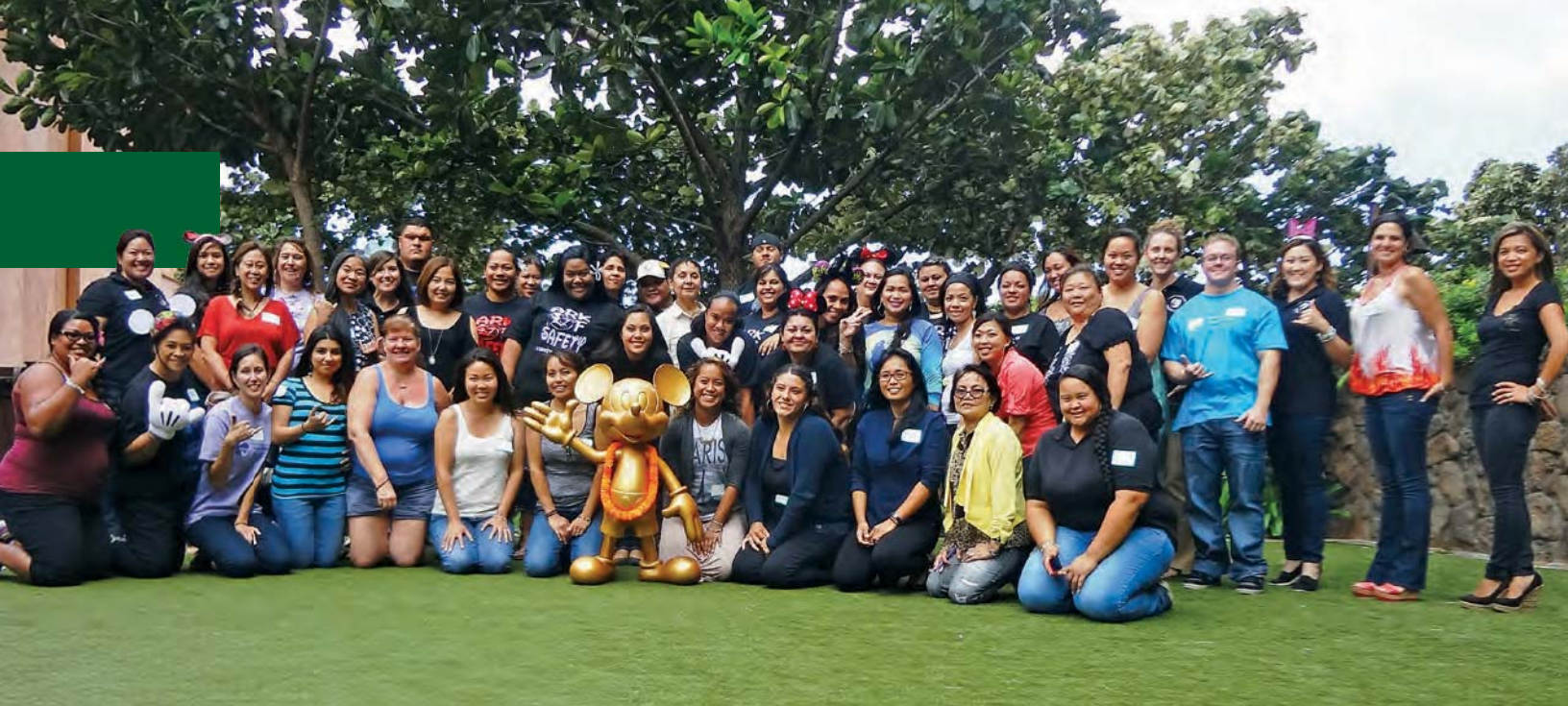
HPEP Project Participants