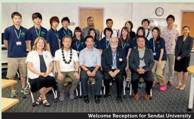
Welcome Reception for Sendai University