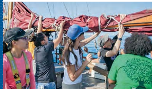
Students participate in sailing and cultural engagement aboard the PVS's Hikianalia.

Whether approached individually by each letter of the well-known acronym, STEM – S cience, T echnology, E ngineering, and M athematics, or integrated broadly into everything from the arts to wayfinding, STEM programs and their interpretation are limitless. Numerous programs in the College of Education address these broad disciplines through cultural practices, diverse populations, and the natural environment to illustrate how STEM and its practitioners exist all around us. The following are some examples of how STEM in the COE is taught through a multi-lens approach.