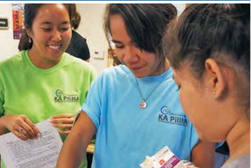
Students learn about food science by making homemade ice cream.