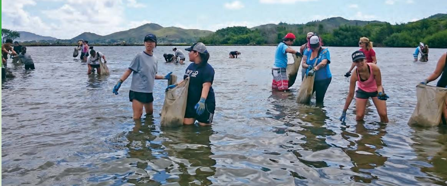
STEMS 2 Cohort