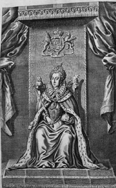
The Illustrious and most Renowned Princess ELIZABETH late QUEEN of ENGLAND