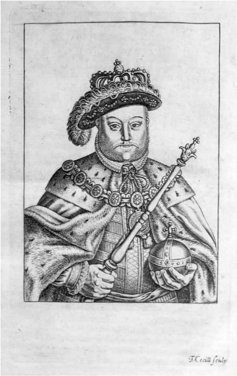
Engraving of Henry VIII in front matter of Lord Herbert's biography.