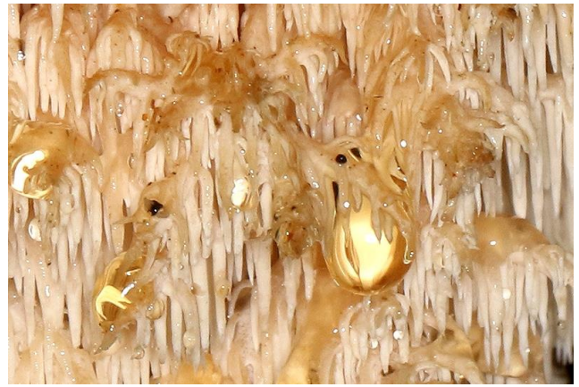
Coral Tooth Fungus

I immediately started jotting down species of fungus as the group found many nearby. We started off at a slow pace to the sight of bodies getting down low, flashes going off and conversations over what was being found. On top of the fungi, Ken also pointed out some of the beautiful lichens found, as well as ferns – he was collecting a few for the botany group to study the following Saturday. As always, David was busily compiling a list of birds as each one called or crossed our path.