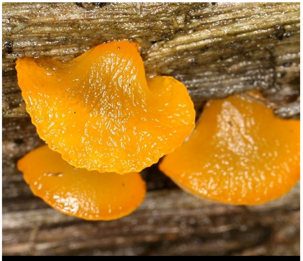
Golden Jelly Bells Heterotextus peziziformis photographed during the May excursion to Duff Sawmill Track near Traralgon South (Photo: Matt Campbell).

Held at 7:30 pm on the fourth Friday of each month at the Newborough Uniting Church, Old Sale Road Newborough VIC 3825