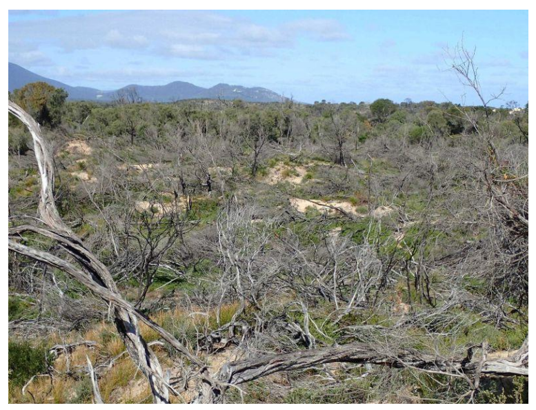
Dune regrowth amongst the fallen Coast Tea Tree

Currently the Yanakie Isthmus Coastal Grassy Woodland Adaptive Experimental Management Project is gathering information and exploring management strategies that may eventually contribute to the restoration of the Coastal Grassy Woodland vegetation types. An expert Technical Advisory Group was established in 2009 to review research and provide advice on the program.