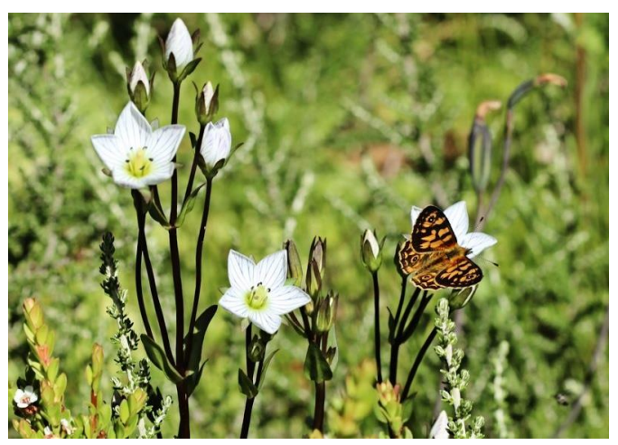
Snow Gentians are one of the many wildflowers to be found at St Gwinear in summer

For more information, contact Alix on 5127 3393 or alixw@spin.net.au