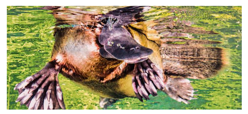
A platypus has many strange features

They showed some remarkable footage of platypus feeding, their food consisting mostly of shrimps, worms and larvae of insects. When feeding, they close their eyes and ears and use the receptors on their bill to locate food. It was the bill that fascinated the early zoologists, but it is only recently that we have begun to understand it. The bill has receptors that are sensitive to touch and the electrical impulses of their prey.