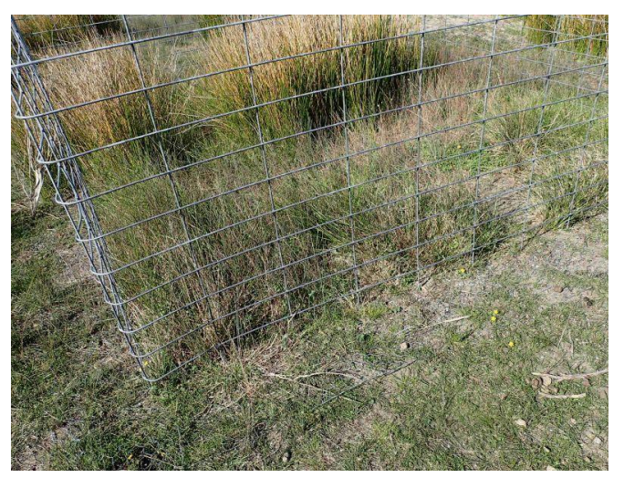
Vegetation inside and outside the herbivore exclusion plot

Although Coast Tea Tree cover is now very much reduced, it is intended to burn this site again within five years, hopefully before the remaining Coast Tea Tree produces viable seed. Also, it is intended to repeat a similar burn to further test the effectiveness, and possibly to improve, this management technique. Research, such as the use of exclusion plots, has shown that current levels of grazing will kill native grasses and other woodland plants that attempt to re-colonise the open areas created by the burn. To restore Coastal Grassy Woodlands it will be necessary to exclude or limit the size of populations of grazing animals (deer, rabbits, wombats and kangaroos) in selected areas.