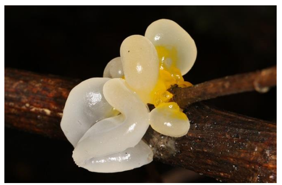
Tremella mesenterica

David was waiting for us at the southern end of the track and it wasn't long before everyone was ready to head off. Yours truly somehow ended up with pen and paper in hand as Ken suggested someone do a writeup of the day while staring in my direction and