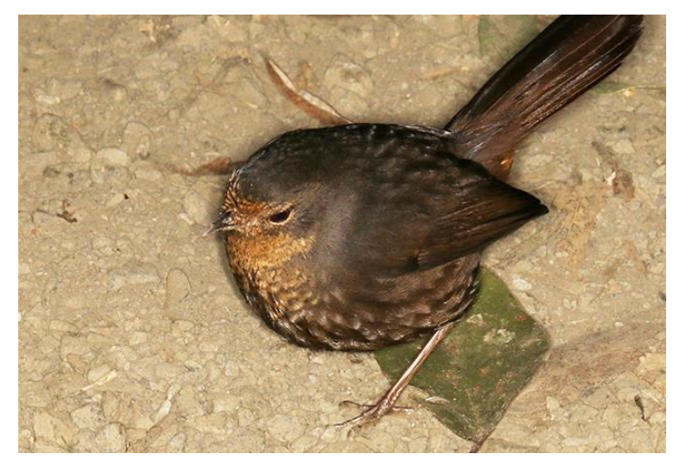
The Pilotbird that visited us during lunch