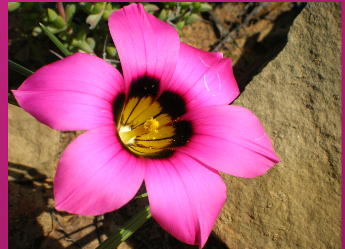
Alan Horstmann: http://www.ispot.org.za/node/157959?nav=search