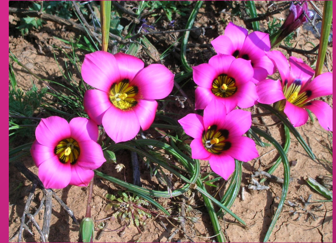
Alan Horstmann: http://www.ispot.org.za/node/157959?nav=search

“Many horticulturalists I have spoken to during this study are not just interested in Romulea because of their beautiful flowers, but also because growing seeds of Romulea to the flowering stage is considered somewhat of a horticultural feat and they aspire to the challenge” (Swart 2012).