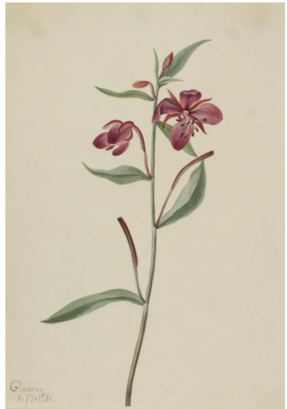
Figure 1: Epilobium latifolium water colored by Mary Vaux Walcott which is featured in the Smithsonian Art Museum.

Epilobium latifolium (L.) Holub was once classified as Chamerion latifolium (L.) Sweet and subdentatum (Rydb.) Á. Löve & D. Löve. Other common names for this species include “Alpine Fireweed” and “Broadleaf Willowherb”. The variance in names of this plant can be attributed to its geographic distribution throughout the northern hemisphere. Within North America, it can be found throughout much of the continent (Figure 2), excluding the southernmost states near the