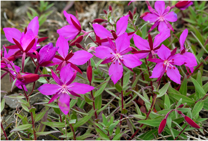
Figure 3. Flowering closeup of Epilobium latifolium .

prefers rocky or sandy soils, it can grow in almost any soil type and can tolerate a pH from alkaline, neutral to acidic. It is not commonly found in nutrient poor or water logged soils (Fleenor 2016).