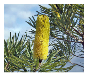
Banksia attenuata Dwarf Slender Banksia