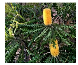
Banksia Grandis Bull Banksia