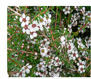
Astartia scoparia Common Astartia 1.5m