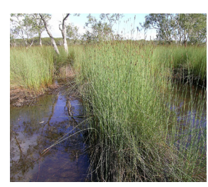
Baumea Juncea Bare Twig Sedge 1m