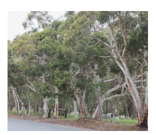
Eucalyptus lane-poolei Salmon Ghost Gum