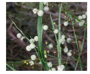
Acacia willdenowiana Grass Wattle 0.6m