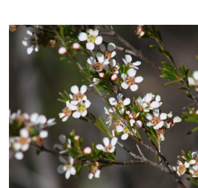
Pericalymma ellipticum Swamp Tea Tree 3m