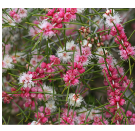
Hypocalymma angustifolium White Myrtle, 1.5m