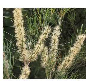
Melaleuca teritifolia 'Banbar' 4m