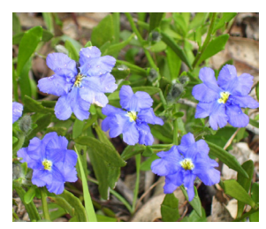
Dampiera linearis Common Dampiera 0.2m