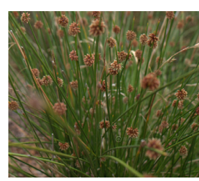
Ficinia nodosa Knotted Club Rush 1m