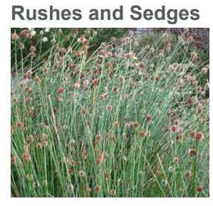
Chorizandra enodis Black Bristle Rush 1m