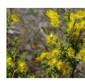
Verticordia acerosa 1m