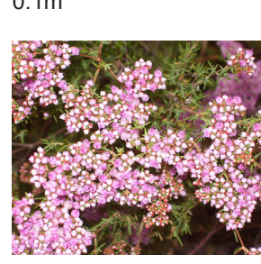
Verticordia densiflora Compact Feather Flower 1 - 2m