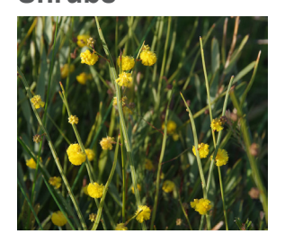
Acacia applanta 0.4m