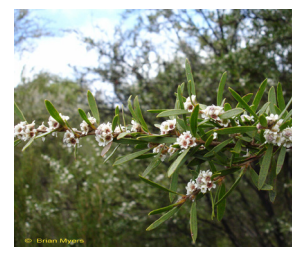
Taxandria linearfolia Swamp Peppermint Up to 5m