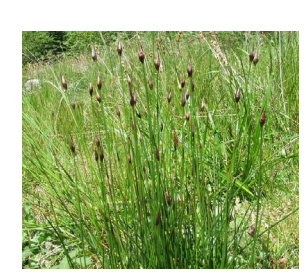
Juncus subsecundus Finger Rush 0.5 - 1m