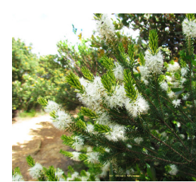
Melaleuca viminea 'Mohan' 5m