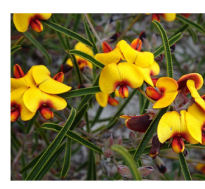
Gastrolobium capitatum Egg and Bacon 0.5m