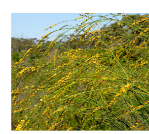
Viminaria juncea Swishbush 1 - 4m