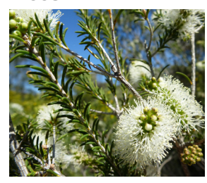
Melaleuca rhaphiophylla Swamp Paperbark Up to 8m