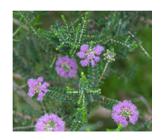
Regelia ciliata Regelia 0.8 - 2m