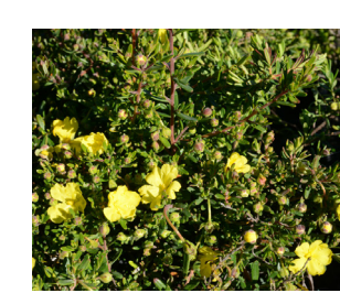
Hibbertia hypericoides Yellow Buttercups 0.5m