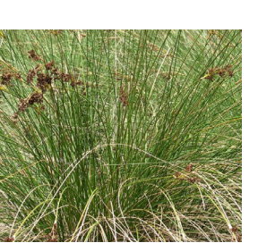
Juncus krausii Sea Rush 1.5m