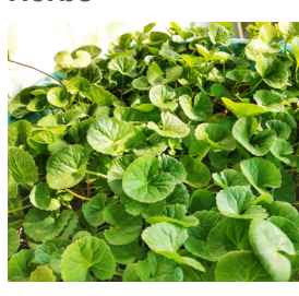
Centella asiatica Centella 0.2m