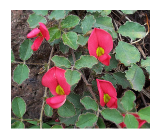
Kennedia prostrata Scarlett Runner 0.1m