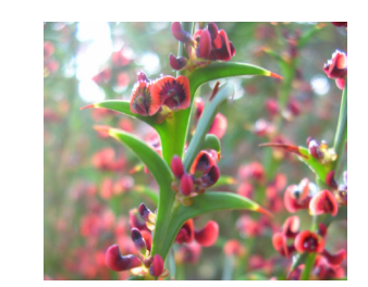
Daviesia decurrens Prickly Bitter Pea 0.5 - 1m