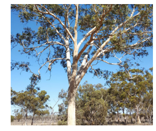
Eucalyptus wandoo Wandoo Up to 25m