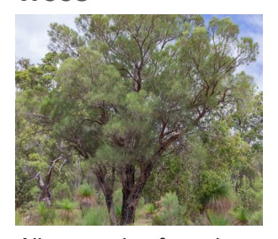
Allocasuarina fraseriana Western Sheoak 5 - 15m