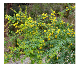
Acacia pulchella Prickly Moses Up to 1.5m