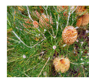
Banksia telmatiaea Swamp Fox Banksia 0.5 - 2m