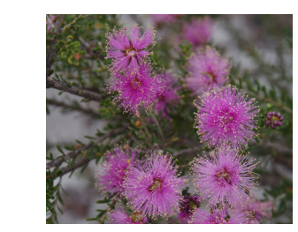
Melaleuca seriata 1m