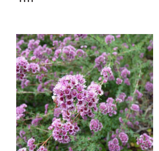
Verticordia plumosa Plumed Feather Flower