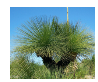
Xanthorrhoea preissii Grass Tree 0.3-3m