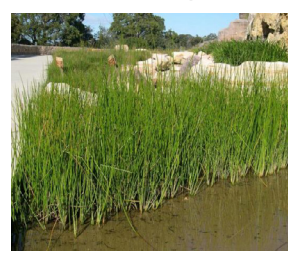
Baumea articulata Jointed Twig Sedge 2.6m