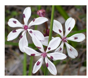
Burchardia Multiflora Dwarf Burchardia 0.3m