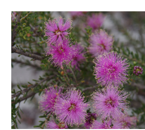
Melaleuca seriata 1m