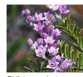
Philoteca spicata Pepper and Salt 0.5m