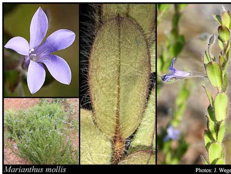
Plate 1: Marianthus mollis (DPaW, 2016)

No Threatened Flora of conservation significance, pursuant to Subsection 2 of Section 23F of the WC Act were located during the floristic survey. One plant taxa pursuant to section 179 of the EPBC Act was located during the floristic survey, Marianthus mollis (Plate 1). This species is also listed as Priority (P4) under the WC Act. All records of M. mollis were in the north-east and east of the proposed disturbance footprint . Three historical records from the WA herbarium of Hydrocotyle sp. decipiens , listed as Priority 2 under the WA Act,. were confirmed still present during the survey. These individuals are located within what was proposed to be disturbed in the original mine layout. However, under the current revised site layout the population will not be directly impacted. The location of conservation significant flora observed is presented in Figure 3-4 and Appendix 12.