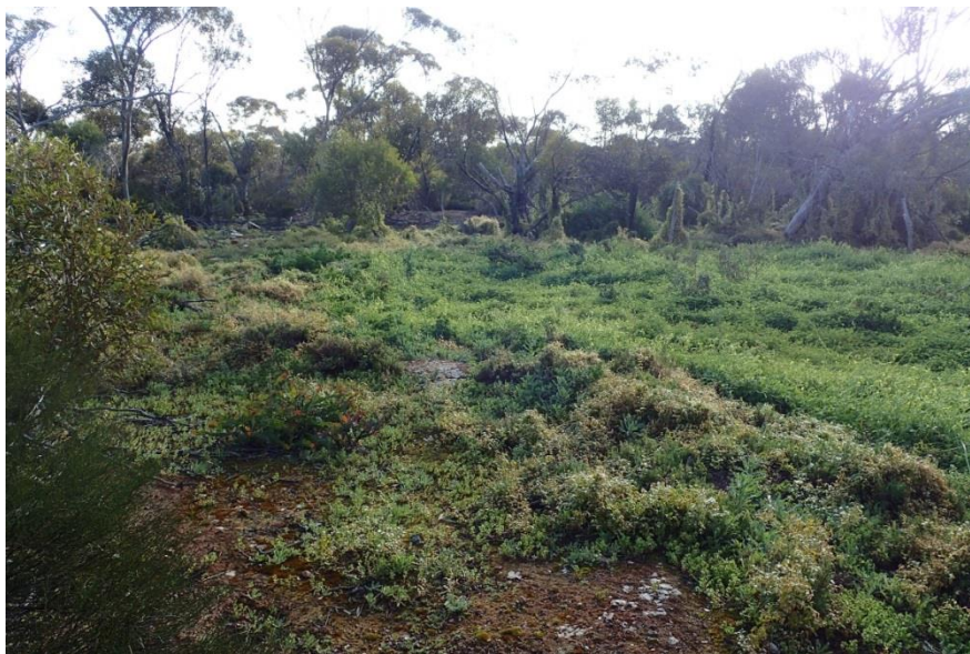
Plate 2: A zonal weed patch (APM, 2016)

*Asparagus asparagoides is classified as a Weed of National Significance (WONS) under the Biosecurity and Agriculture Management Act 2007 (BAM Act). The locality of this species is isolated to areas of high disturbance and is associated with annual weed species. These visually homogenous weed patches appear as isolated a-zonal patches (Figure 3-5 and Plate 2). Localised management practices could be developed and applied.