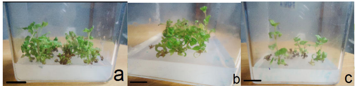
Figure 1. Shoot initiation from in vitro germinated seedling on MS medium enriched with a ) 1.5 mg/l BAP, b ) 0.5 mg/l BAP, c) 0.5 mg/l KIN. Bars =.1 cm

Means within columns having different letter (lower case) in superscript are significantly different at p < 0.05.