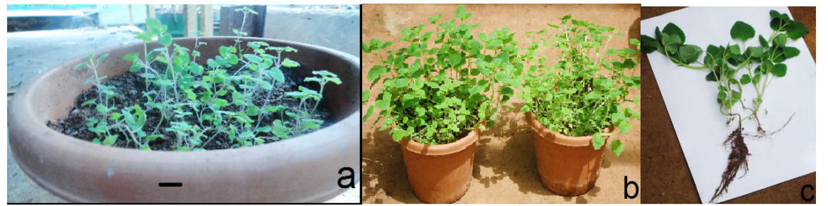
Figure 4. Acclimatization of plantlets of S. abyssinica in greenhouse. a ) After 60-days, b ) After 90-days, c ) uprooted 90-days old plant. Bars = 1 cm.