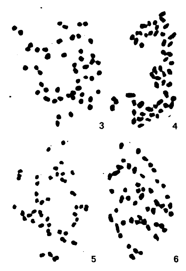
Figs. 3-6. Chromosomes in root tip cells of African monopodial orchids: (3) Aerangis ugandensis, 2n = 50;-(4) Aerangis kirkii, 2n = 52;-(5) Aerangis luteo-alba var. rhodosticta, 2n = 42;-(6) Aerangis citrata, 2n = 50. (Ca 2000×).

The Aerangidinae on the other hand comprises about 30 genera with about 260 species. Its larger genera are Aerangis (about 50 species) and Dia phananthe (about 50 species). Second in size are