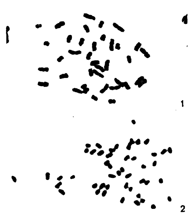
Figs. 1-2. Chromosomes in root tip cells of African monopodial orchids: (1) Angraecum leonis, 2n = 38;- (2) Angraecum aporoides, 2n = 48. (Ca 2000×).

for at present only about 7% of the species of the Angraecinae and about 25% of the species of the Aerangidinae have been analysed. This means that the conclusions which will be drawn below might be affected by the outcome of future research.