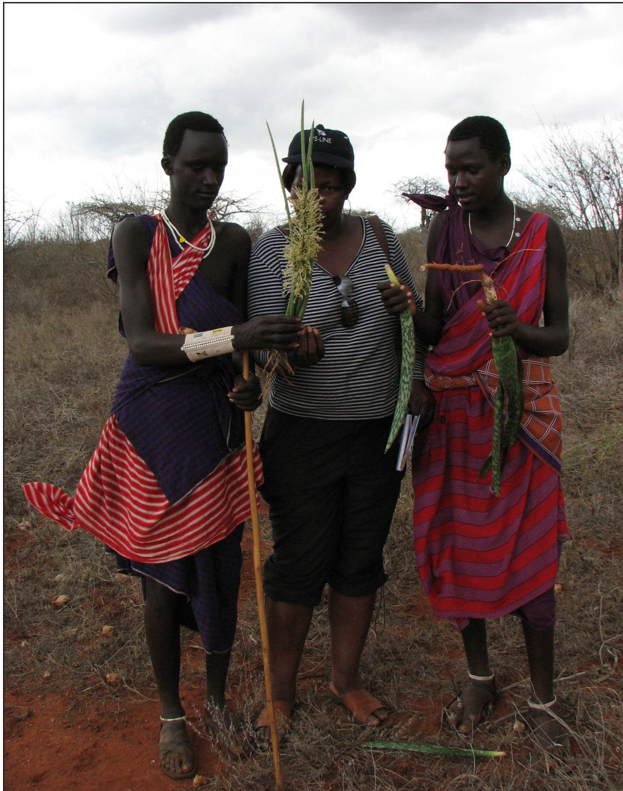
Figure 7. Maasai men showing two Sansevieria species; S. volkensii Gürke (L) and S. nitida Chahin (R), with the one to the right indicating the specific plants of S. nitida used for culinary purposes in soup and meat dishes in Coast Province of Kenya.