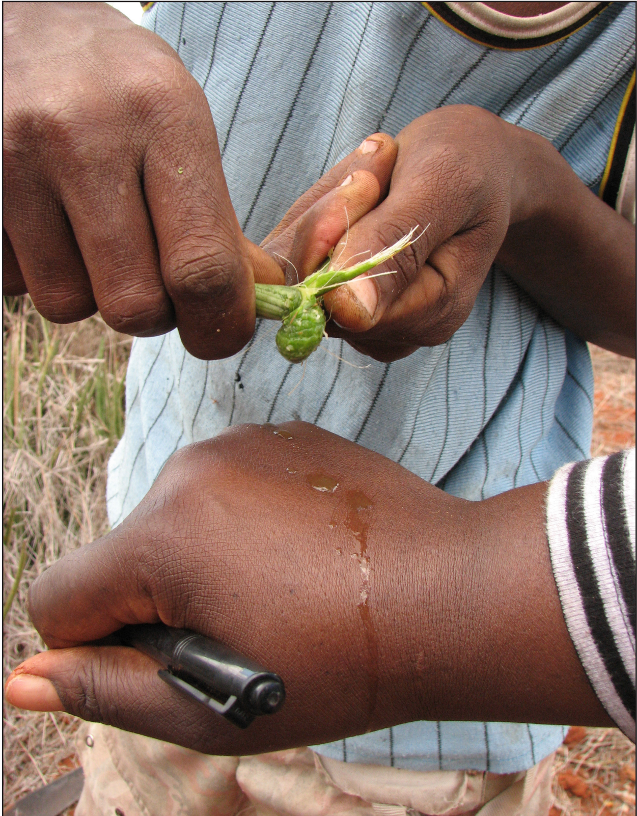
Figure 6. Informant demonstrating how sap is squeezed straight from the leaf of Sansevieria fischeri (Baker) Marais onto a wound, in Coast Province of Kenya.