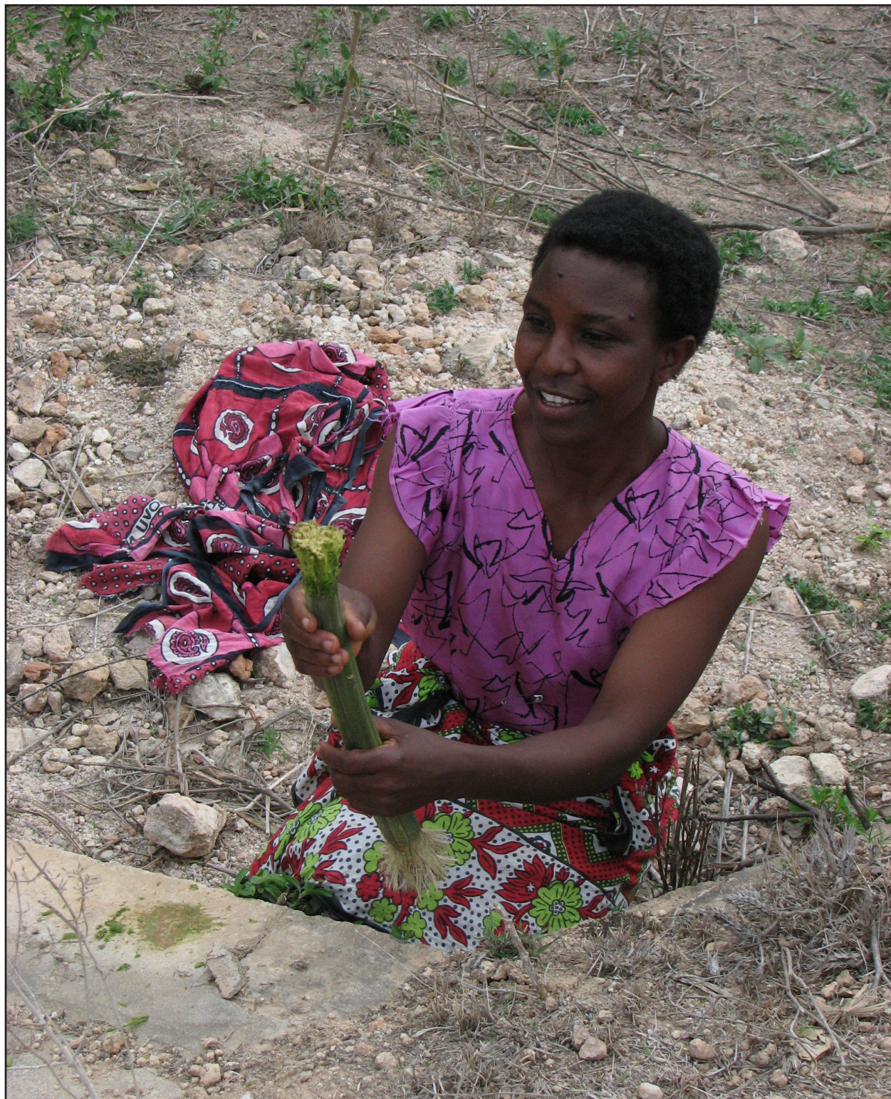
Figure 4. Sansevieria fischeri (Baker) Marais leaves used as brushes in Coast Province of Kenya. A stone is used to gently crush the end of the leaf until the fibers (for bristles) are separated from the soft leaf tissue. A detergent or sand is added to the bristles before it is used for cleaning. The upper end shows a brush under preparation, the lower end shows a previously made brush.