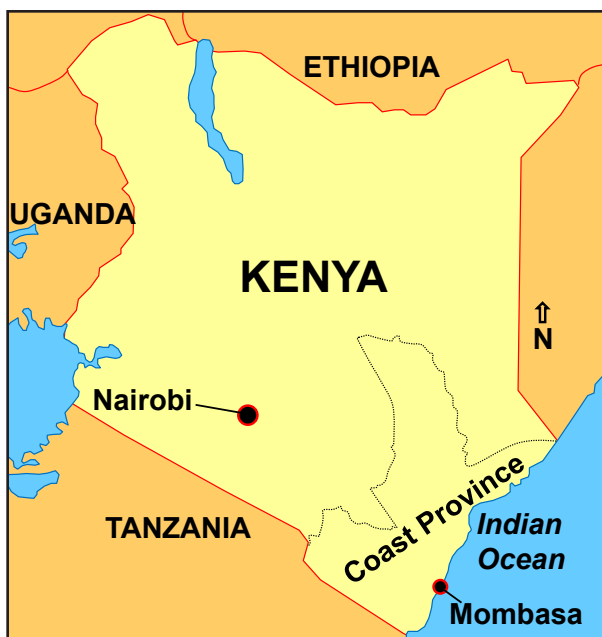
Figure 1. Coast Province of Kenya.

Coast Province of Kenya (Figure 1) currently includes six counties: Kilifi, Kwale, Lamu, Mombasa, Taita-Taveta and Tana River. The areas visited during the study were mostly in the Taita-Taveta and Kilifi counties. Taita-Taveta County lies about 200 km northwest of Mombasa and 360 km south east of Nairobi. The population of Taita-Taveta County is estimated to be 250,000 people (2009 Census). Taita-Taveta County covers an area of 16,975 km 2 , about 62% of which is within Tsavo National Park. About 5,876 km 2 of the area is occupied by ranches and sisal estates, and water bodies which cover less than 100 km 2 . Taita-Taveta County has approximately 25 ranches with the main land use being cattle grazing. The Coast Province is also home to three operating sisal estates in Taita-Taveta County, namely Taita Sisal Estate, Voi Sisal Estate, and Taveta Sisal Estate. Many ranches in the area are also utilized for wildlife tourism and conserva-