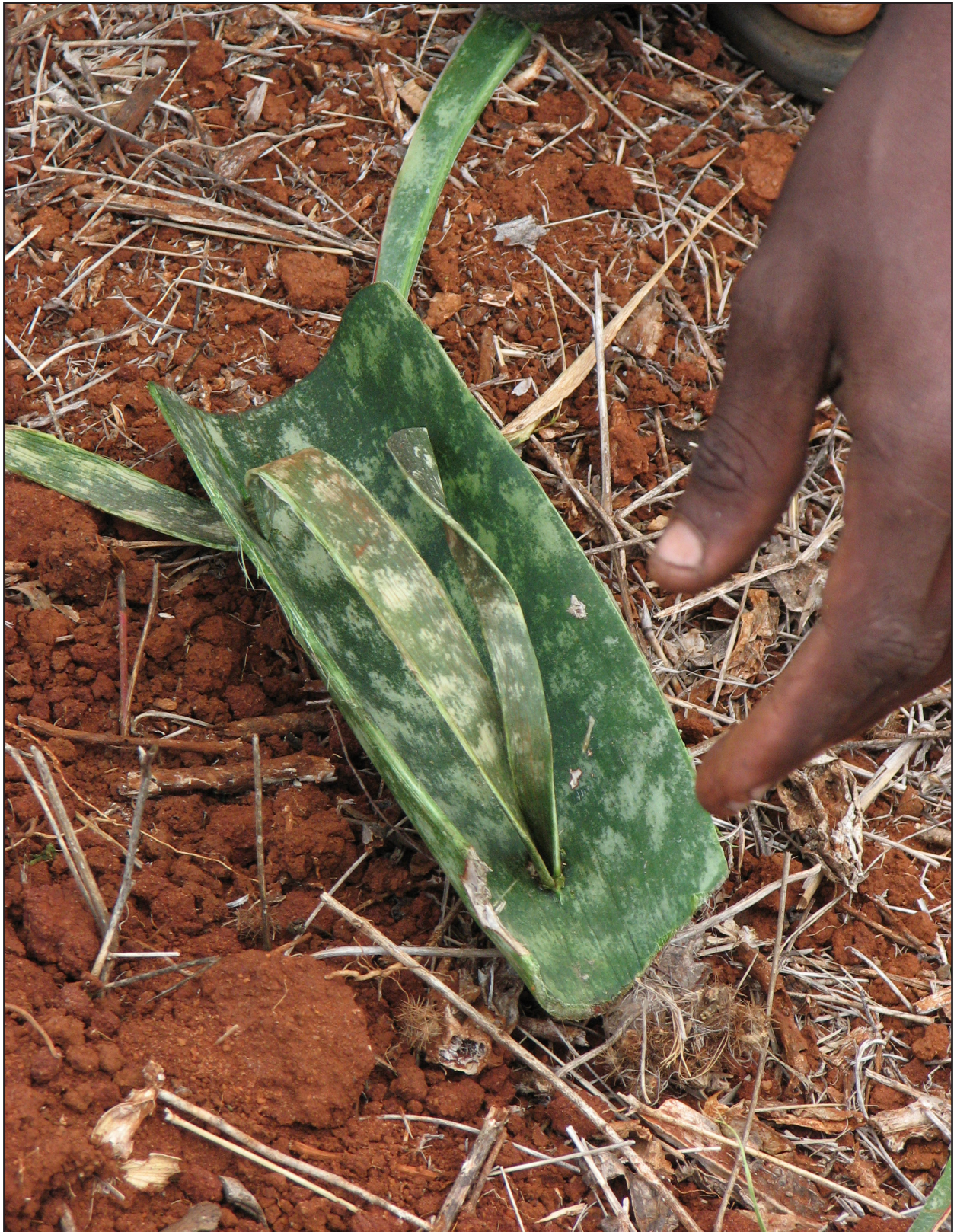
Figure 5. Sansevieria nitida Chahin. sandals made by children for play in Coast Province of Kenya.