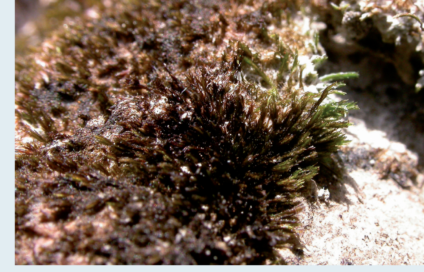
△ Fig. 3. Seligeria patula.

Records made from 1950 onwards are included in the above totals, and some may therefore be nearly 60 years old. Species such as Bryum knowltonii and Tortula wilsonii have declined since 1950 and are probably now present in fewer than 15 squares, even though they do not qualify for the nationally rare list on the basis of the total from 1950 onwards. However, for most species