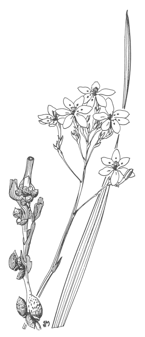
Figure 12 Morphology of Lapeirousia neglecta. Scale: 50%.