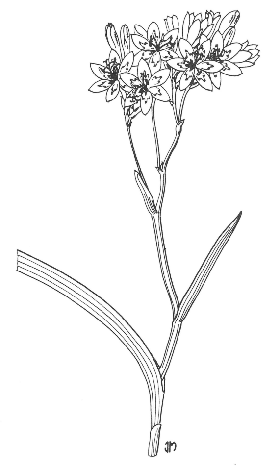
Figure 10 Morphology of Lapeirousia corymbosa. Scale: ×50%.