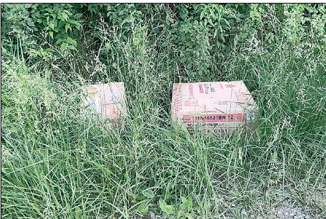
Shown are a couple of the packages found on Lessley Road.