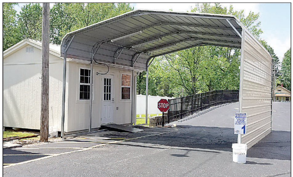
The hospital built this structure for conducting its lab work.

To nominate someone, or if you would like to run yourself, call Erica Goodwin at 618-806-6757.