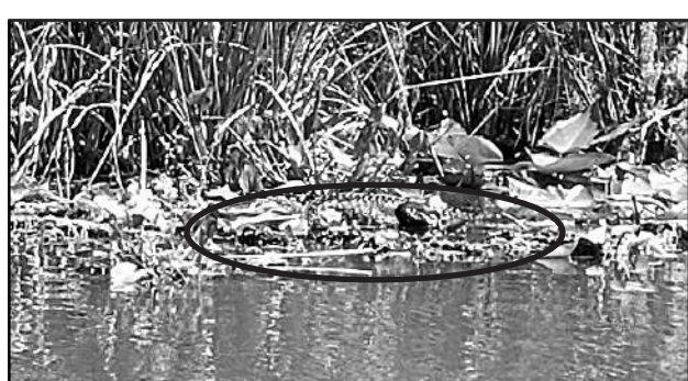
Even though the Florida gator in this photo is circled, it is still hard to see.

The Villages is a large retirement community in central Florida known for its numerous golf courses. We played almost every day with our good friends who now live there. The rule there is not to reach into the water to re-