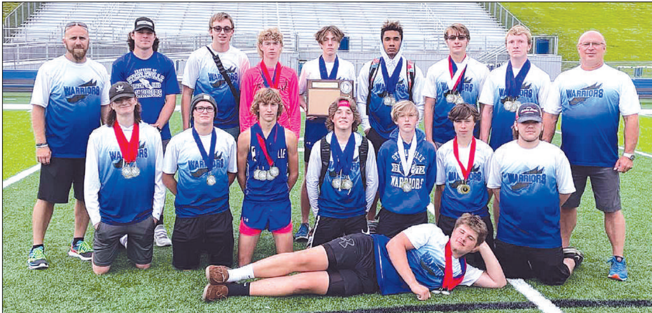
Steeleville High School athletes and coaches with their first-place plaque and medals